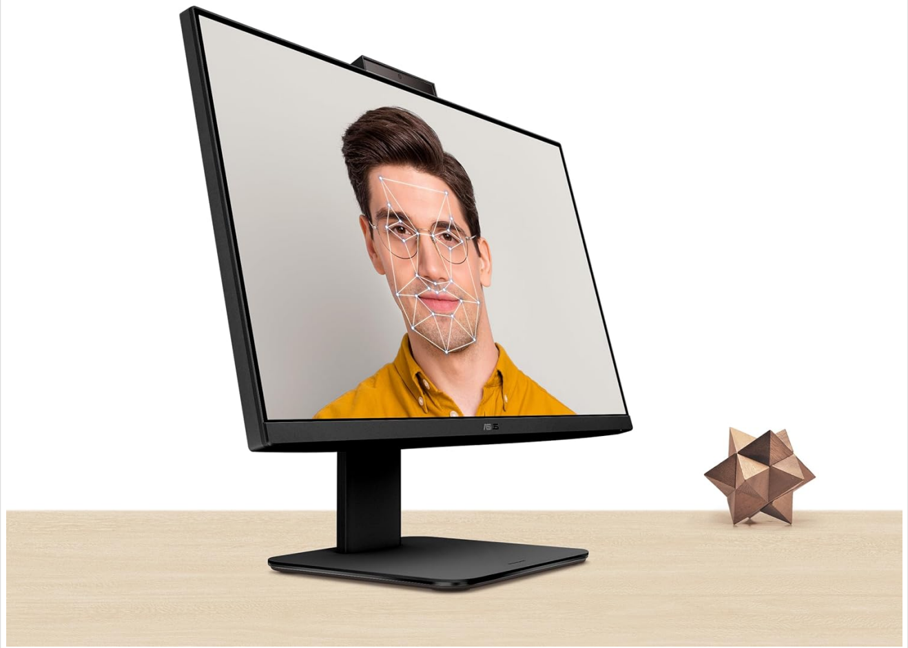
Image: The ASUS V470 display demonstrating AI camera features with a facial recognition overlay.

With AI noise-canceling for clear audio and an AI camera to enhance your appearance, the ASUS V400 AiO ensures an exceptional audio-visual experience.