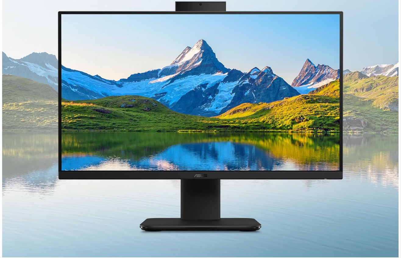
Image: The ASUS V470 display showcasing a clear, vibrant landscape.

The ASUS V400 AiO (V470VAK) features a NanoEdge display with 178° viewing angles, a thin bezel, and up to 93% screen-to-body ratio for near seamless edge-to-edge viewing.