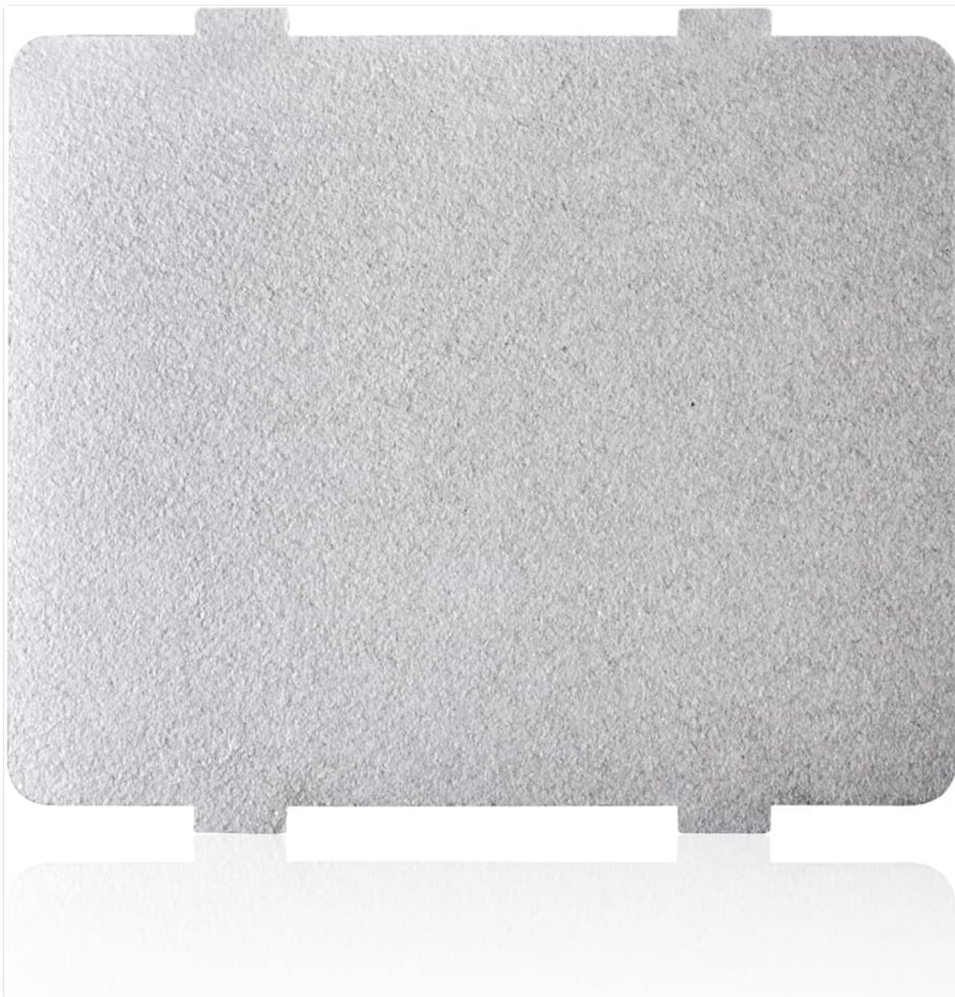
Figure 2.7: An internal component, possibly a filter or protective cover, for the appliance.