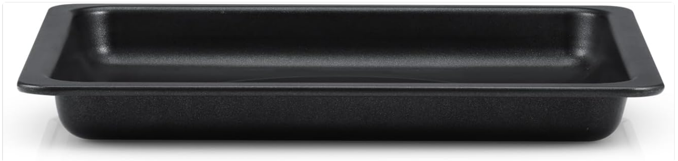
Figure 2.6: A standalone image of the baking tray, suitable for various baking and roasting tasks.