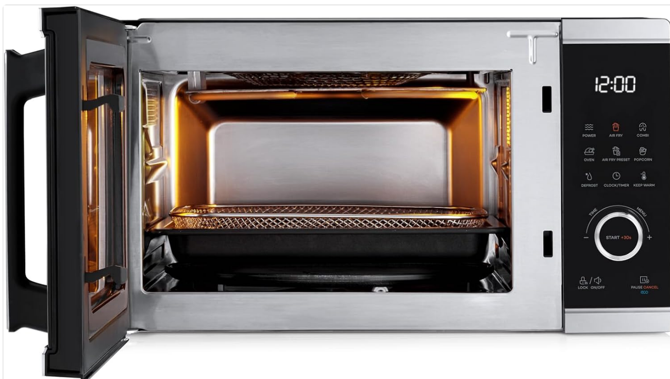
Figure 2.4: The interior of the appliance with the air fryer basket placed on top of the baking tray, demonstrating accessory usage for air frying or baking.