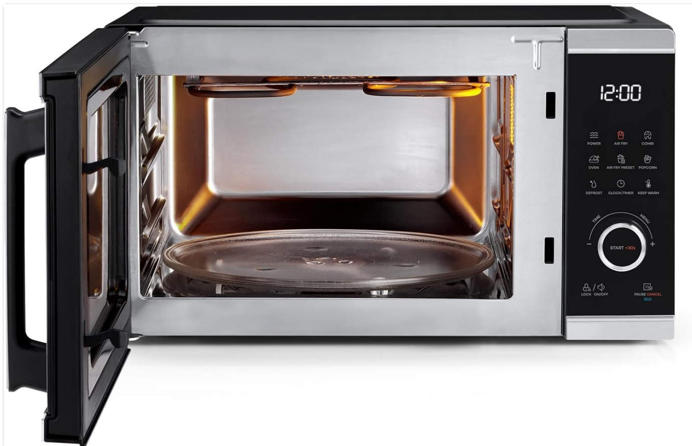
Figure 2.3: Close-up of the microwave interior, featuring the glass turntable and its support ring. The interior is illuminated, showing the heating elements.