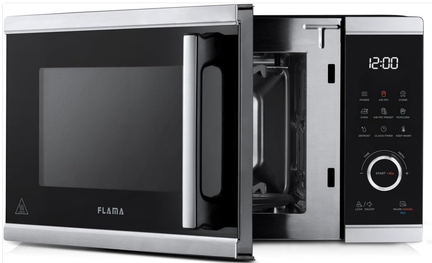
Figure 2.2: The appliance with its door open, revealing the interior cavity. The door opens to the left, showing the internal structure.