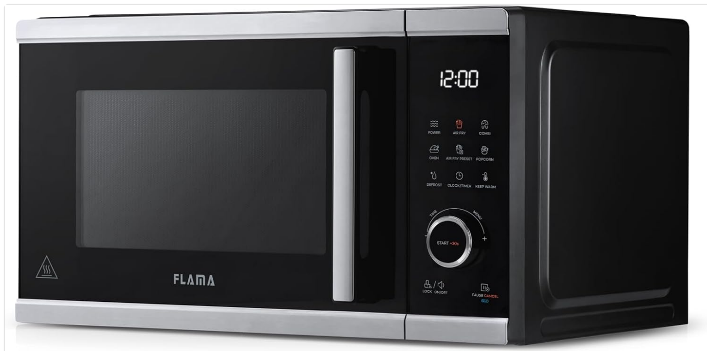
Figure 2.1: Front view of the FLAMA 1892FL Digital Microwave Air Fryer & Oven. This image shows the sleek black and silver design with the digital control panel on the right.