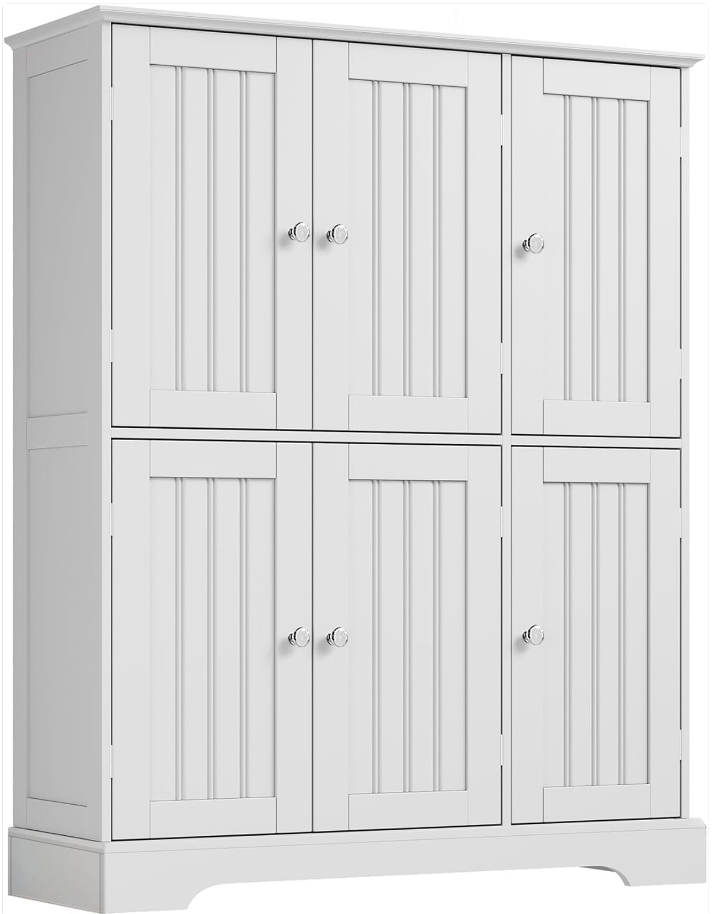
Image: The ChooChoo Bathroom Floor Cabinet, a white freestanding unit with six doors, positioned in a room.