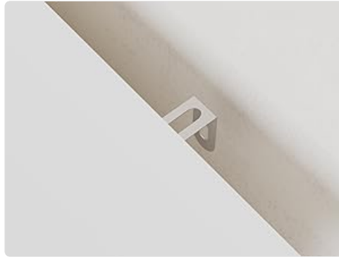
Image: A close-up view of the anti-tip device, which is crucial for securing the cabinet to a wall.