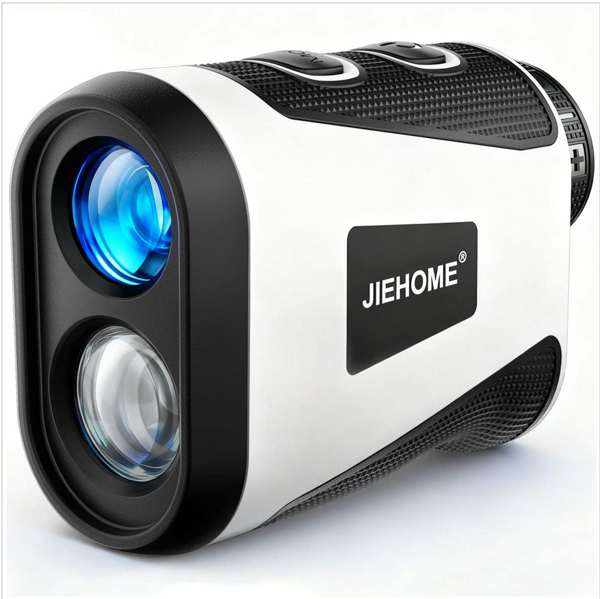
Image: JIEHOME X5 Golf Rangefinder, showcasing its compact design.