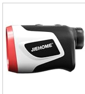
Image: Flag Lock feature with pulse vibration for accurate targeting.

This mode allows for quick and accurate locking onto the flagstick, even with shaky hands. Once the flag is locked, the device provides a pulse vibration confirmation, ensuring you have targeted the correct object and not background elements.