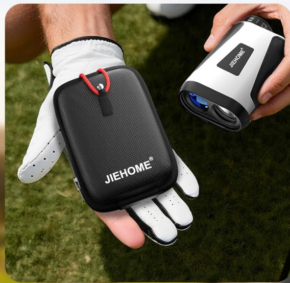
Image: Magnetic, compact, and portable design of the rangefinder, including its carry case.