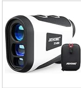
Image: Visuals for Horizontal & Vertical Distance, Speed Measurement, and Continuous Scan modes.