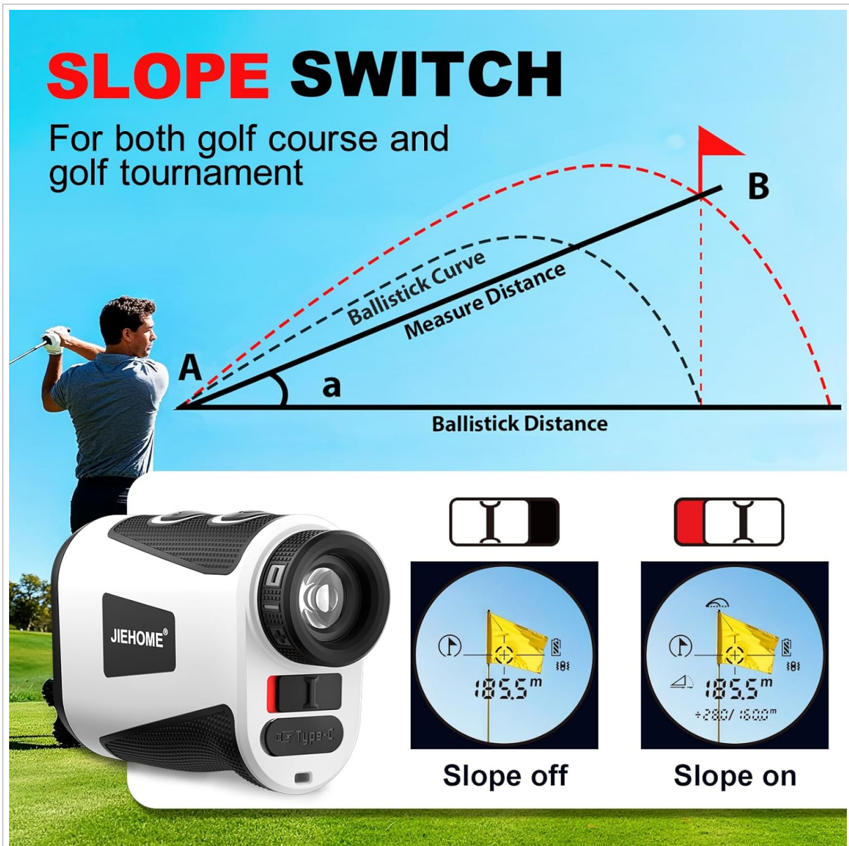
Image: Explanation of the Slope Switch feature, showing its application for both golf course play and tournaments.