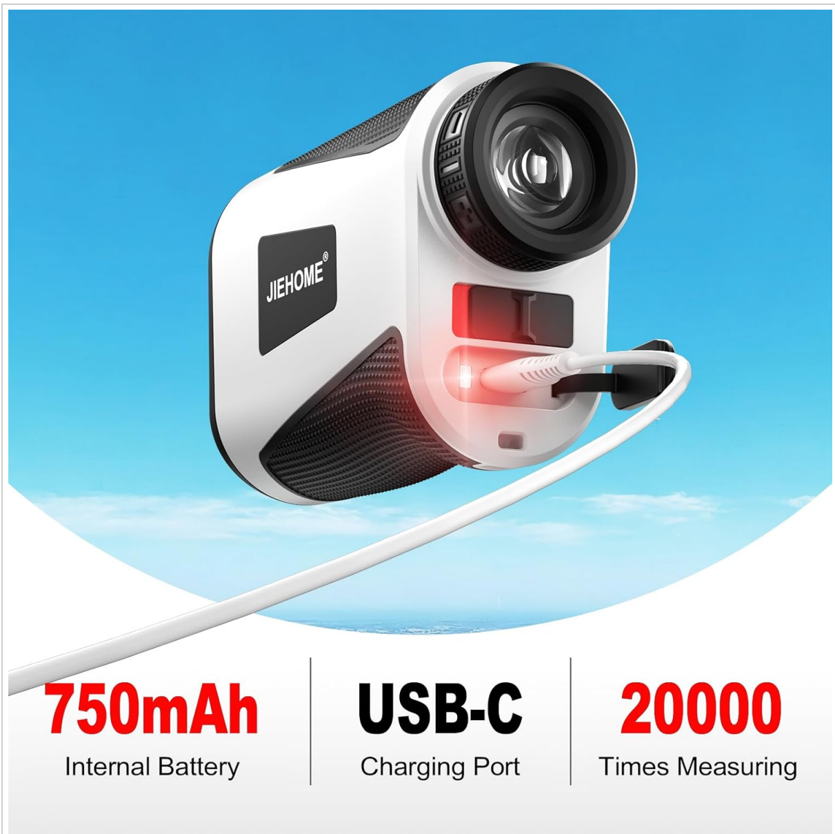
Image: JIEHOME X5 Rangefinder connected for USB-C charging.