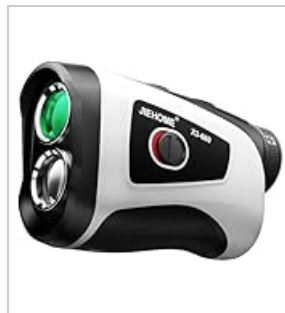
Image: Displaying the measuring range and magnification capabilities.

The JIEHOME X5 Rangefinder offers a 1,200-yard range with a \pm 1 yard accuracy. It features 7x magnification and fully multi-coated lenses for a bright, sharp view, reducing glare and enhancing contrast.