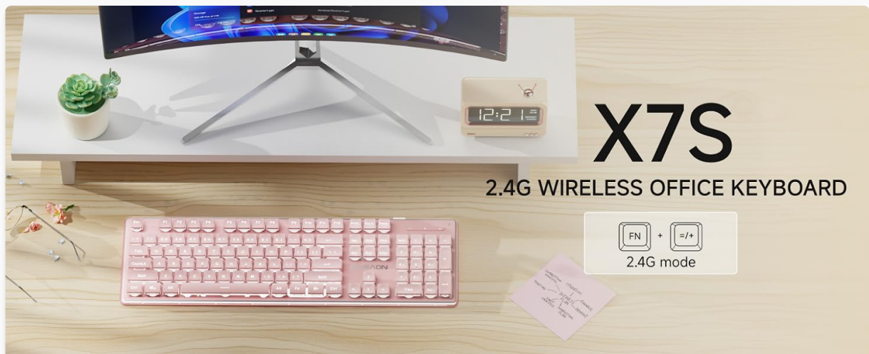
Image: Visual representation of the 2.4G Plug & Connect and Rechargeable features of the keyboard.

Image: The EWEADN X7S Wireless Keyboard connected via its 2.4G USB receiver to a laptop.