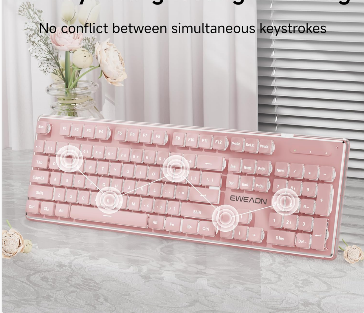
Image: A visual representation of the 26-key anti-ghosting feature, showing multiple keys being pressed without conflict.

No conflict between simultaneous keystrokes