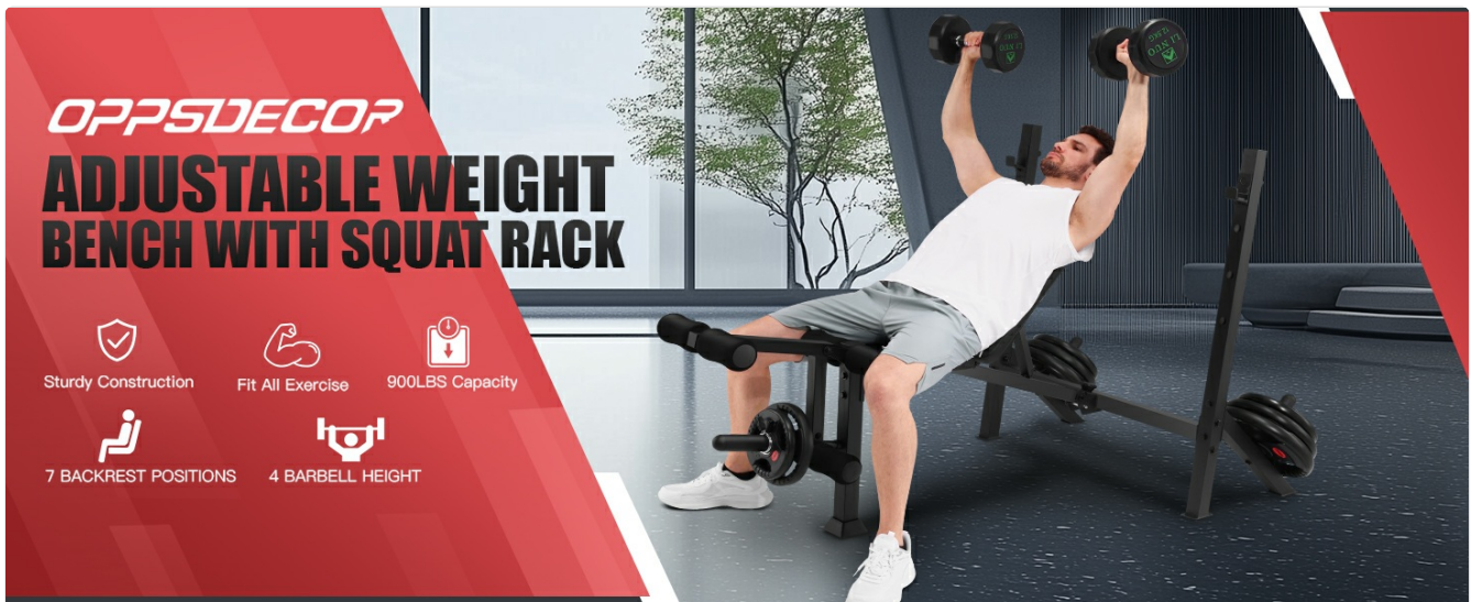
Image 3.1: Overview of the OPPSDECOR Weight Bench Set with Squat Rack. This image displays the complete assembly of the weight bench, including the adjustable squat rack, the main bench with its backrest and seat, and the integrated leg extension/curl attachment. It highlights the robust black frame and the comfortable black and white padded sections.