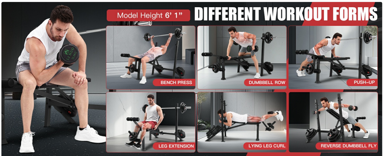
Image 5.2: Different Workout Forms on OPPSDECOR Weight Bench. This image displays a collage of various exercises that can be performed using the weight bench, including bench press, dumbbell row, push-up, leg extension, lying leg curl, and reverse dumbbell fly. It illustrates the versatility of the equipment for a full-body workout.