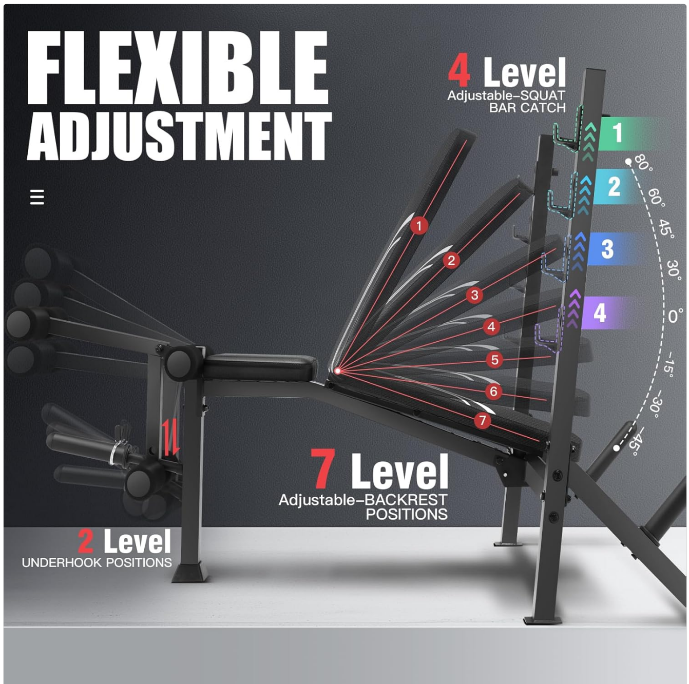
Image 4.1: Flexible Adjustment of the OPPSDECOR Weight Bench. This image illustrates the various adjustable positions of the bench's backrest and the J-hook for the barbell. It shows the 7-level adjustable backrest positions and the 4-level adjustable squat bar catch, demonstrating the versatility for different exercises.

The bench is designed for easy folding to save space. To fold, remove the spring pin and fold the bench vertically. To unfold, reverse the process, ensuring all locking mechanisms are securely engaged before use.