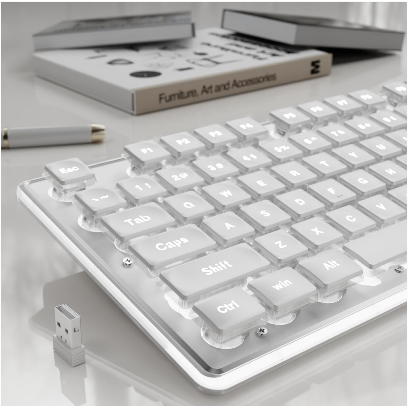
Image: The SEUNKWANG EWEADN X7S wireless keyboard in white, showcasing its full-size layout and sleek design.