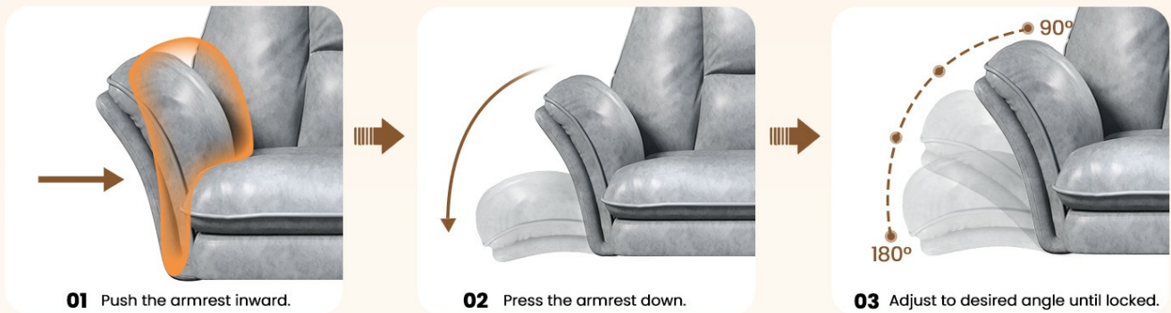
Image: Demonstrates the versatility of the flip-up armrests, allowing for cross-legged sitting or providing space for pets.