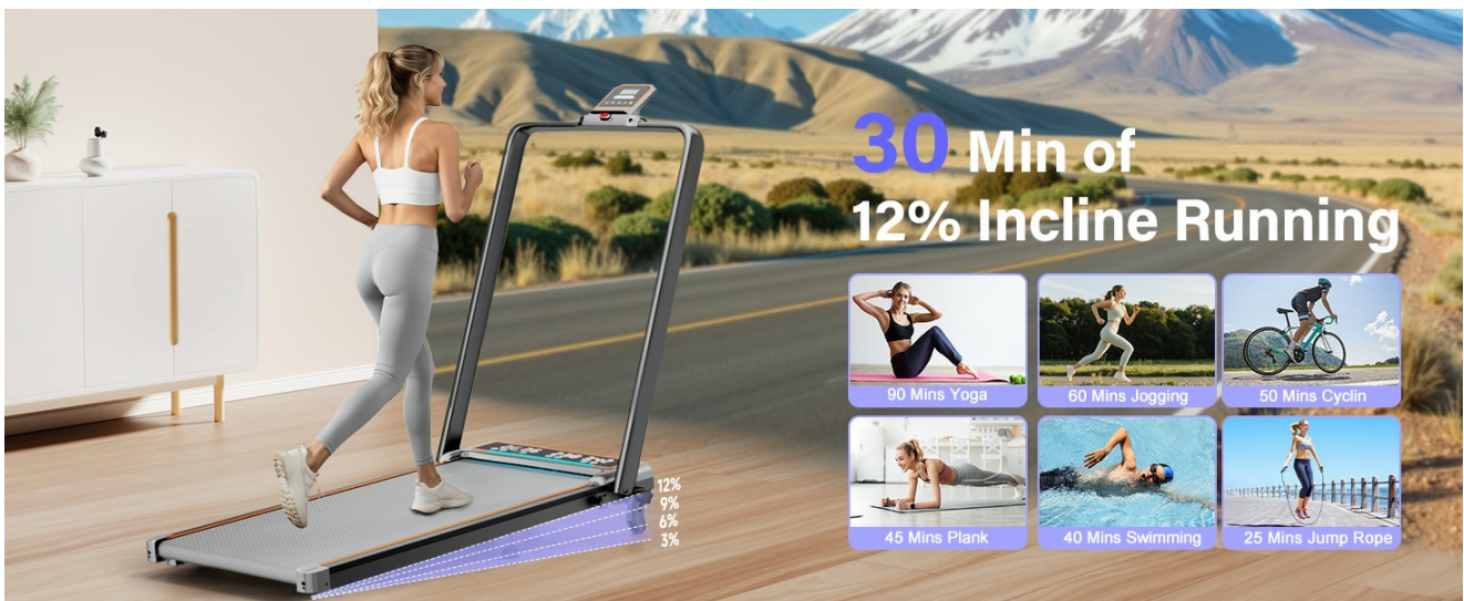
Image: The treadmill demonstrating its adjustable incline feature, showing a user exercising on an elevated surface.

Manually adjust the incline to one of four levels: 3%, 6%, 9%, or 12%. This simulates uphill walking/running and can increase calorie burn by up to 150% compared to a flat surface.