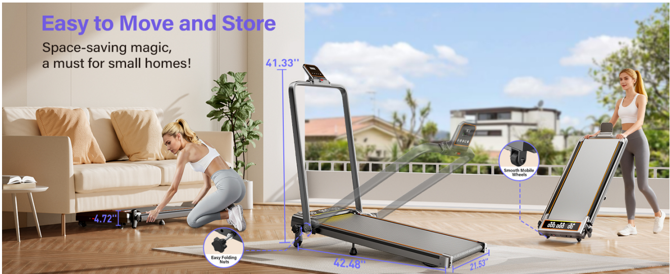
Image: The treadmill shown in both its upright and folded positions, highlighting its space-saving design and ease of movement with built-in wheels.

Space-saving magic, a must for small homes!