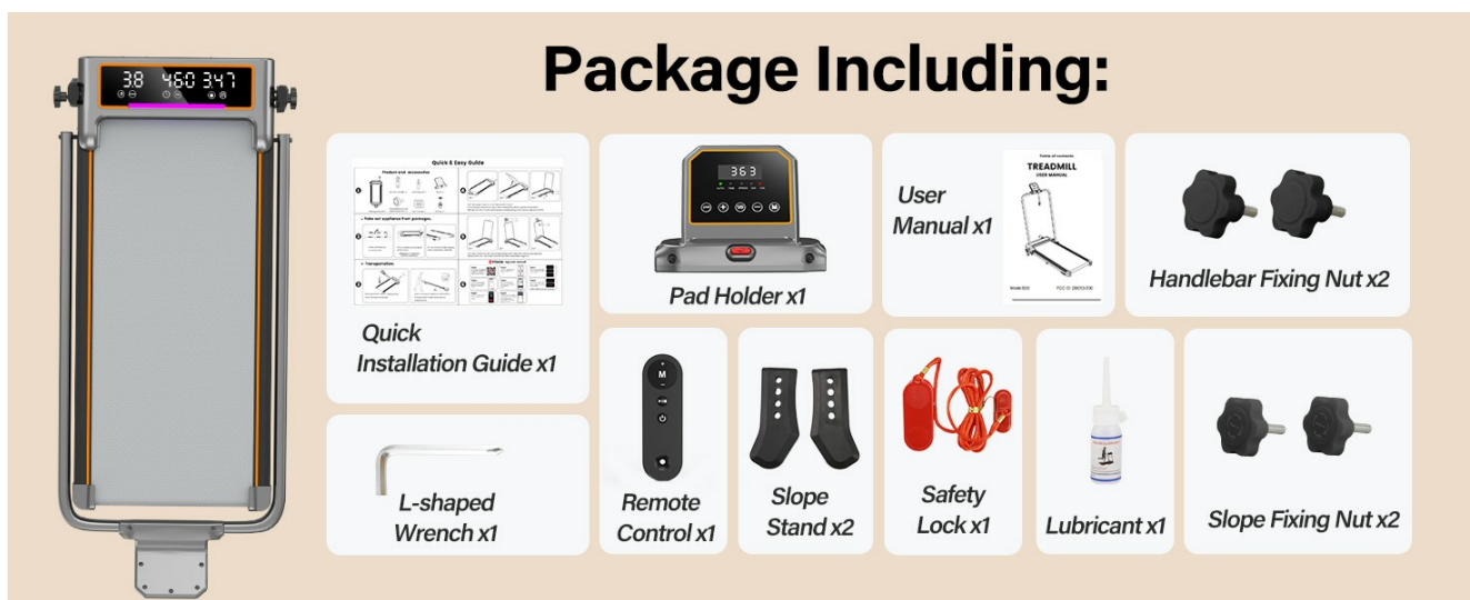
Image: A visual representation of all items included in the Trisomy Walking Pad Treadmill package.