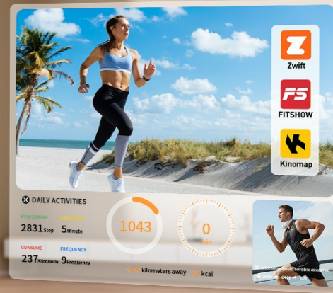
Image: A smartphone displaying the FITSHOW app, showing its features for tracking workouts and customizing plans.

Customize your own exercise journey with the exclusive FITSHOW APP!