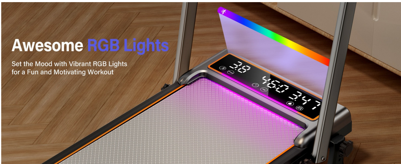
Image: The treadmill's RGB lighting feature, which changes colors with speed to enhance the workout experience.

The integrated RGB light strips automatically change colors based on your speed, creating an engaging and motivating workout environment.