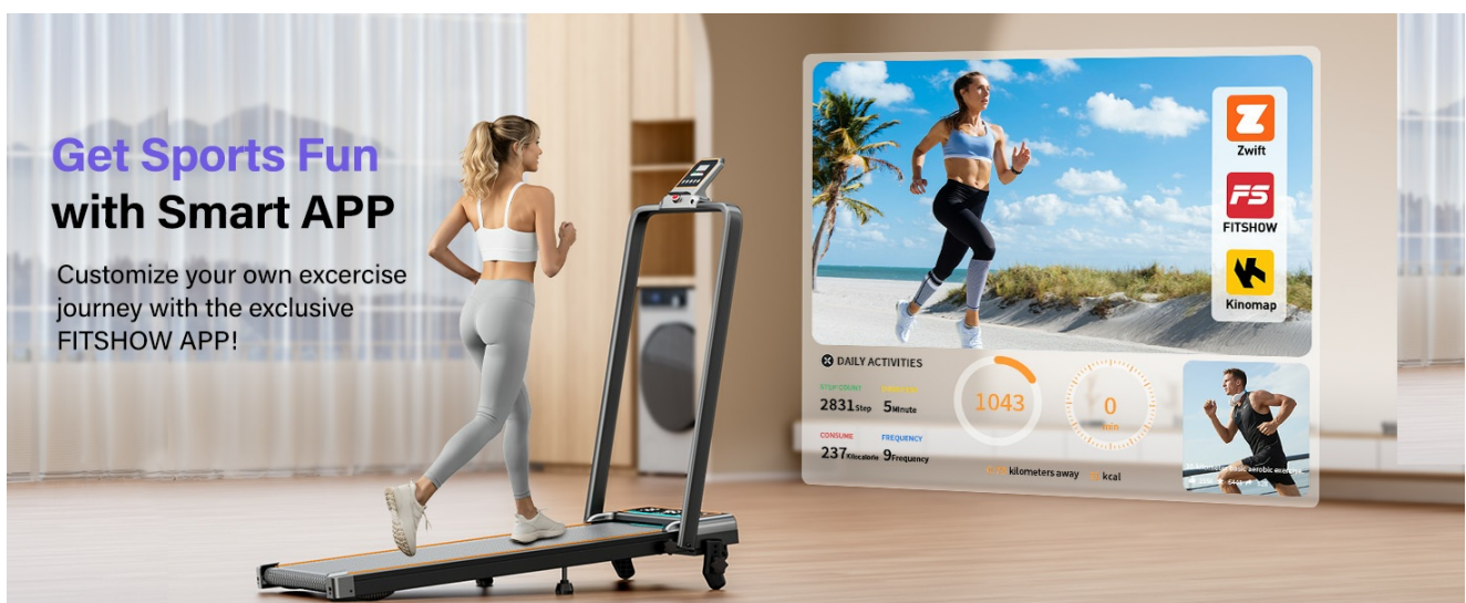
Image: A visual guide to the console, remote, and app controls for the treadmill.

The treadmill can be controlled via the console buttons, the remote control, or a dedicated smartphone application.