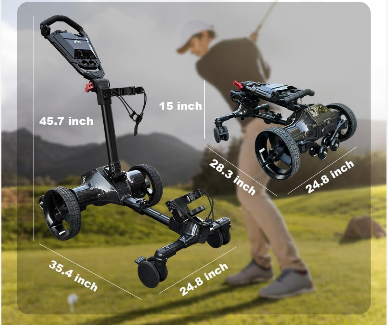
Figure 4: The G3 Electric Golf Cart shown with its dimensions in both the unfolded and easily folded configurations, emphasizing its compact design.