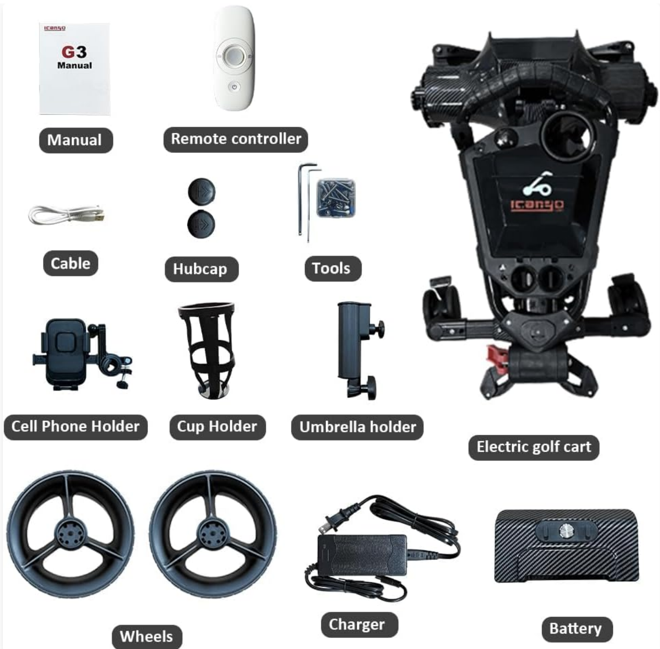
Figure 2: A visual representation of all items included in the G3 Electric Golf Cart package, such as the cart, remote, charger, and various holders.