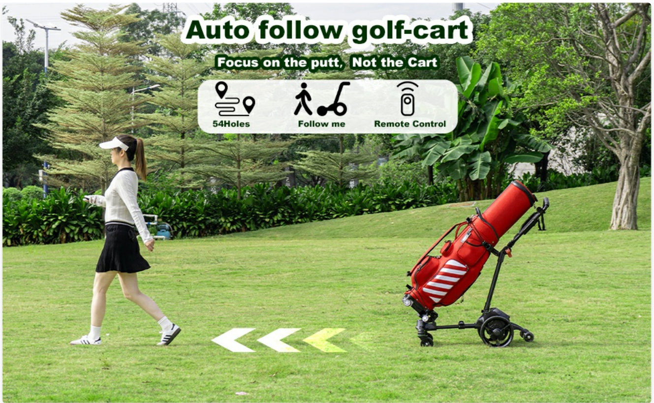
Figure 6: An illustration of the multiple control modes available for the electric golf cart, including manual, auto-follow, remote control, and one-click recall.

Your browser does not support the video tag.