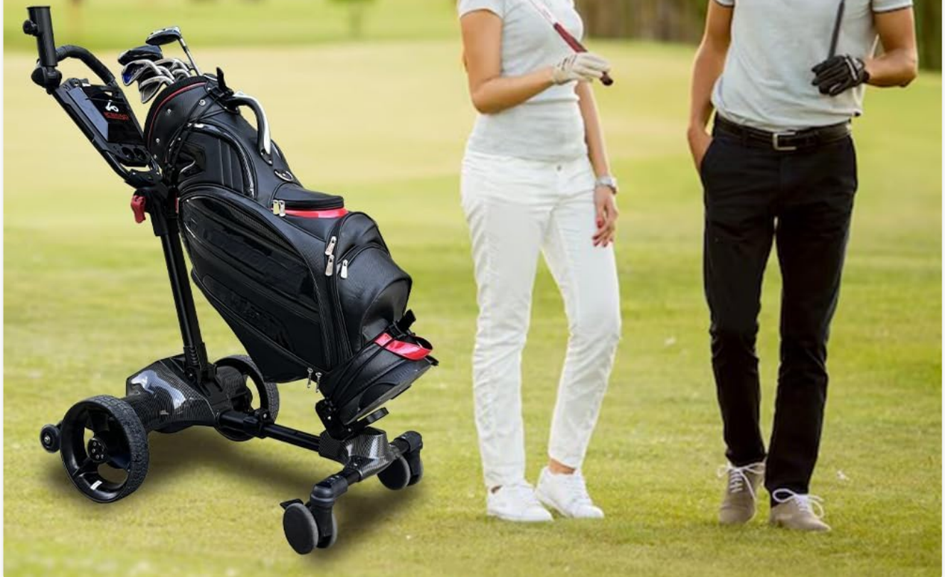
Figure 1: The G3 Electric Golf Cart on a golf course, highlighting its auto-follow, remote driving, and one-click summon capabilities.

Your browser does not support the video tag.