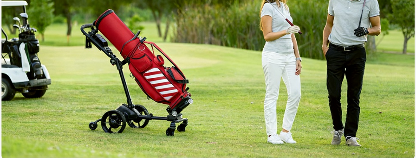
Figure 5: A golfer walking on the course with the electric golf cart automatically following behind, demonstrating the smart auto-follow feature.

Auto Follow Electric Golf Caddy Swing Freely, It Follows Closely