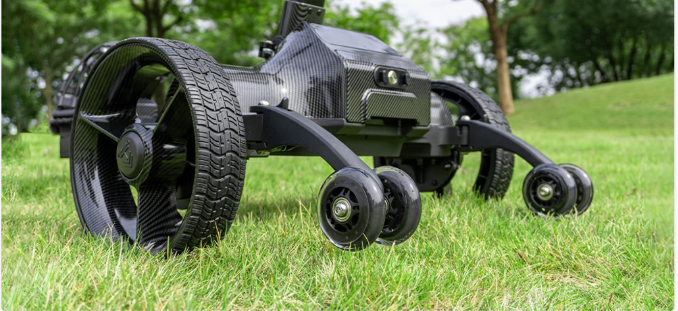
Figure 9: The G3 Electric Golf Cart in its compact, folded state, easily fitting into the trunk of a car for convenient transportation.

Anti tip wheels conquer golf hills with ease, every uphill swing feels light and right