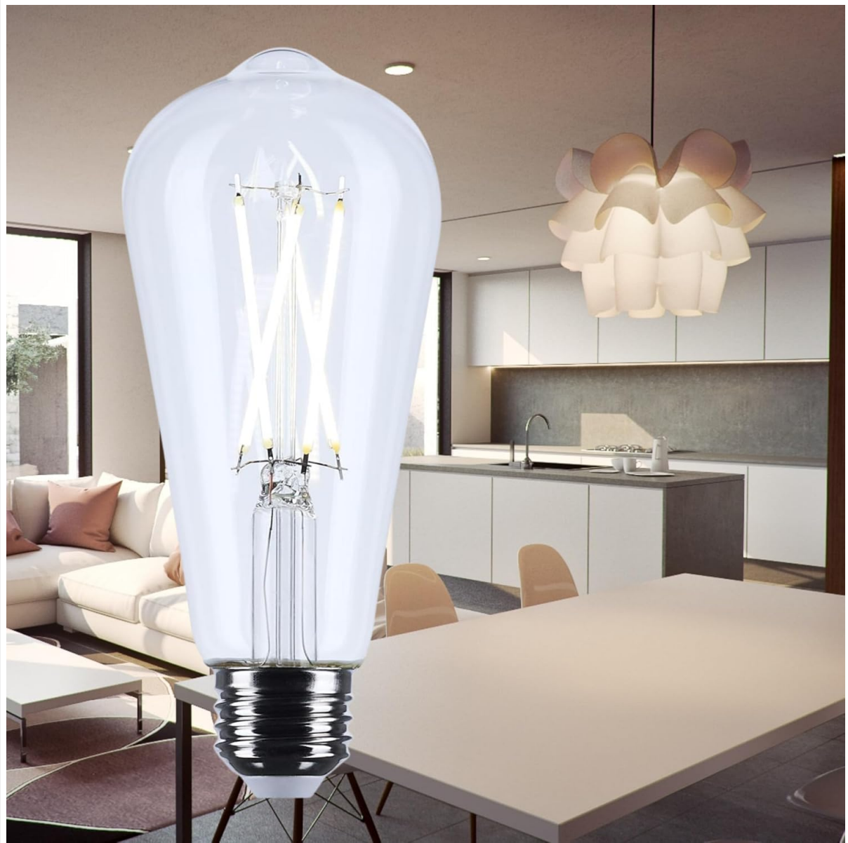
Image: The Satco ST19 LED bulb installed in a fixture, providing illumination to a modern living room and kitchen area.