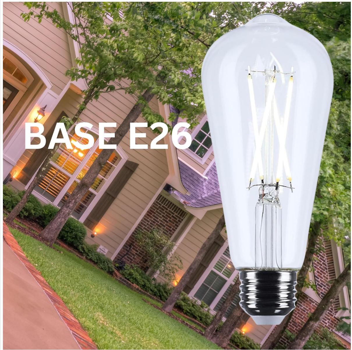
Image: Close-up of the E26 medium base of the Satco LED bulb, indicating its standard screw-in design.