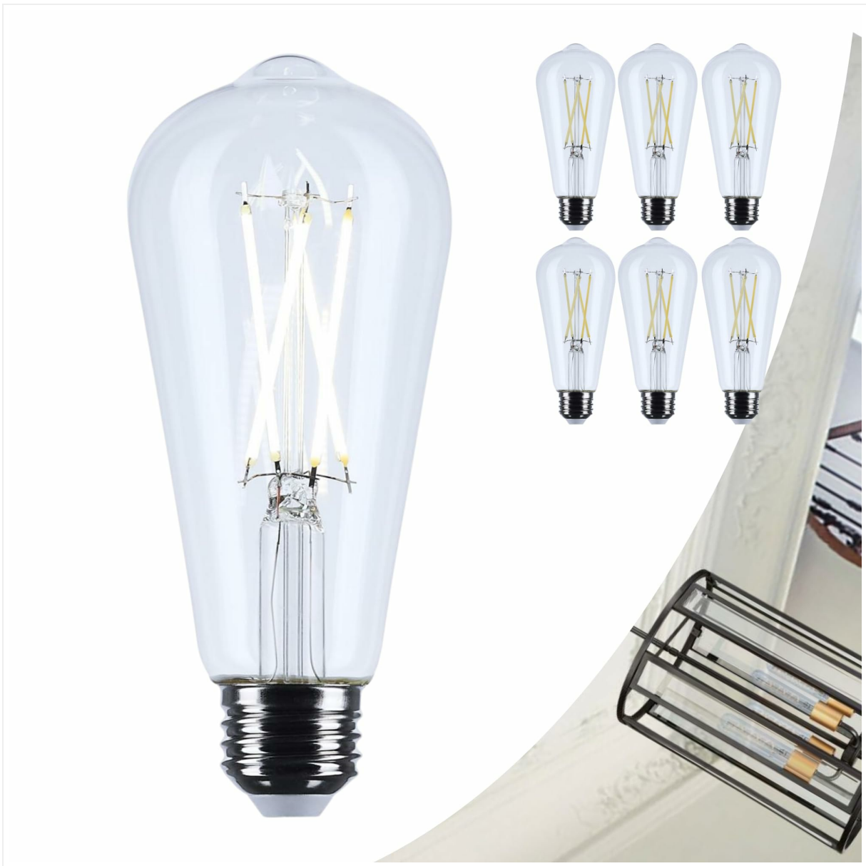
Image: The Satco S12535 ST19 LED Light Bulb, clear glass with visible filaments.