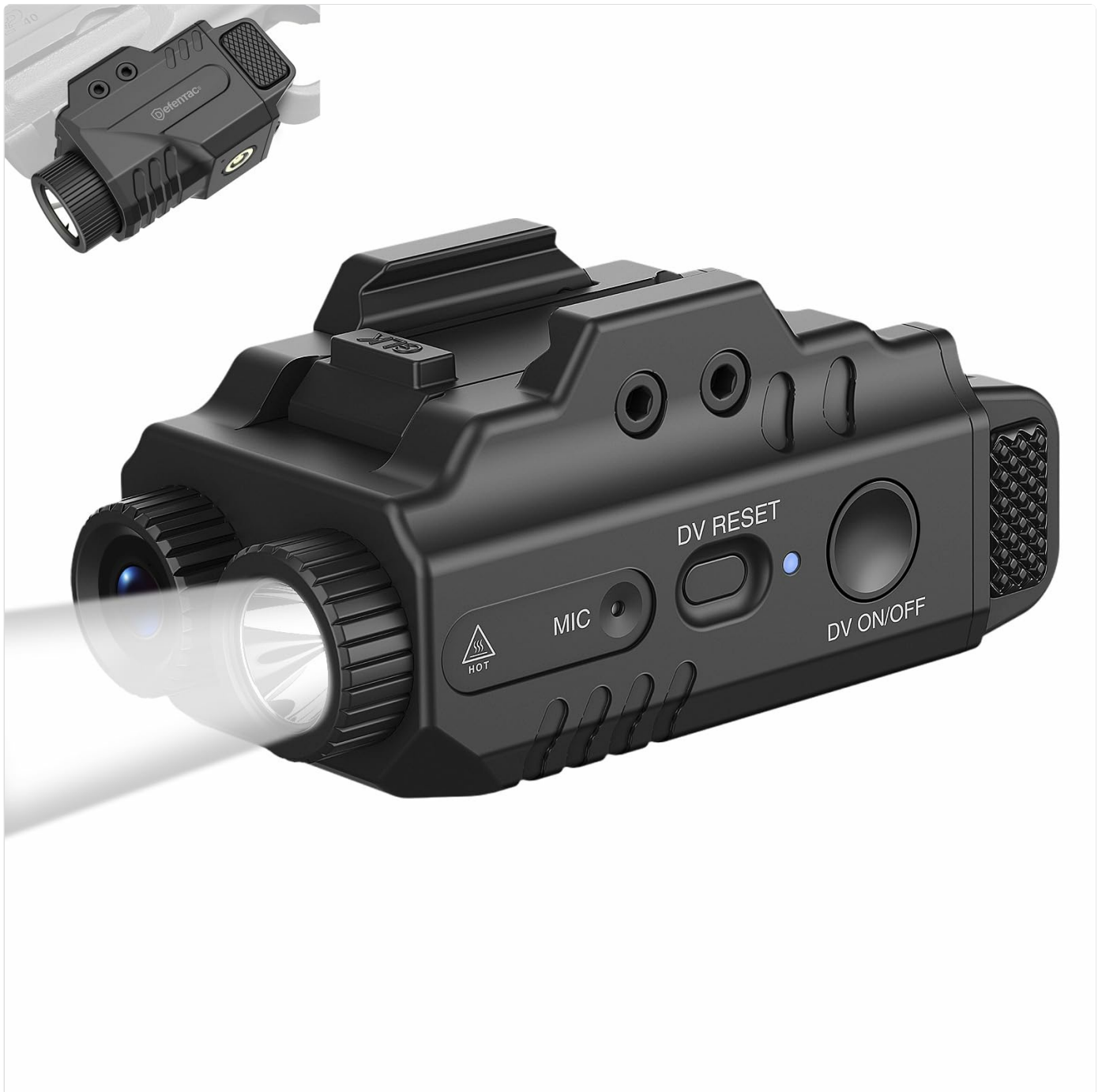
Image 1.1: The DEFENTAC HD1080P Camera and 500 Lumens Flashlight Combo (Model DF-1062D).