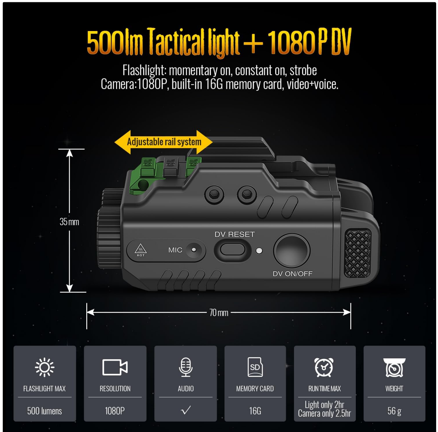
Image 5.1: The DEFENTAC DF-1062D showing its adjustable rail system for mounting and overall dimensions.

The device features an adjustable rail system for secure attachment. Use the provided hex key to adjust the mounting bolt and secure the device to a compatible rail. Ensure the device is firmly attached before use.