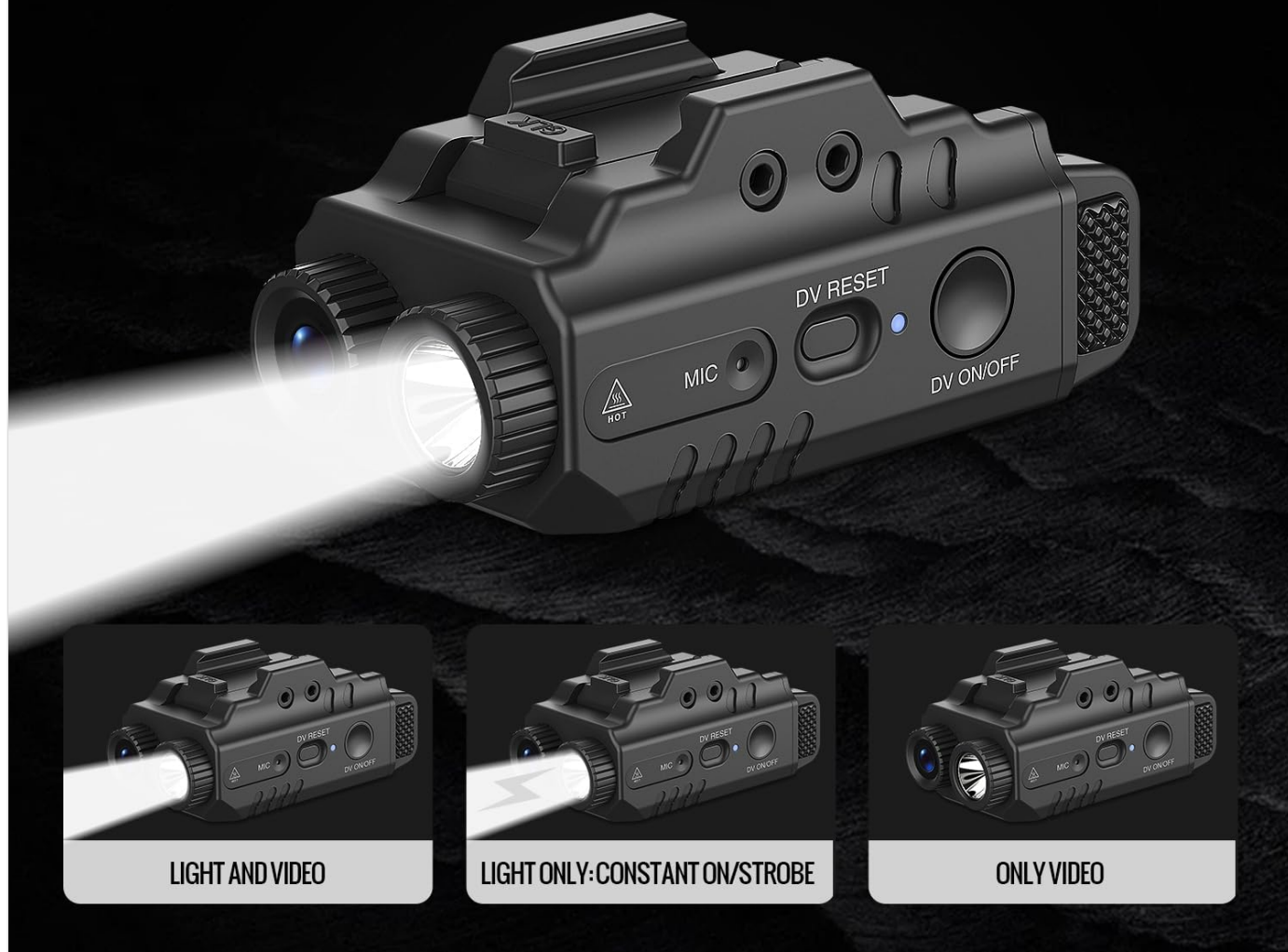
Image 6.1: Illustration of the three primary operation modes: Light and Video, Light Only (Constant On/Strobe), and Only Video.

The home defense advocates/ training/ hunting recording.