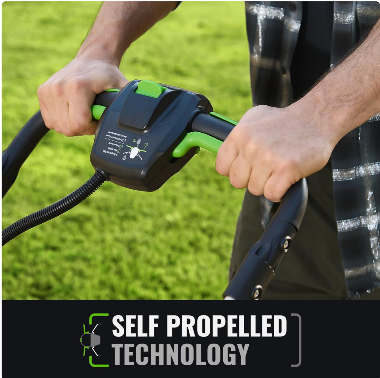
Figure 4.2: Close-up of the NovorikX lawn mower's handle controls, showing the self-propelled lever. Engaging this lever activates the self-propelled technology.

The self-propelled system assists in moving the mower forward, reducing physical effort.