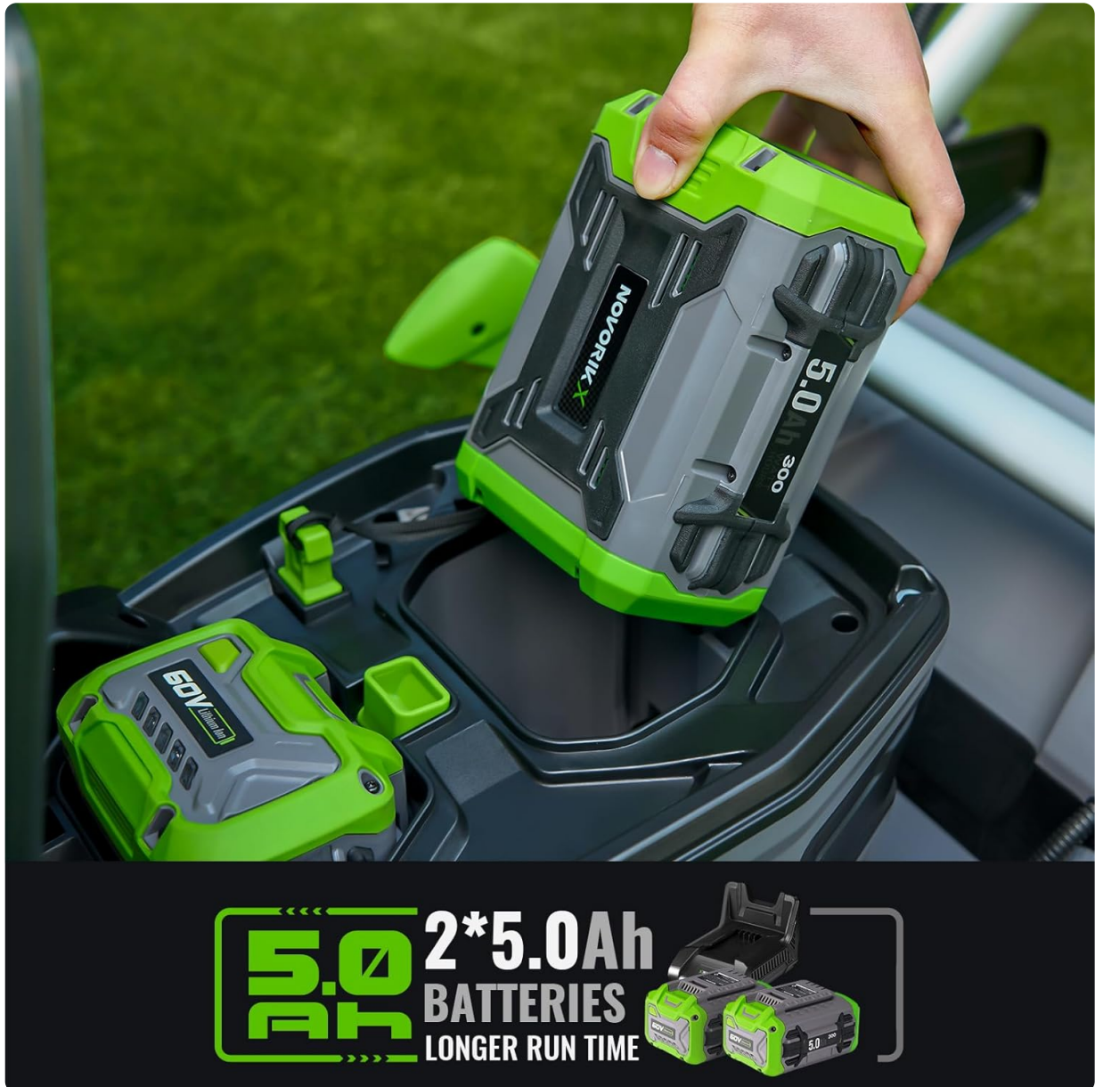
Figure 3.1: A hand inserting the 5.0Ah battery pack into the designated battery compartment of the NovorikX 60V lawn mower. Ensure the battery clicks into place securely.