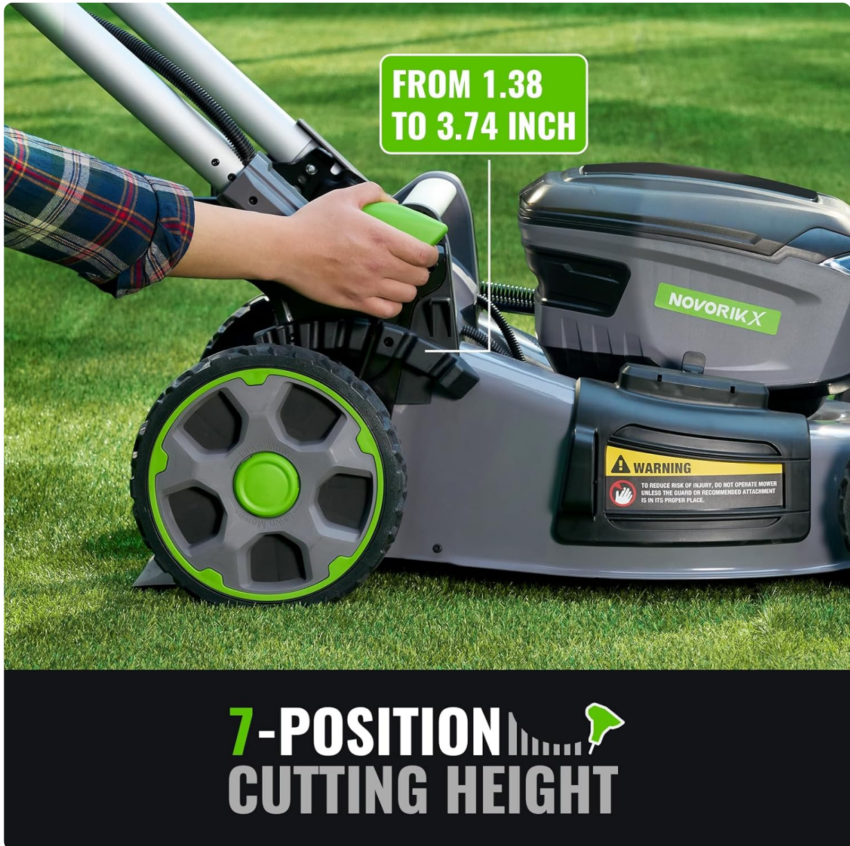
Figure 4.1: A hand adjusting the single-point cutting height lever on the NovorikX lawn mower. The lever allows selection from 7 positions, ranging from 1.37 to 3.74 inches.

The mower offers 7 cutting height positions, ranging from 1.37 inches to 3.74 inches.