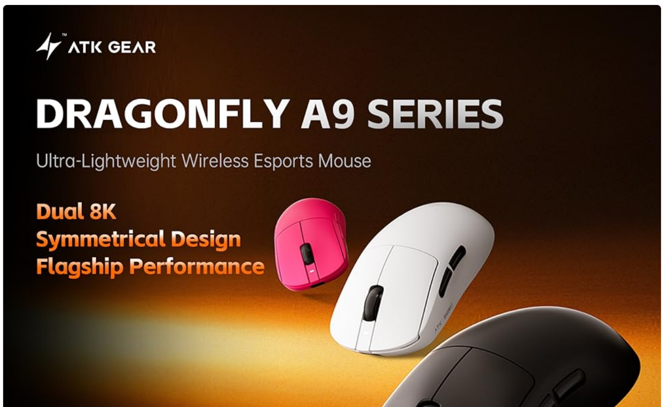
Image: ATK Dragonfly A9 Ultra Max Wireless Gaming Mouse overview, highlighting its lightweight design and core technologies.

The ATK Dragonfly A9 Ultra Max is a high-performance wireless gaming mouse designed for competitive esports. It features an ultra-lightweight build, a PAW3395 Ultra sensor, Nordic 54L15 MCU, and supports up to 8K polling rate for precise and responsive control. This manual provides essential information for setting up, operating, maintaining, and troubleshooting your device.