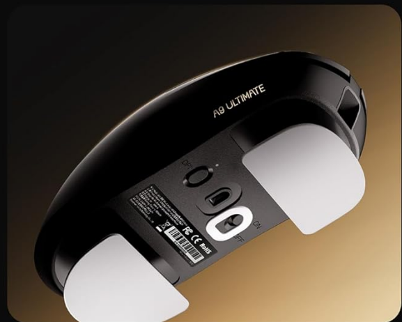
Image: The ATK Dragonfly A9 Ultra Max mouse shown with its wireless dongle and USB-C charging/data cable.

2700mm 2 +, Bottom shell coverage rate exceeds 50%