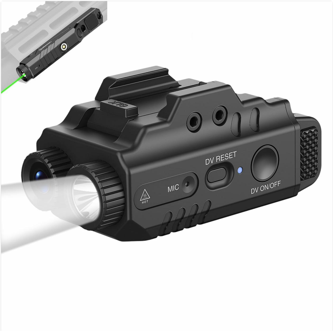
Figure 1: DEFENTAC HD1080P Camera and 500 Lumens Light Combo Bundle (Model DF-9031).