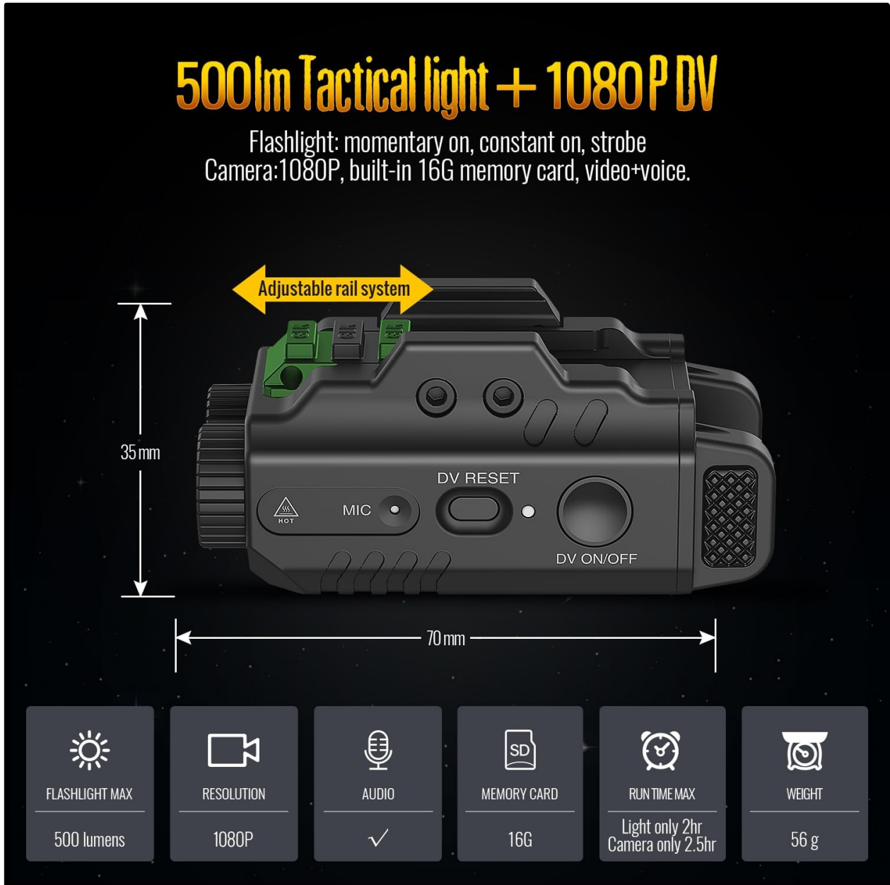
Figure 5: Visual representation of the DF-9031's dimensions and core specifications.