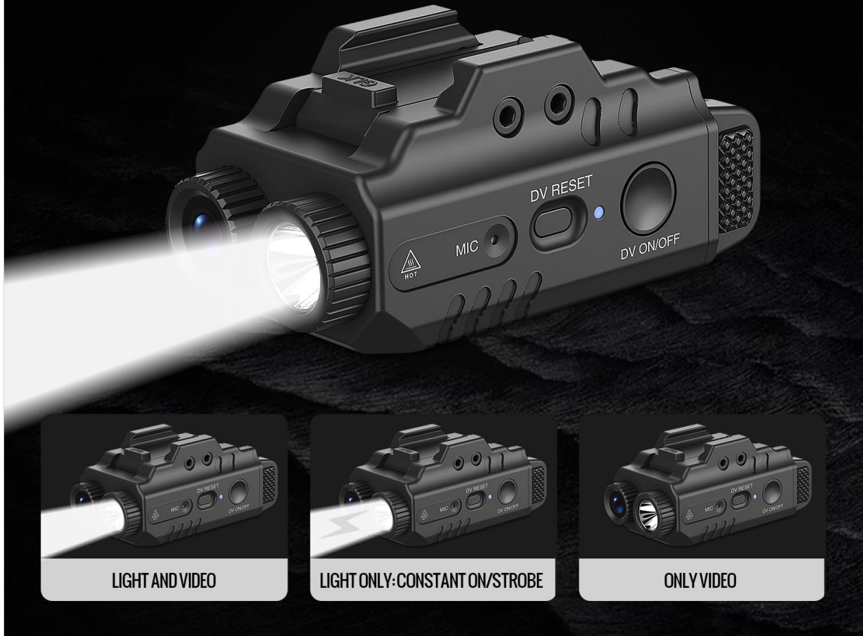
Figure 6: The DF-9031 supports various operational modes: simultaneous light and video recording, light-only (constant or strobe), and video-only recording.

The home defense advocates/ training/ hunting recording.