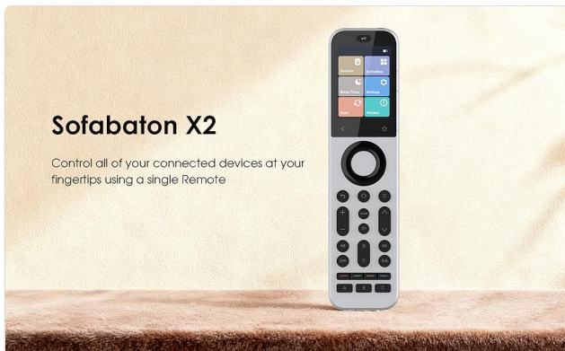
Figure 1: The SofaBaton X2 remote integrating with Home Assistant, Google Assistant, and Amazon Alexa to control various devices.