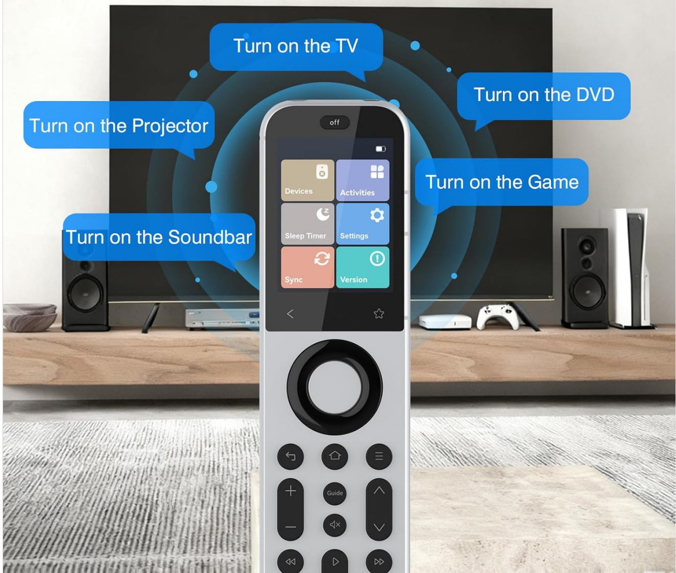
Figure 5: The SofaBaton X2 touchscreen interface for device and activity selection.