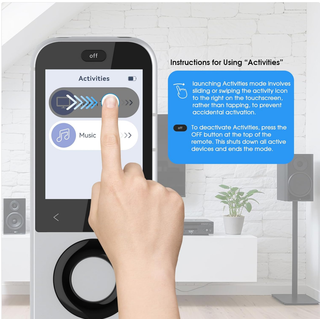
Figure 6: Instructions for launching activities by swiping on the touchscreen.