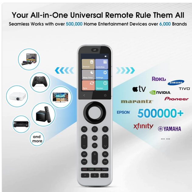
Figure 2: SofaBaton X2 remote control with a list of compatible brands and devices.