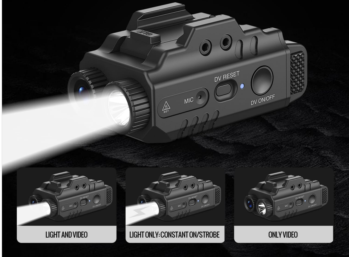
Figure 5: Operational Modes. The device supports simultaneous Light and Video, Light Only (constant or strobe), and Video Only modes.

The home defense advocates/ training/ hunting recording.