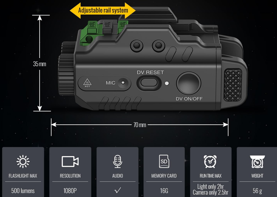
Figure 4: Product Specifications and Dimensions. Visual representation of key technical specifications and physical measurements.

Flashlight: momentary on, constant on, strobe Camera: 1080P, built-in 16G memory card, video+voice.