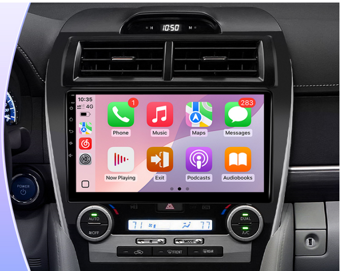
Image: Installation Effect Comparison. This image compares the seamless installation of the Leadfan product with the less aesthetically pleasing fit of a traditional universal product.

Installation is troublesome and requires complex wiring.