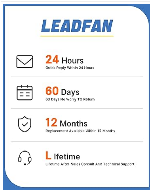
Image: Leadfan Customer Support Information. This image outlines the support policies including 24-hour quick reply, 60-day return, 12-month replacement, and lifetime technical support.