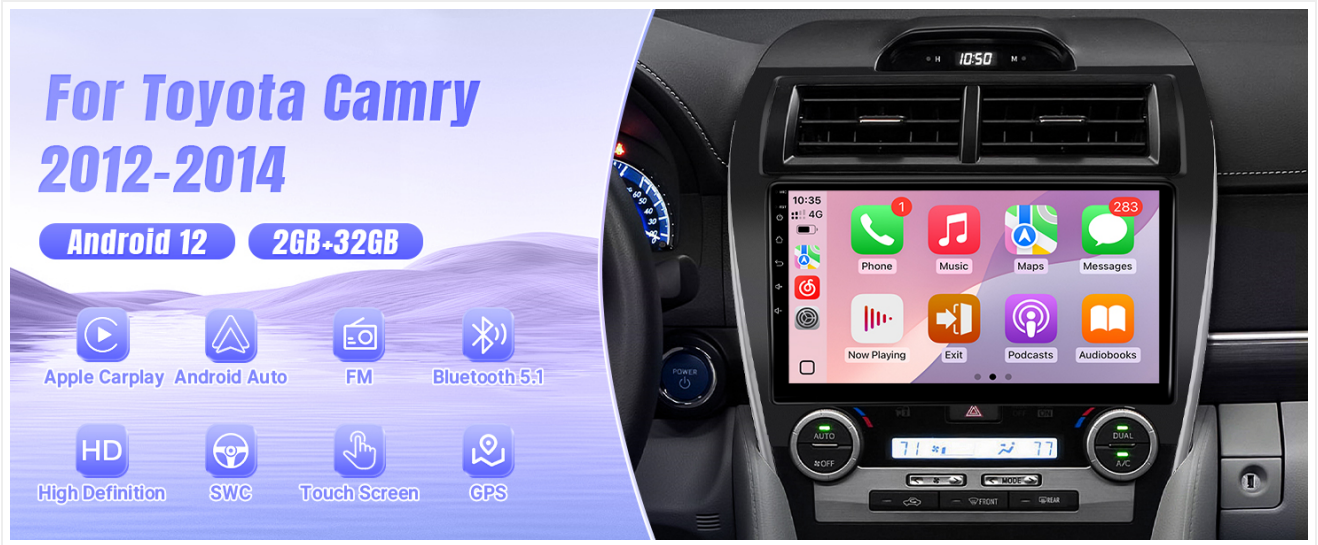
Image: Installation Example. This image shows the Leadfan unit installed in a Toyota Camry dashboard, demonstrating its integrated appearance.

The unit features plug-and-play harnesses designed to simplify installation, eliminating the need for complex wiring in most cases. The custom-molded frame ensures a perfect fit within your Toyota Camry's dashboard, avoiding gaps often seen with universal models.