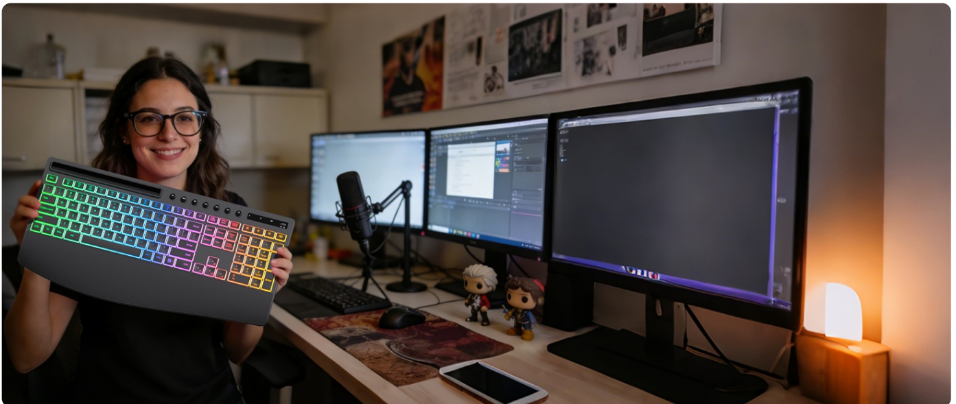
Image: Trueque KM22 Ultra Wireless Keyboard and Mouse Combo, showcasing its full-size design and integrated wrist rest.

The Trueque KM22 Ultra Wireless Keyboard and Mouse Combo offers a full-size, backlit typing experience with a comfortable wrist rest and convenient phone holder. Designed for versatility, it connects wirelessly via a 2.4G USB-A/Type-C receiver, making it compatible with various devices including PCs, laptops, Windows, and Chrome OS. Its quiet keys and long-lasting rechargeable battery ensure an efficient and undisturbed work or gaming environment.