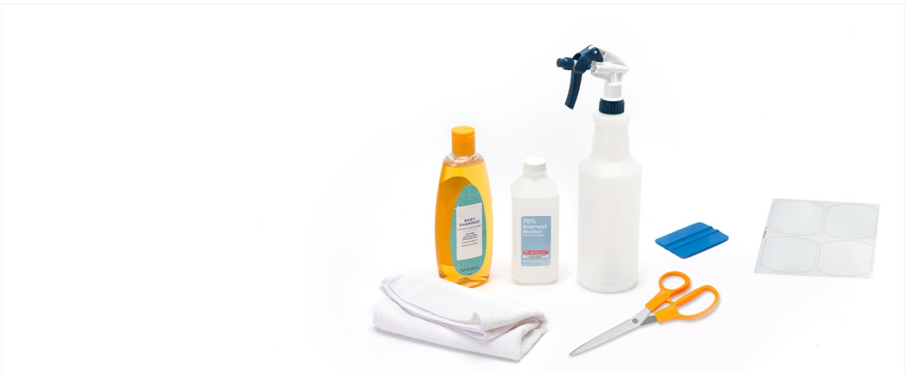
Image: A collection of items typically used for protective film installation, including spray bottles, a squeegee, scissors, and a microfiber cloth.