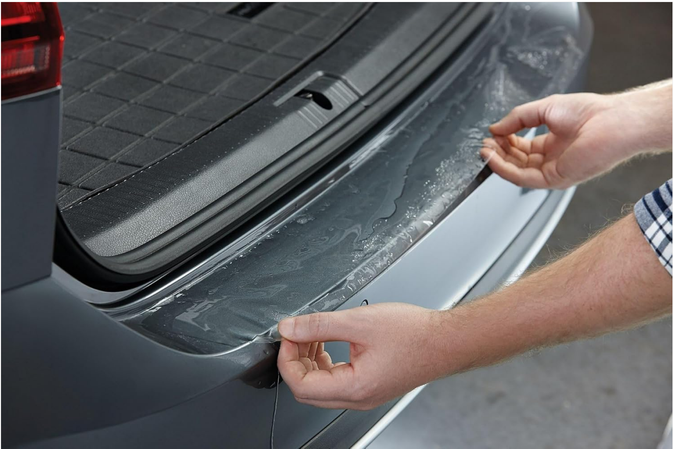
Image: Hands applying the clear protective film to the top edge of a vehicle's rear bumper, demonstrating protection for the trunk sill area.