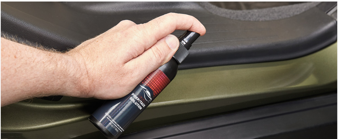
Image: A hand spraying a clear solution onto a vehicle's painted surface, demonstrating the application of a prep/tack solution before film installation.