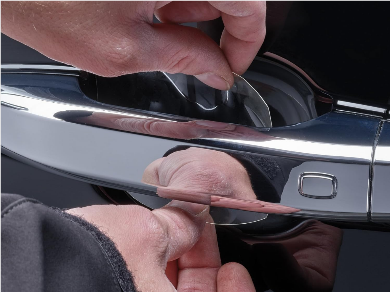
Image: A close-up of hands carefully applying the clear protective film into the recessed area of a car door handle cup.

4. Repeat for All Pieces: Follow these steps for each piece of the scratch protection kit.