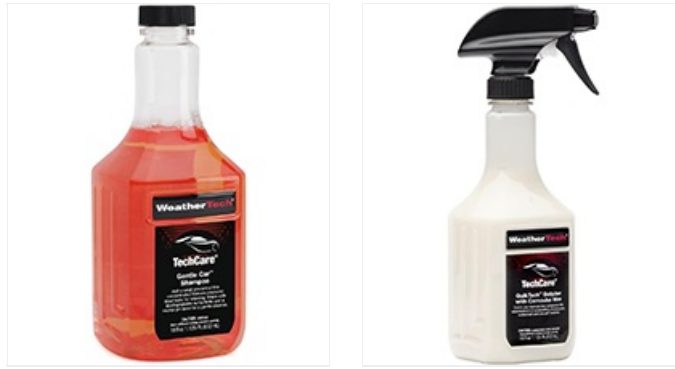
Image: Examples of suitable WeatherTech TechCare products for cleaning and maintaining your vehicle's finish and protective film.