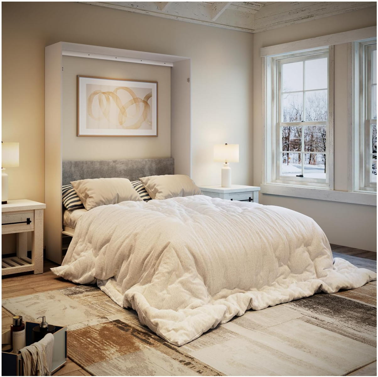
Image 2.1: The Bobve Farmhouse Queen Murphy Bed in its deployed position within a room setting.