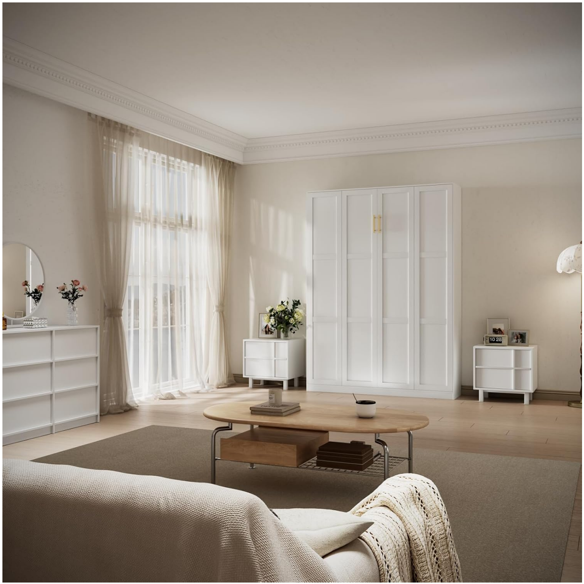
Image 5.1: The Murphy bed in its fully deployed state with a mattress.