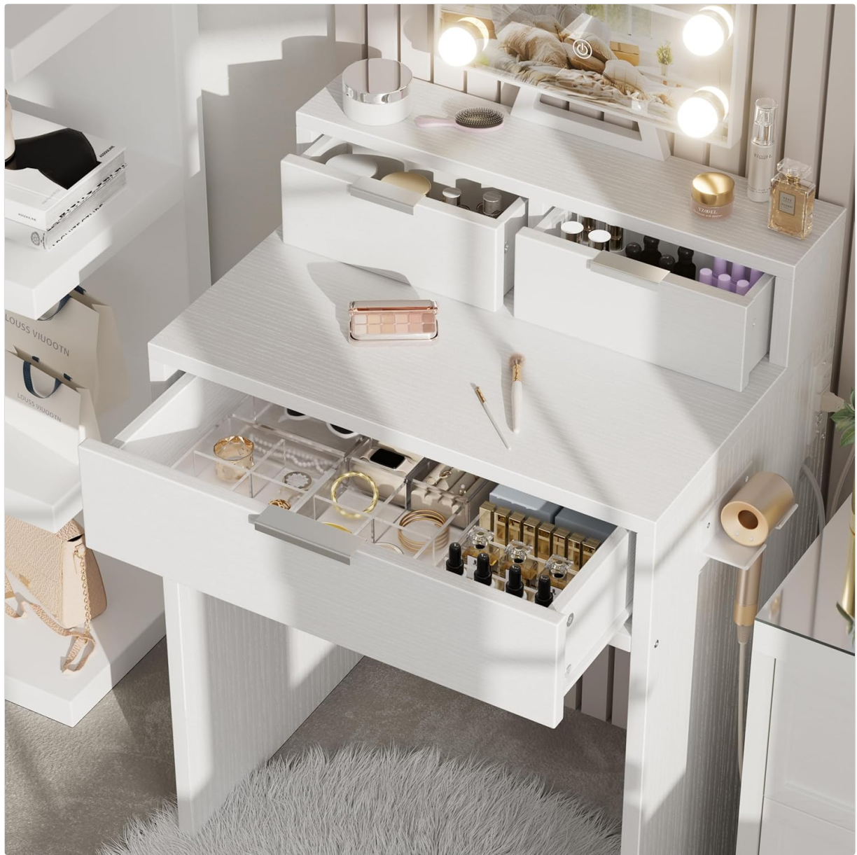
Image: An aerial view showing the main pull-out drawer and two smaller tabletop drawers open, revealing various makeup and jewelry items neatly organized within.