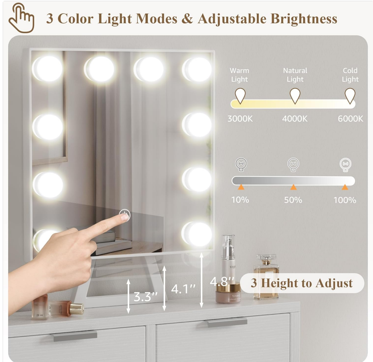
Image: Diagram showing the touch control for the mirror lights, illustrating 3 color modes (Warm, Natural, Cold) and adjustable brightness levels (10%, 50%, 100%).