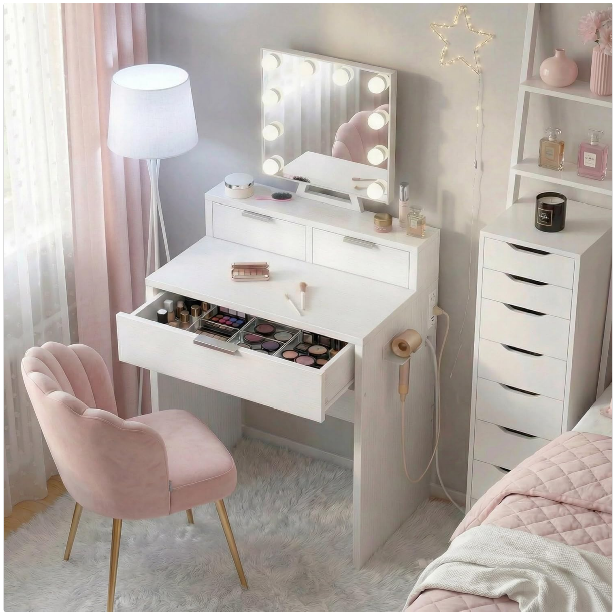
Image: The BOLUO White Makeup Vanity Desk, showcasing its overall design with the illuminated mirror, drawers, and a side hair dryer holder.