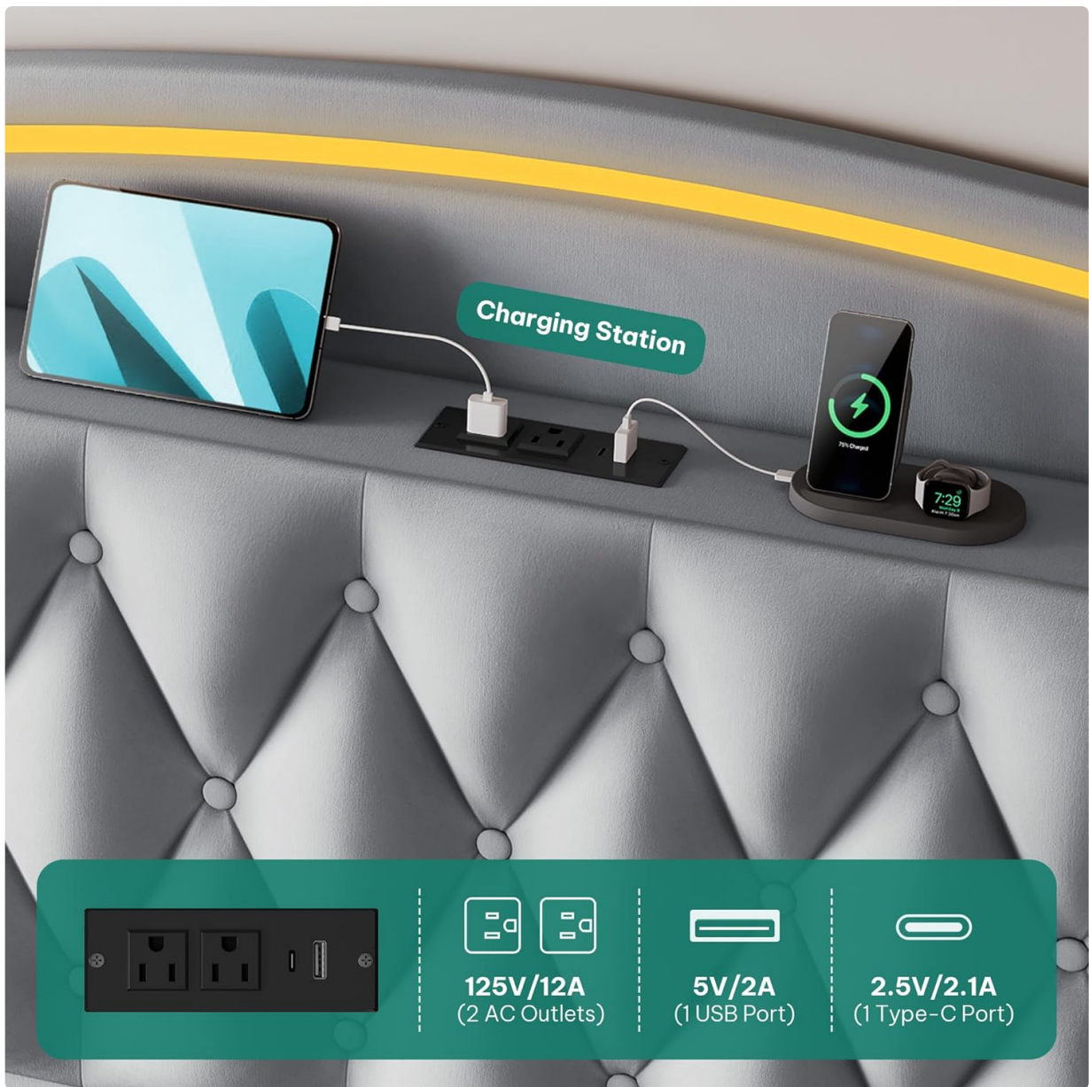
Image: A close-up view of the integrated charging station on the headboard, showing two AC outlets, one USB port, and one Type-C port, with devices connected.