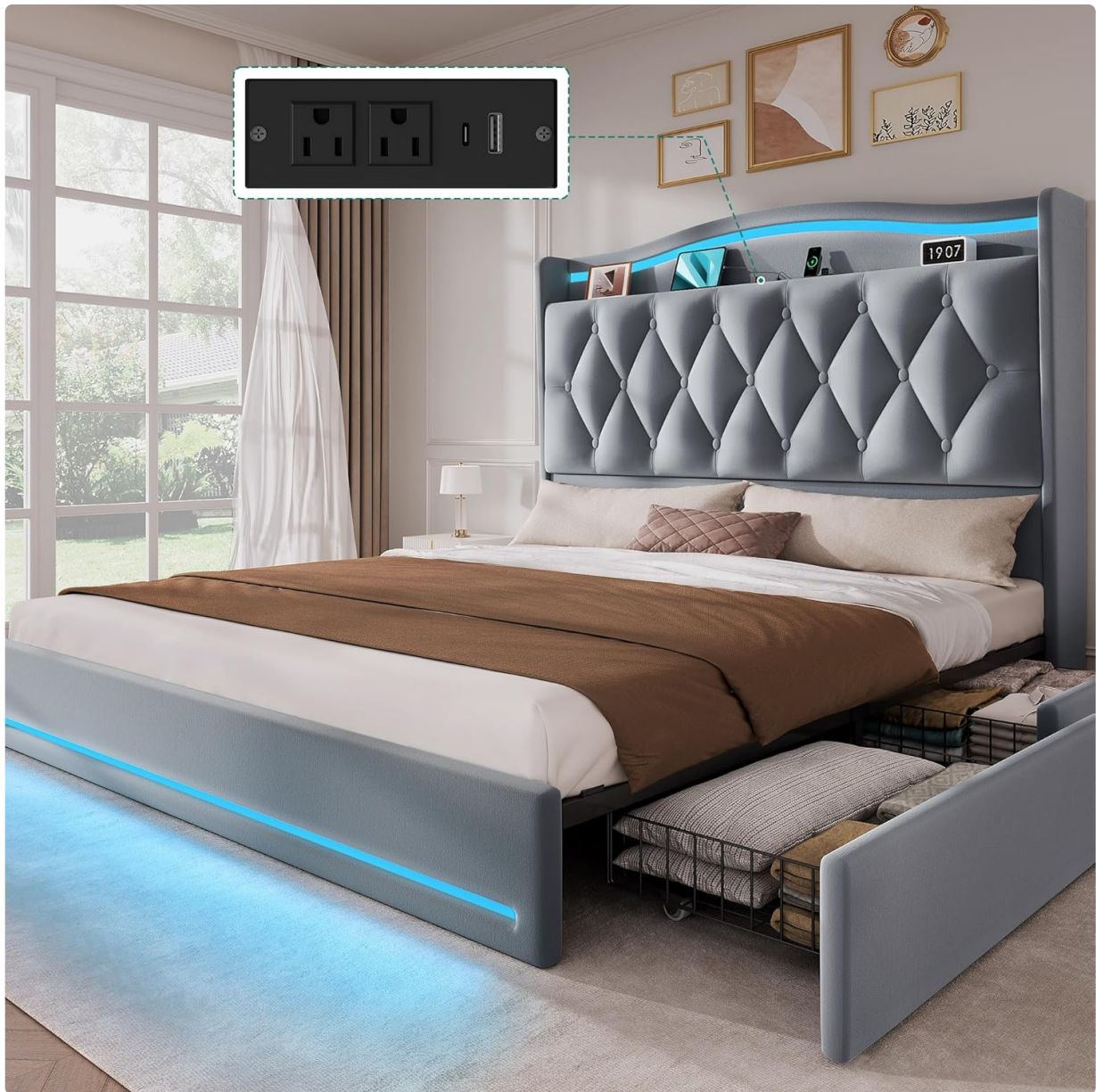
Image: The YITAHOME Queen Size Bed Frame in grey, showcasing the tall headboard with LED lighting, integrated charging station, and open storage drawers.