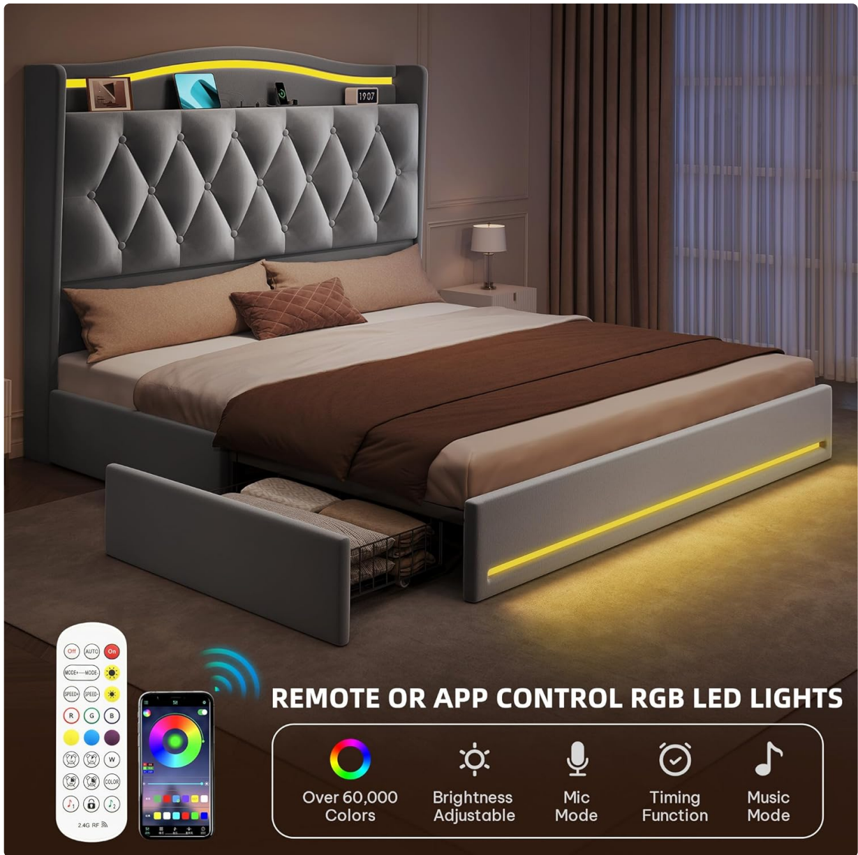
Image: The YITAHOME bed frame with its RGB LED lights illuminated, accompanied by an image of the remote control and a smartphone displaying the control app interface.