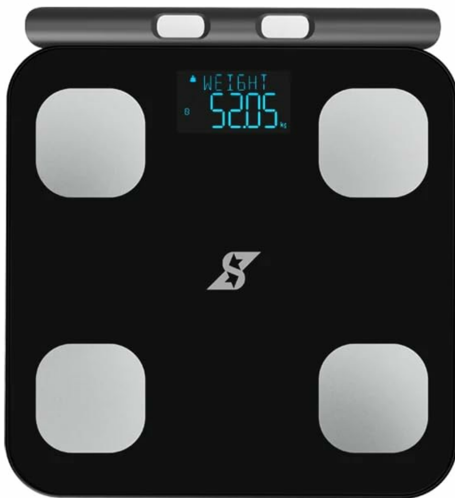
Figure 1: Top-down view of the Speediance Smart Body Fat Scale. The scale is black with a digital display showing "WEIGHT 52.05 kg" and four silver electrode pads at each corner. The Speediance logo is visible at the bottom center.