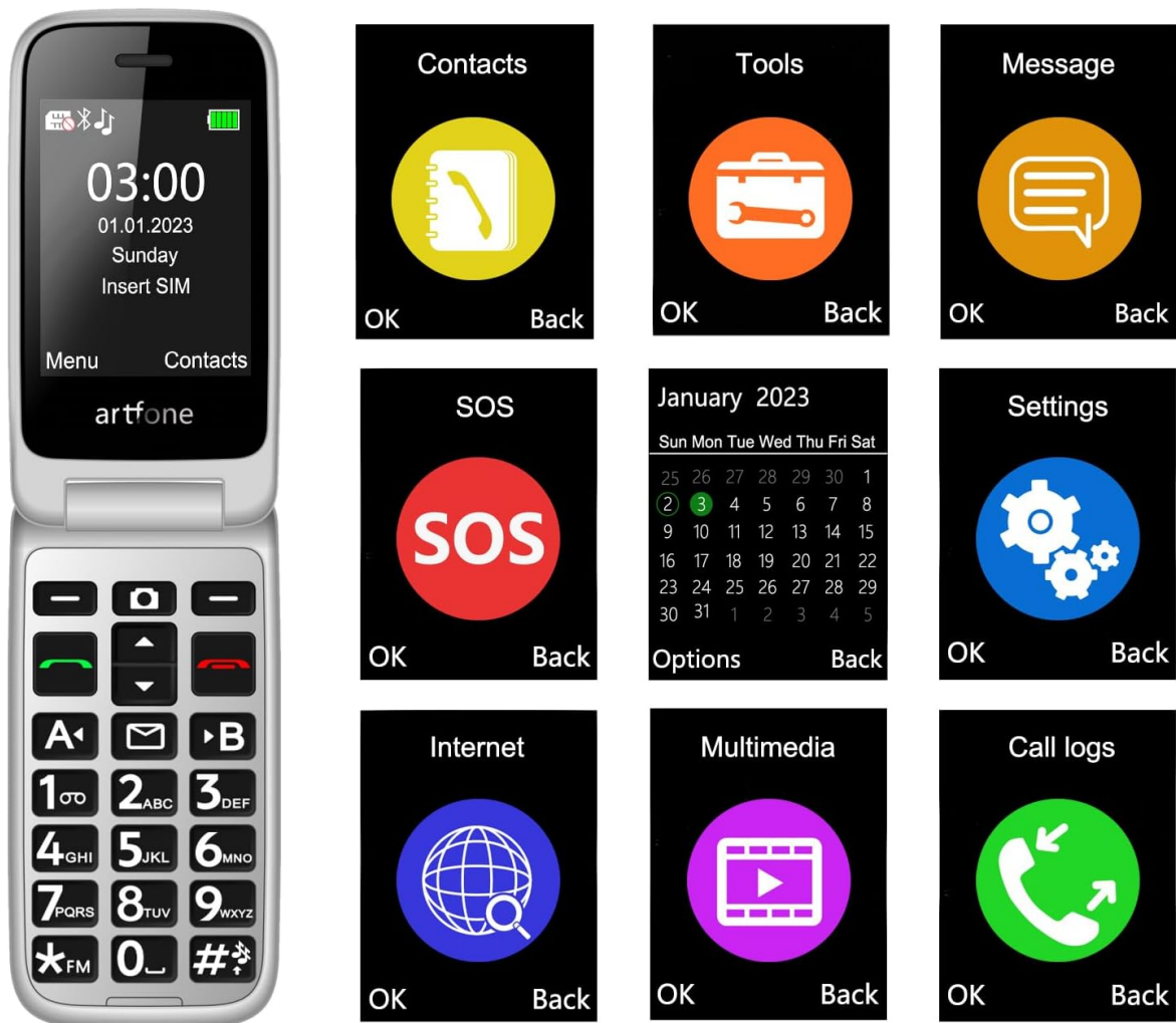
Image: Overview of the artfone G6 Pro's user-friendly menu interface.