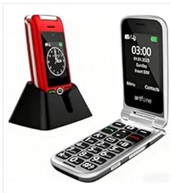
Image: The artfone G6 Pro featuring a flashlight, FM radio, and a 3.5mm headphone jack.

A dedicated flashlight button on the side of the phone allows for quick activation. Slide up/down to toggle the flashlight on or off.