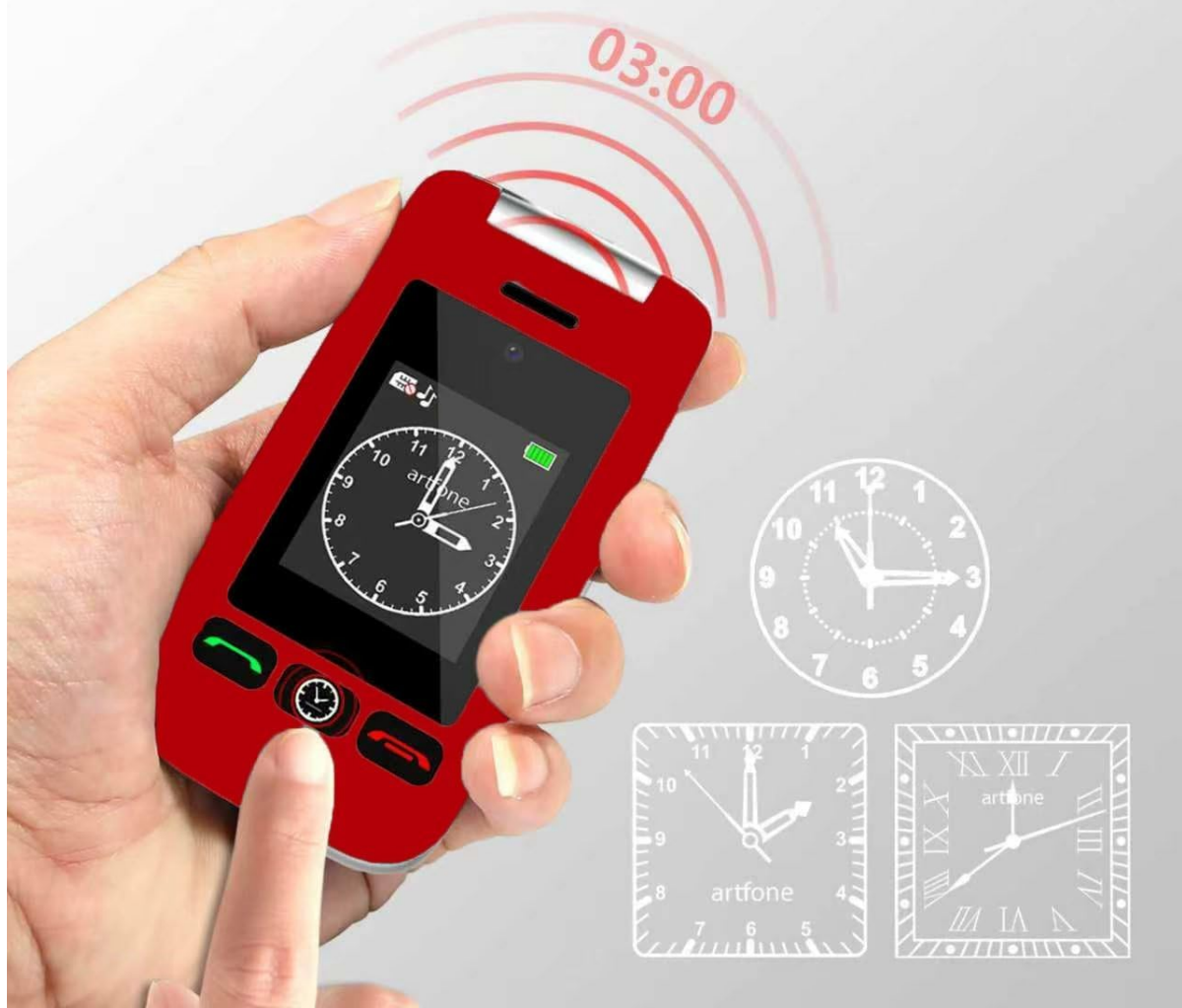
Image: The time reporting button on the artfone G6 Pro, which announces the current time audibly.