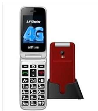
Image: Charging the artfone G6 Pro using either the USB-C cable or the charging dock.