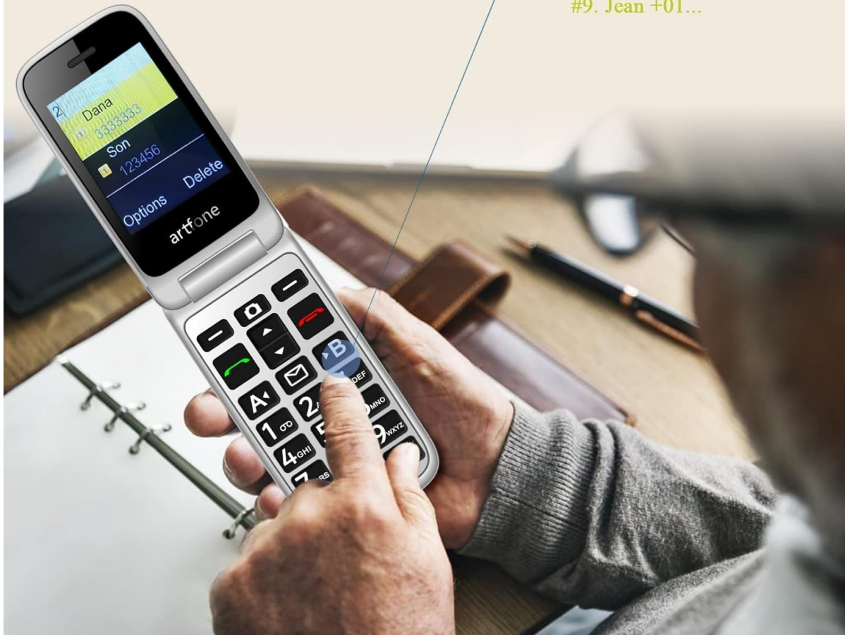
Image: Demonstrating the one-button speed dial feature on the artfone G6 Pro.