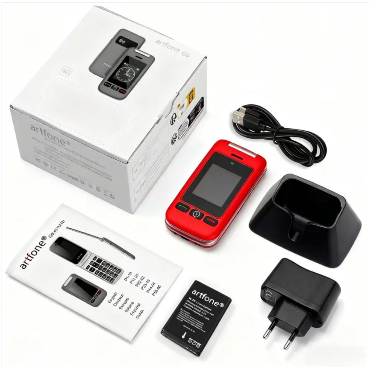
Image: Package contents of the artfone G6 Pro, showing the phone, battery, USB cable, user manual, and charging dock.