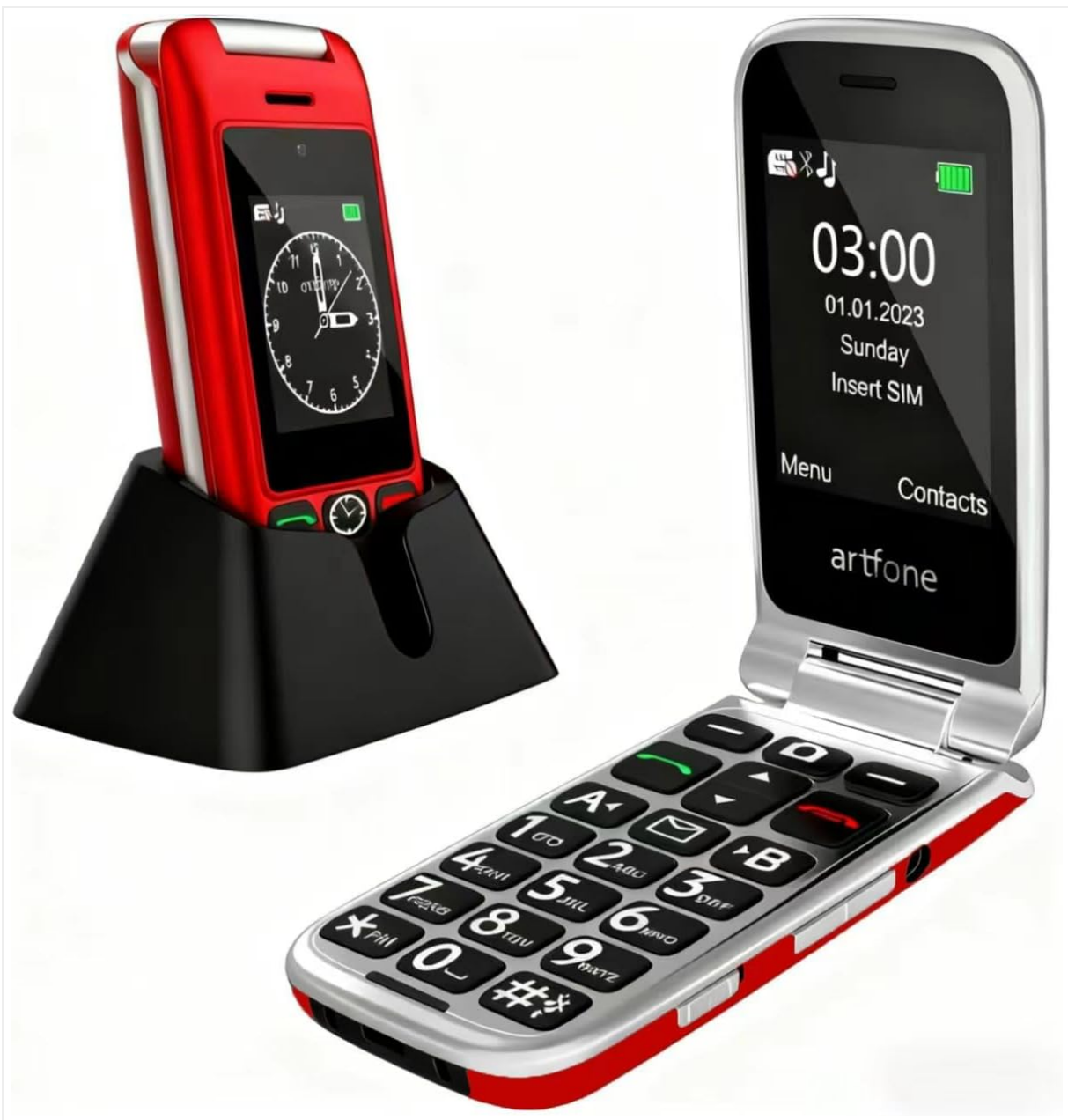
Image: artfone G6 Pro displaying its dual screens, one on the exterior when closed and one on the interior when open.