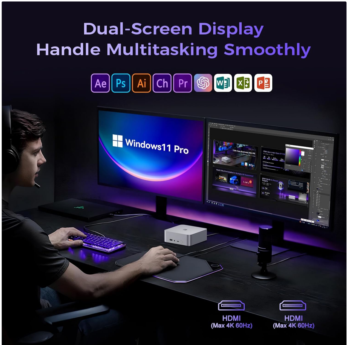
Image: A user utilizing the dual-screen display capability of the Beelink EQi13 Pro Mini PC for multitasking.

The Beelink EQi13 Pro supports connecting two monitors simultaneously for enhanced productivity.