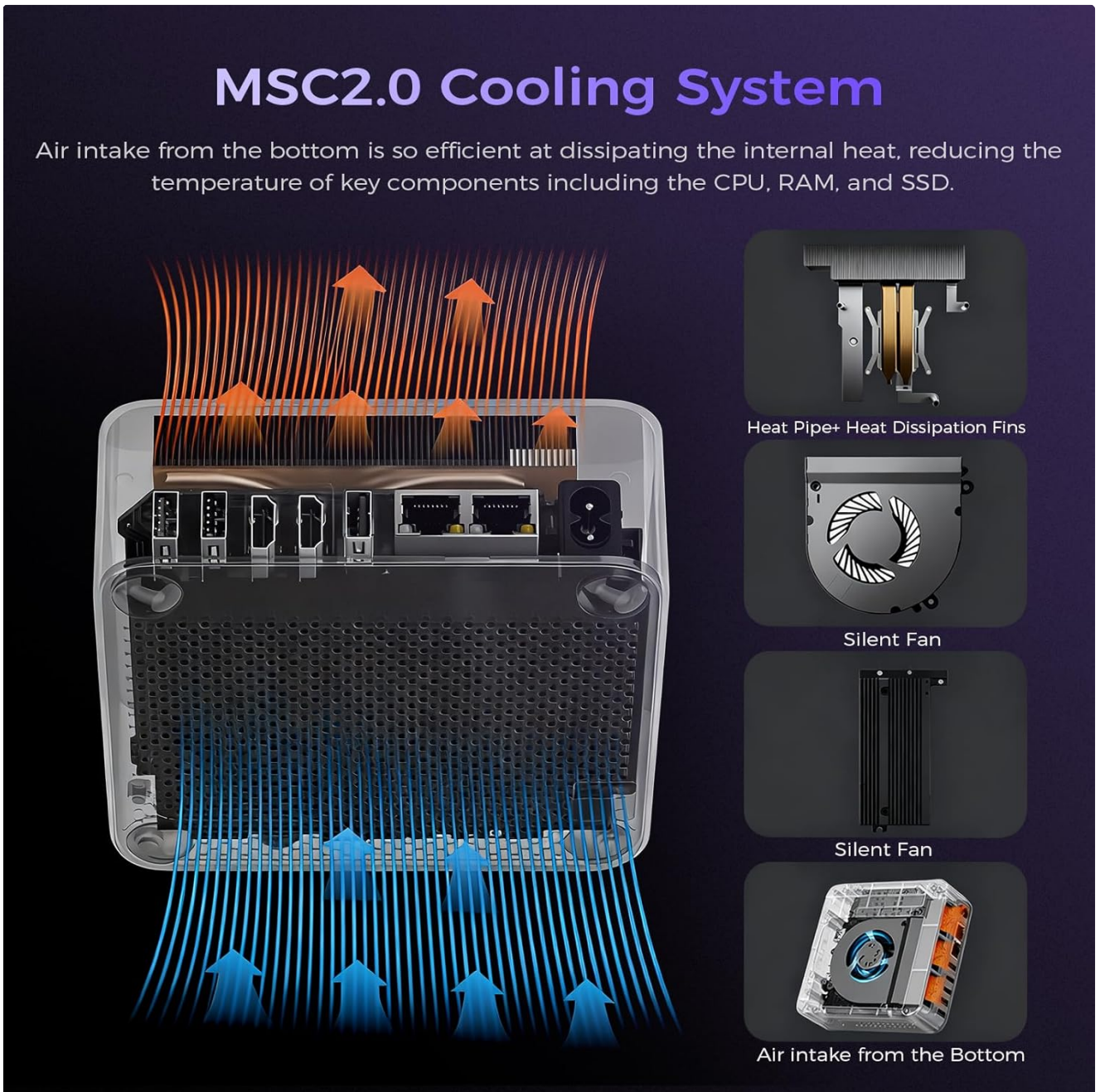
Image: Diagram illustrating the MSC2.0 cooling system, showing air intake from the bottom and heat dissipation components.