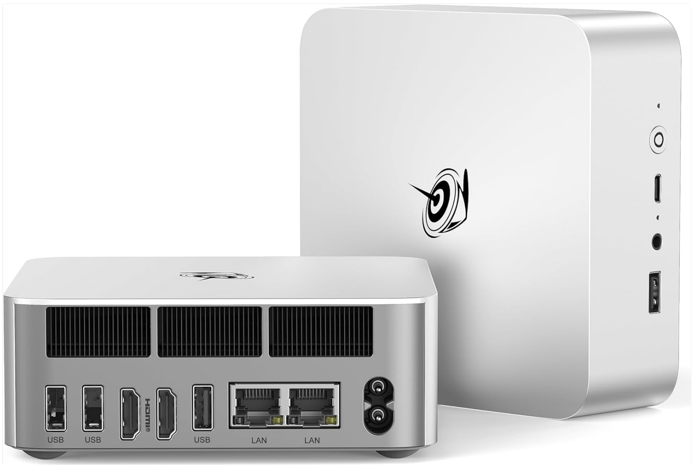
Image: Front and rear view of the Beelink EQi13 Pro Mini PC, showcasing its compact design and various ports.