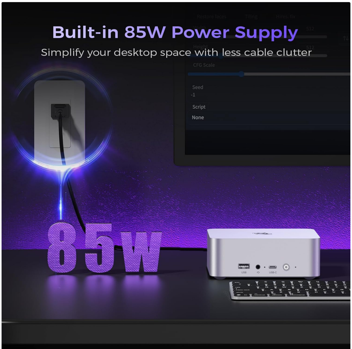
Image: The Beelink EQi13 Pro Mini PC connected to power, highlighting its integrated 85W power supply.