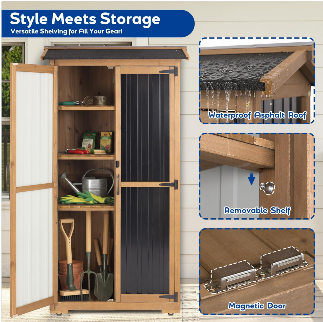
Image: An open cabinet showcasing its adjustable shelves and magnetic door closures, highlighting its versatile storage options.

The cabinet features three adjustable shelves. To adjust a shelf, carefully lift it from its current position and place it onto the desired support brackets. Ensure it is level and securely seated before placing items on it.