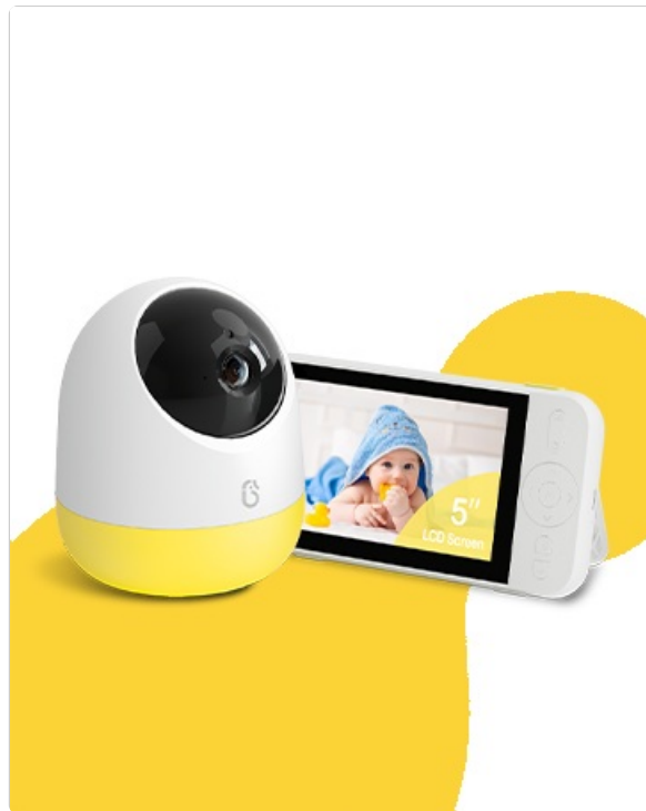
Image: All components included in the Ellie Pro Baby Monitor package.