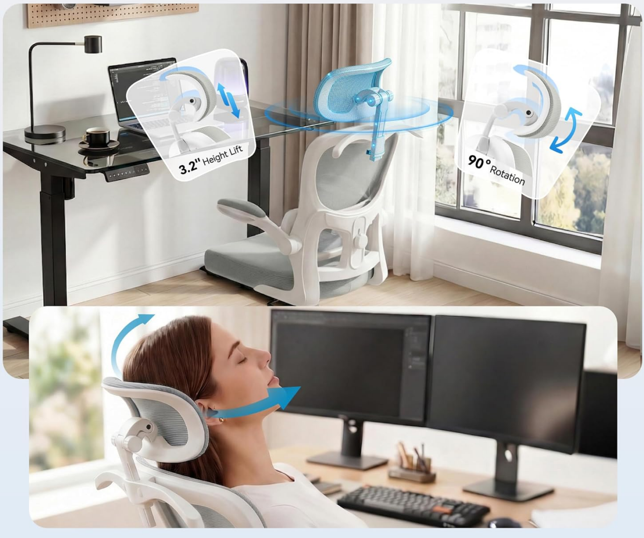
Image: Demonstrates the vertical and rotational adjustment of the headrest on the AreShark MC02 Office Chair.

Your browser does not support the video tag.