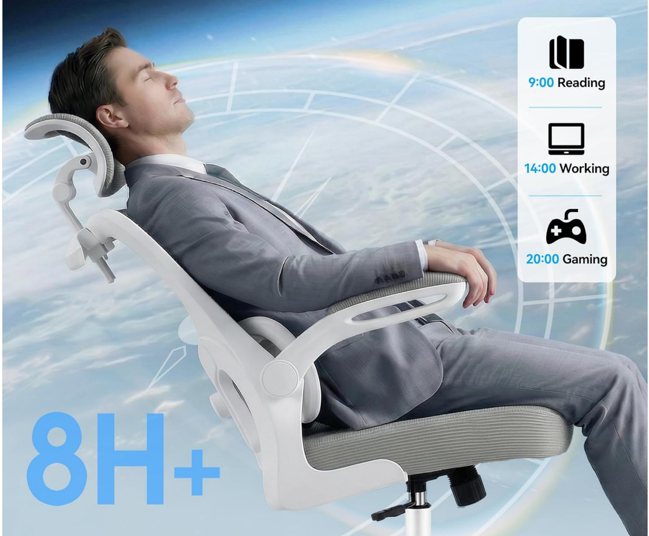
Image: The AreShark MC02 Office Chair demonstrating its 90-120 degree tilt function for relaxation.

Effectively reduces hip and back pressure, making 8+hour workdays feel effortless