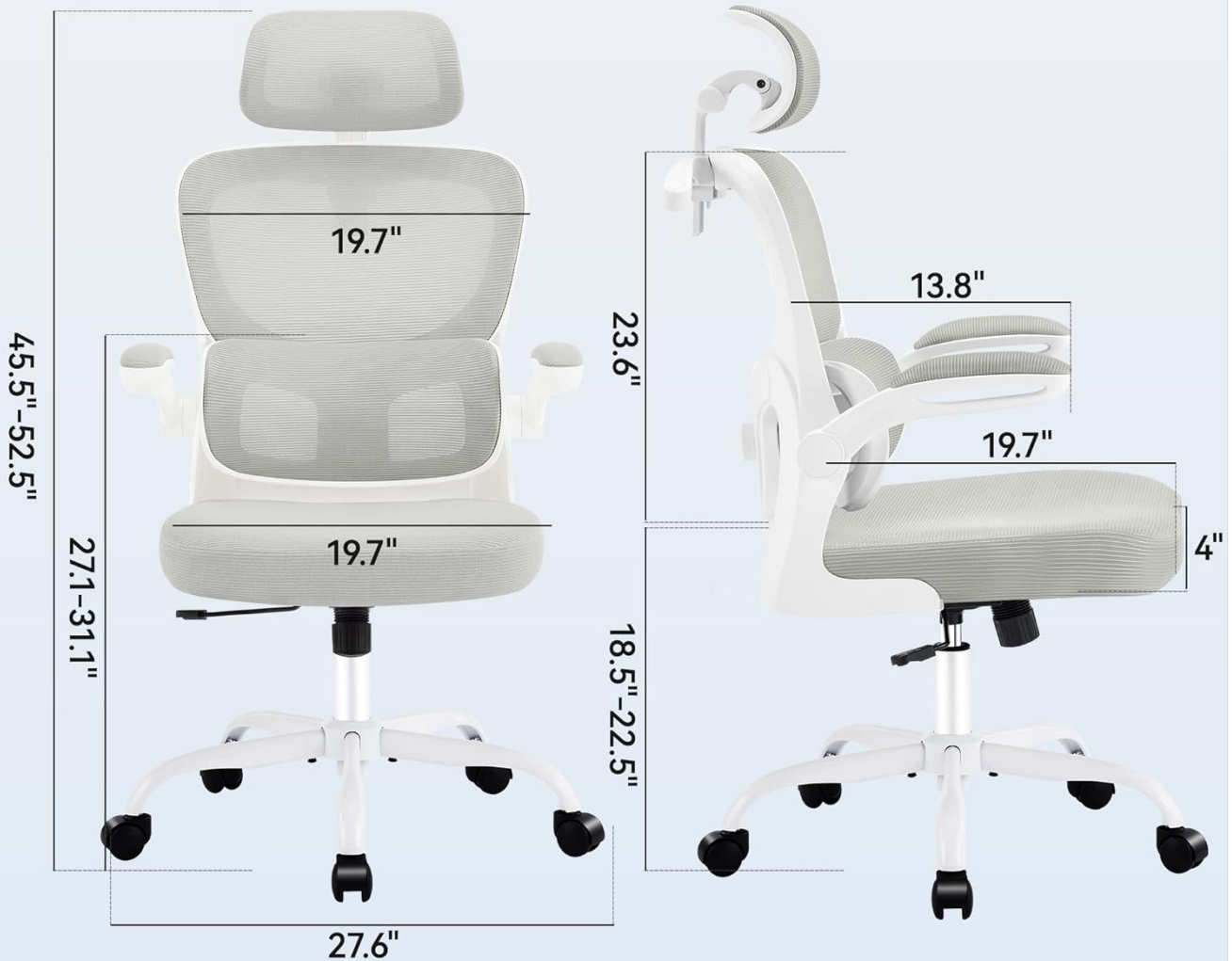
Image: Close-up view of the adjustable lumbar support on the AreShark MC02 Office Chair.

Your browser does not support the video tag.