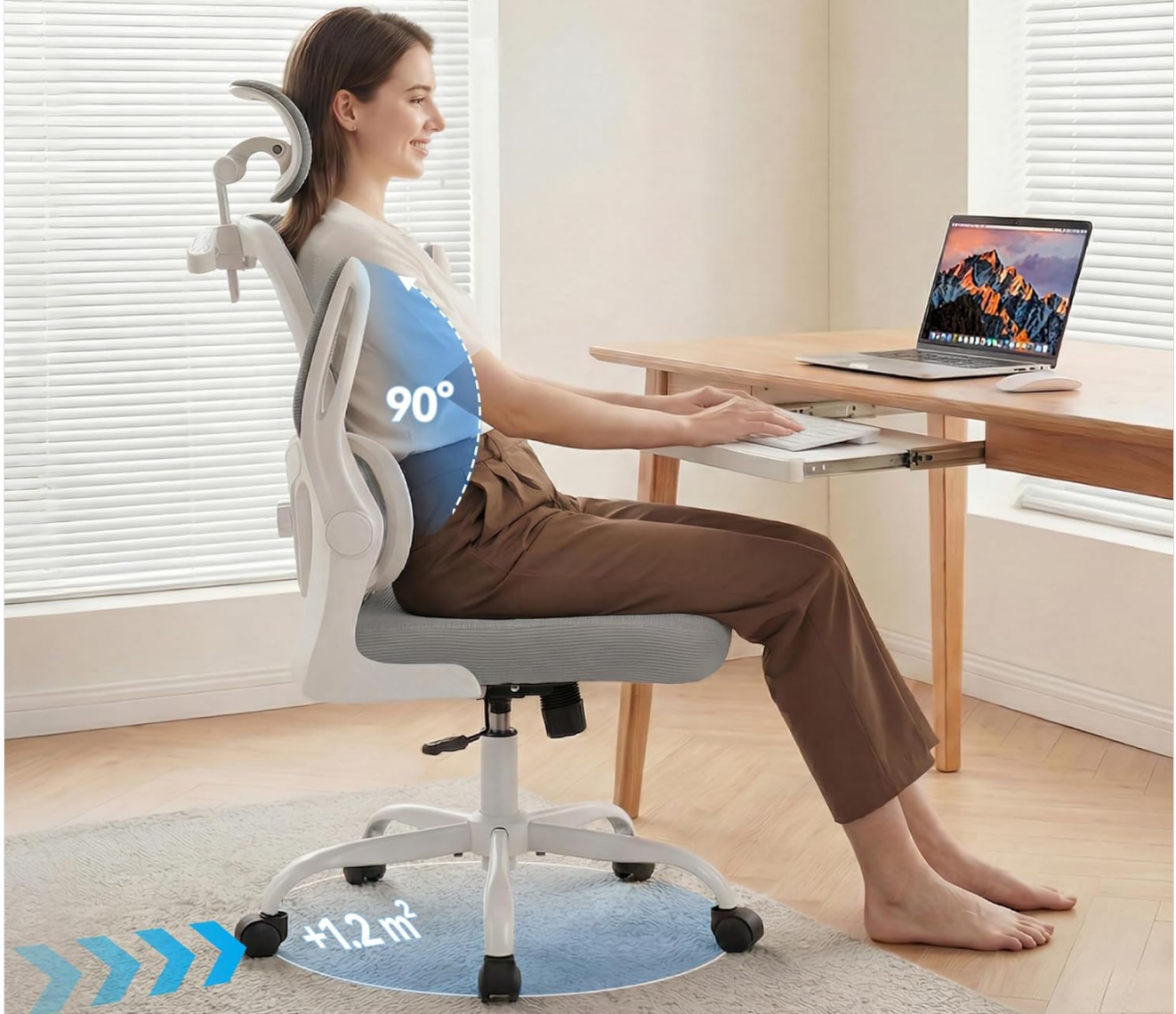
Image: The AreShark MC02 Office Chair featuring its integrated coat hanger on the backrest.

Flip the arms up to 90° to reclaim your floor space when not in usage