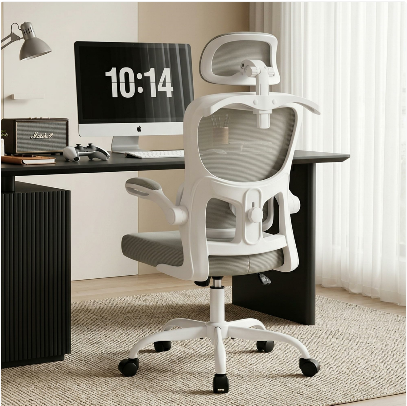
Image: The AreShark MC02 Ergonomic Office Chair in Grey, showcasing its modern design.