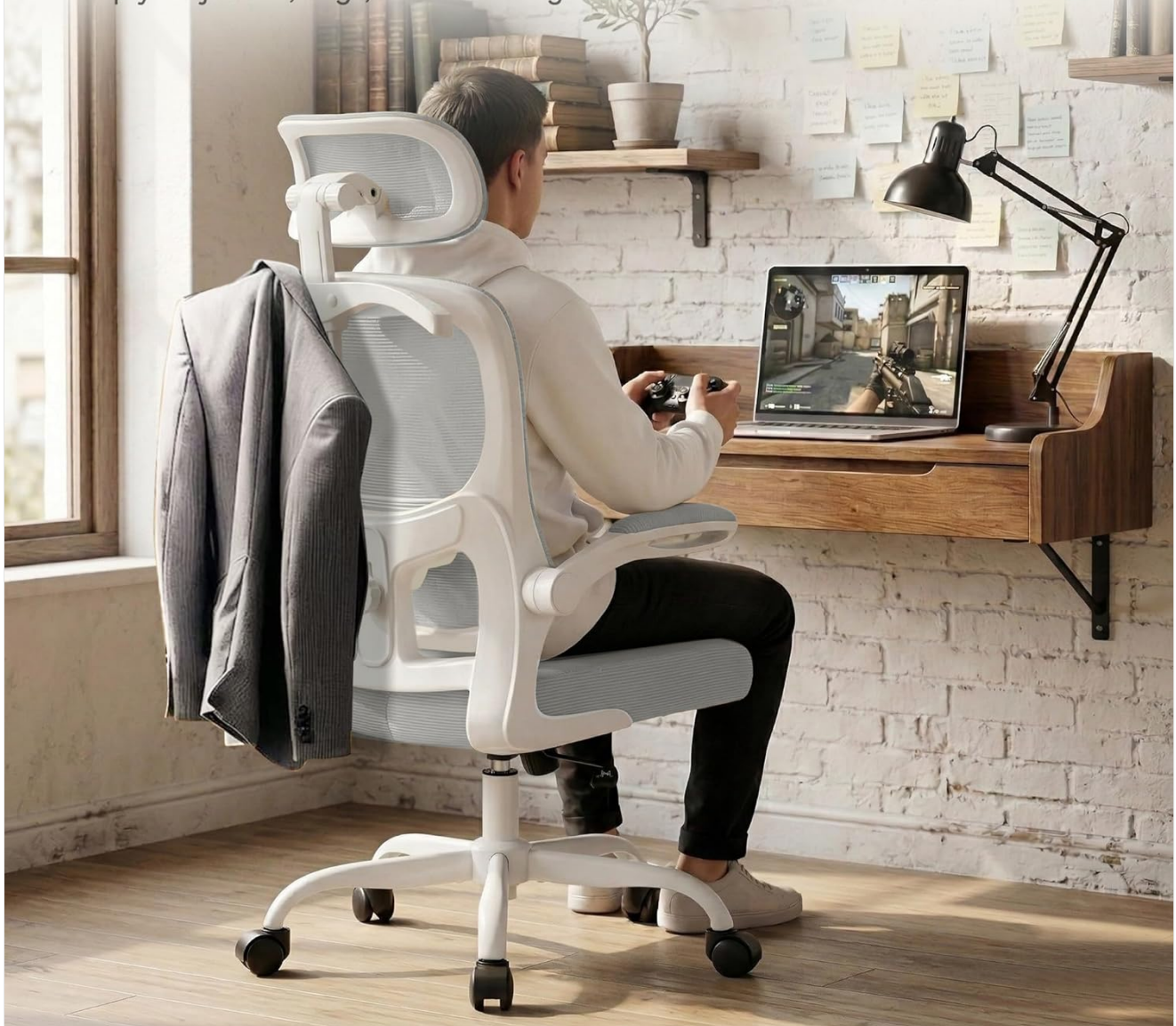
Image: The AreShark MC02 Office Chair with its armrests flipped up, illustrating its space-saving design.

Keep your jackets, bags, or hoodies organized and wrinkle-free