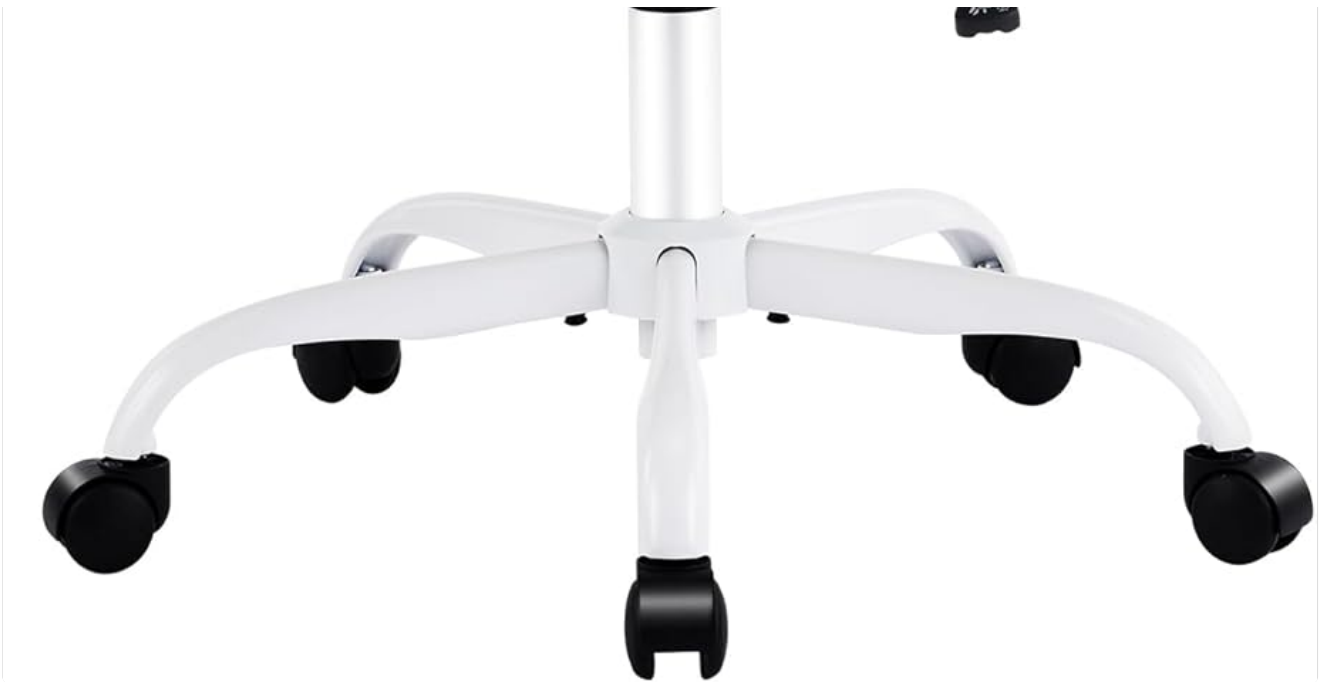
Image: A detailed diagram illustrating the assembly steps for the AreShark MC02 Office Chair.