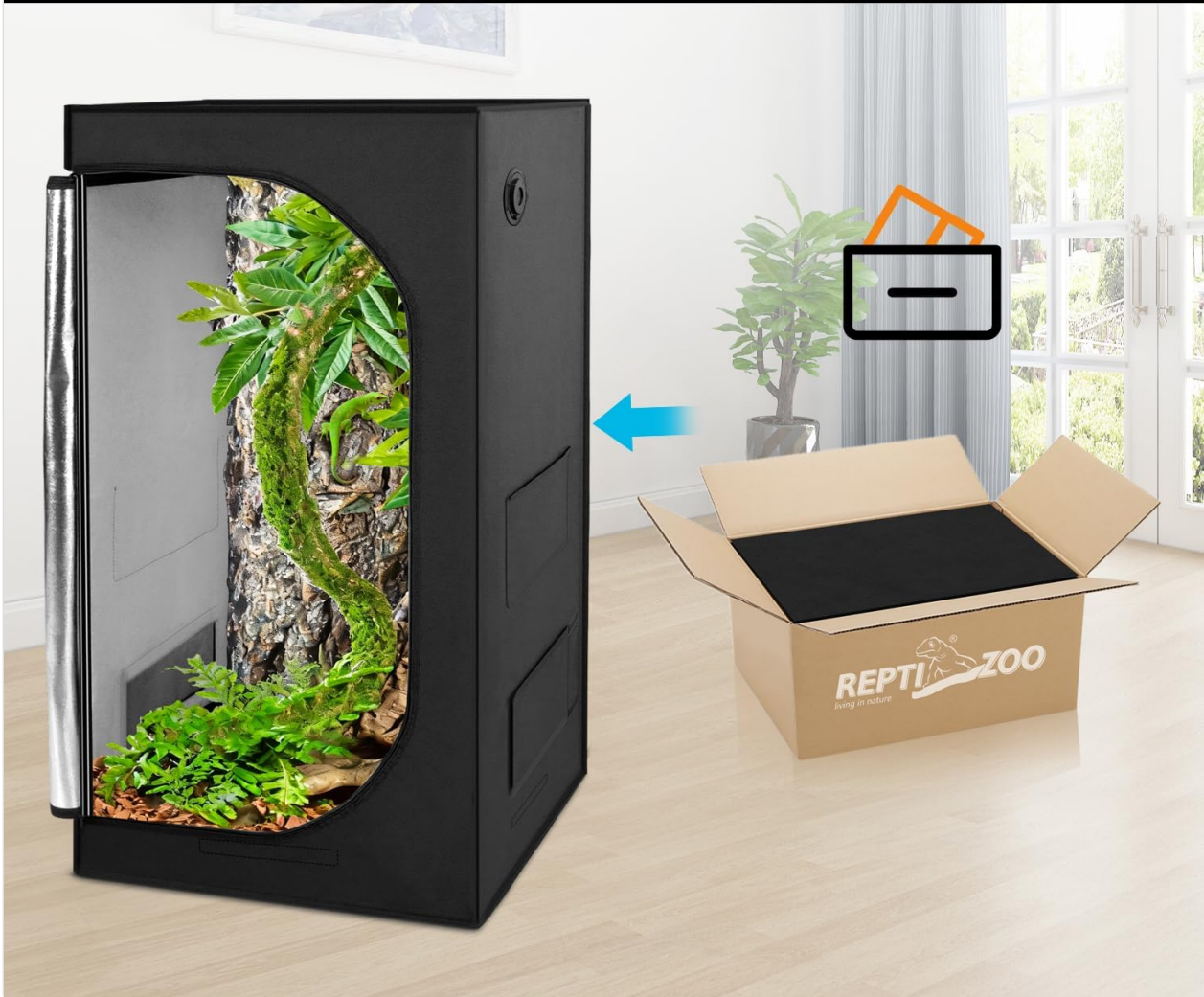
Image 7.1: The habitat is fully disassemblable and foldable for space-saving storage.