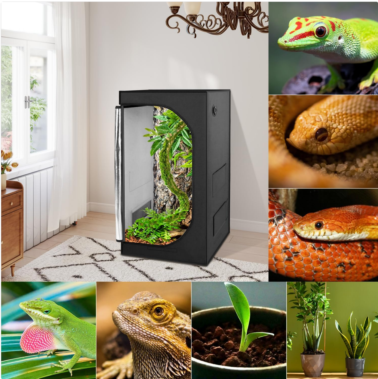
Image 1.1: The REPTIZOO Reptile Tent Habitat is suitable for various reptiles and as a plant grow tent.