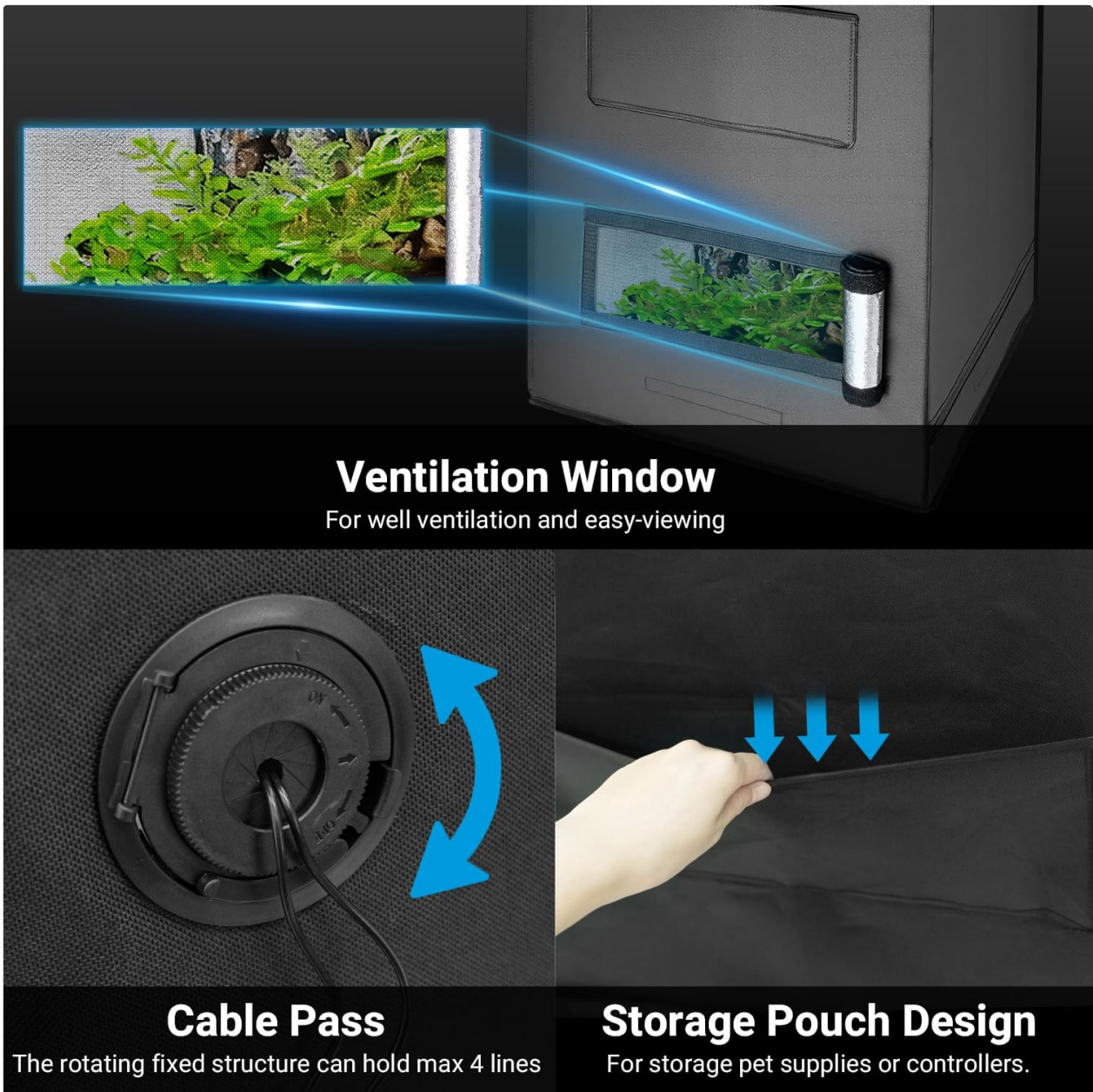
Image 5.1: Features include a ventilation window, cable pass, and storage pouch for convenience.