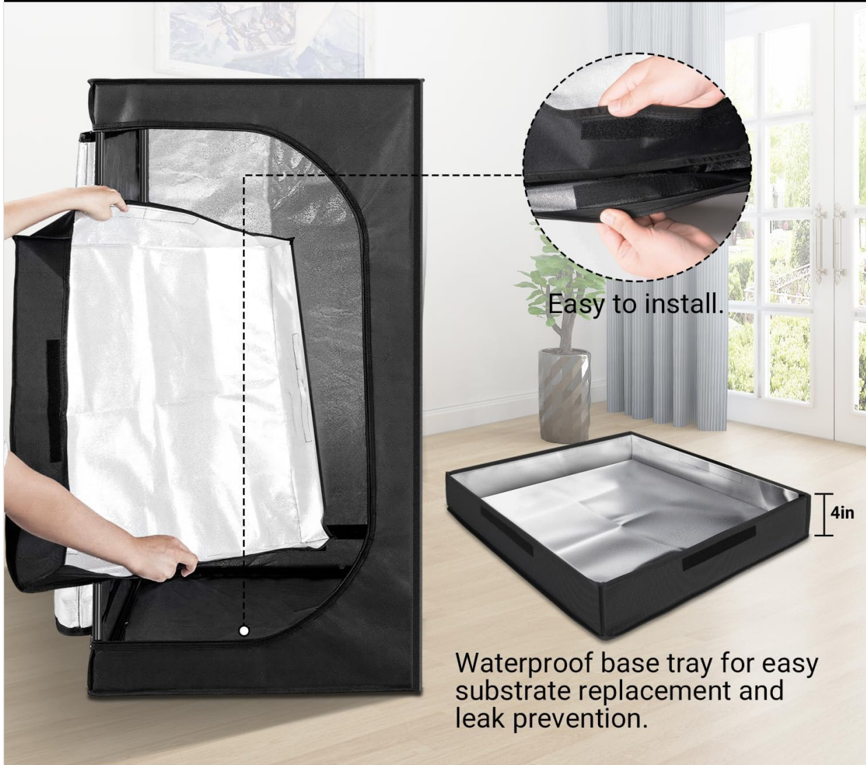
Image 6.1: The removable waterproof base tray simplifies cleaning and substrate changes.