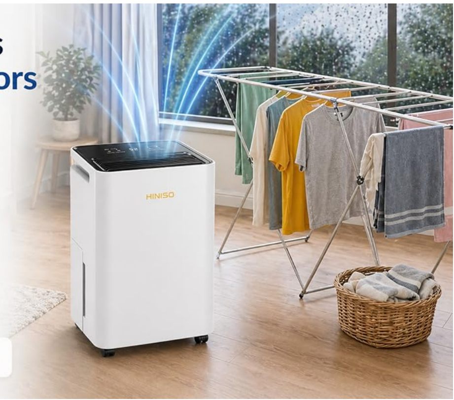
Figure 3.2: Key design elements including recessed handle, easy-rolling wheels, and washable filter.

Ideal for Indian Homes High Humidity. Smart Solution.