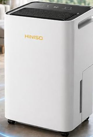
Figure 5.2: The ionizer function helps improve air quality.