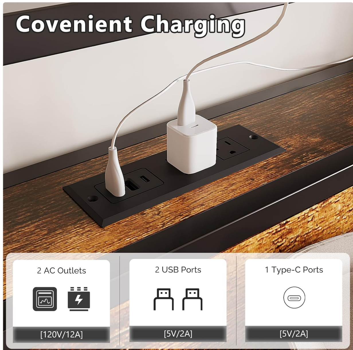
Close-up of the headboard's integrated charging station with AC, USB, and Type-C ports.

Simply plug your devices into the appropriate ports. Ensure the bed frame is connected to a wall outlet for the charging station to function.