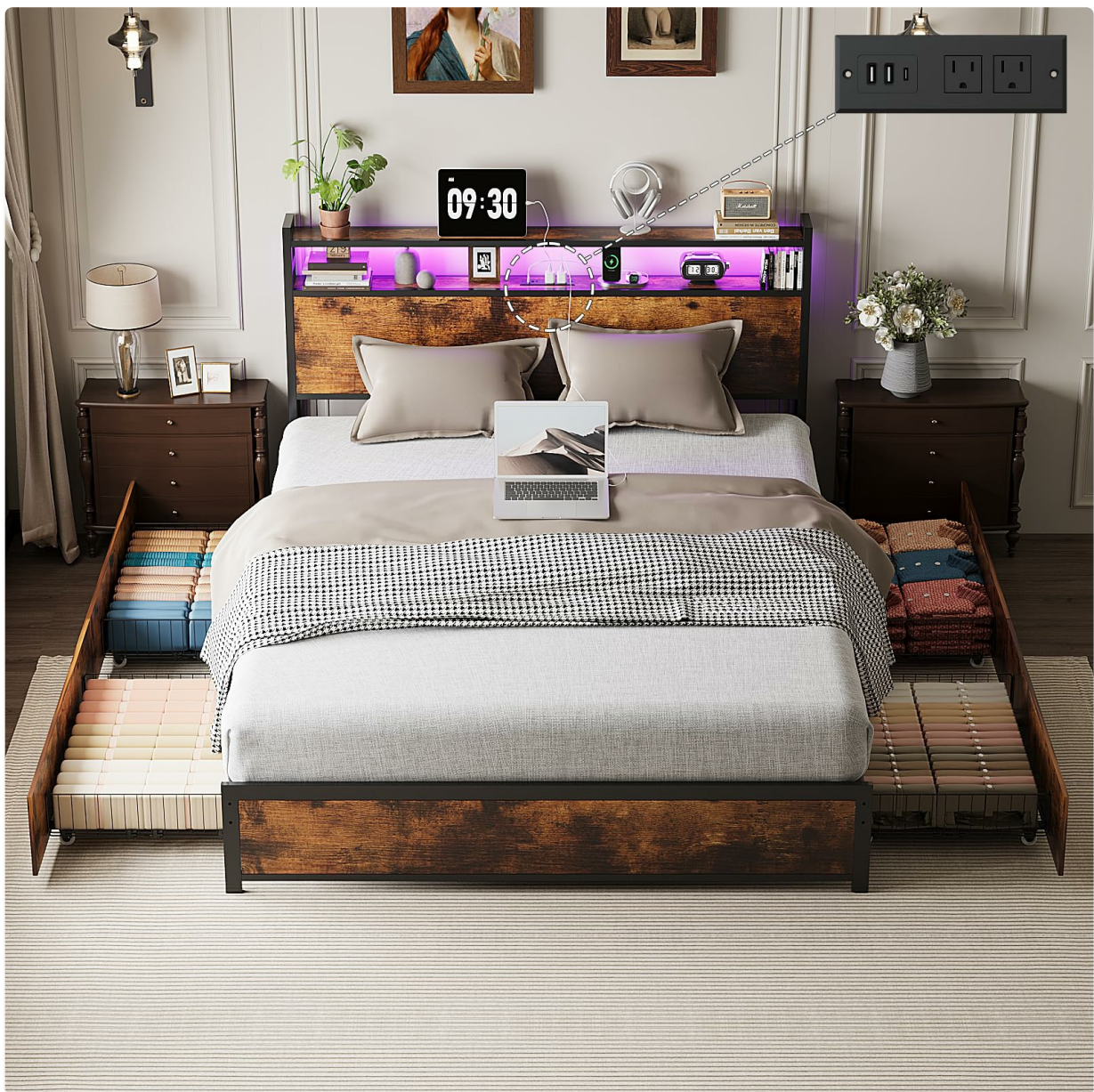
Overall view of the VINGLI Queen Bed Frame, showcasing its headboard, storage drawers, and integrated features.