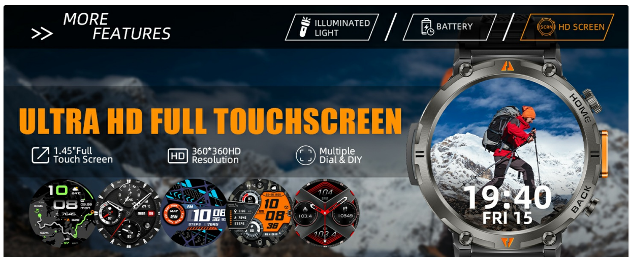
Figure 11: The EIGIIS KE3P Smart Watch showcasing its 1.45-inch full-touch TFT display with various customizable watch

Personalize your smartwatch with a variety of pre-installed watch faces or create your own using the companion app.