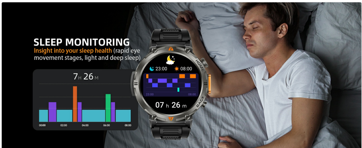
Figure 9: The EIGIIS KE3P Smart Watch presenting sleep monitoring data, including sleep stages and duration.