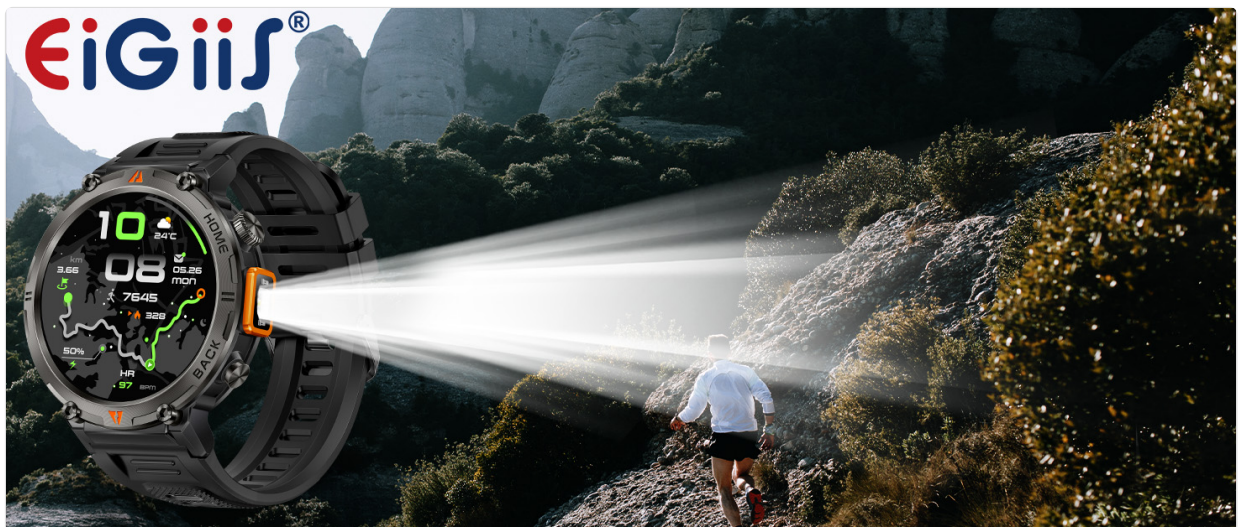
Figure 5: The EIGIIS KE3P Smart Watch displaying a GPS-tracked route during an outdoor activity.

The smartwatch features built-in GPS with support for six satellite systems for faster and more accurate positioning. Use this feature to track your outdoor activities and routes.