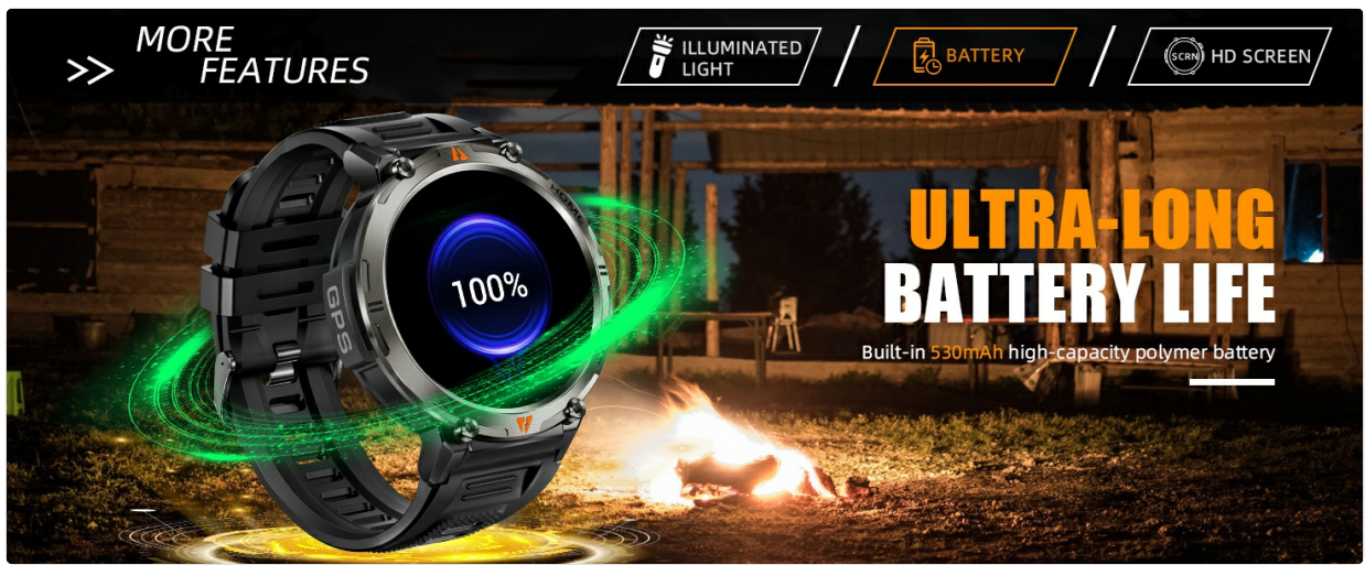
Figure 4: The EIGIIS KE3P Smart Watch connected to its magnetic charging cable, illustrating its 530mAh battery capacity.