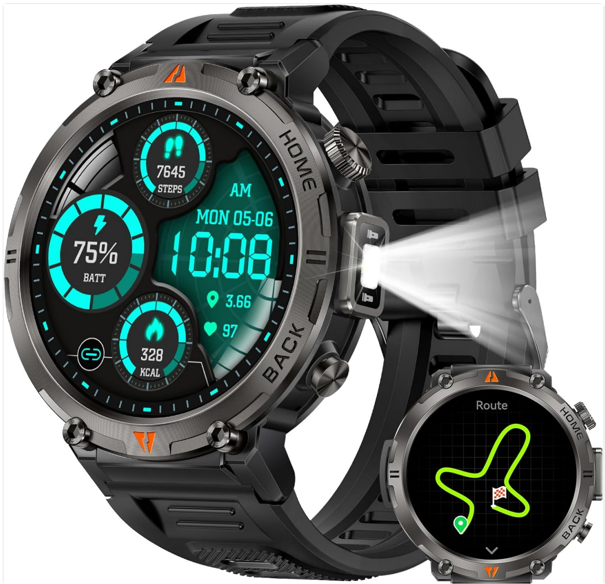
Figure 1: Front view of the EIGIIS KE3P Smart Watch, showcasing its rugged design and vibrant display.