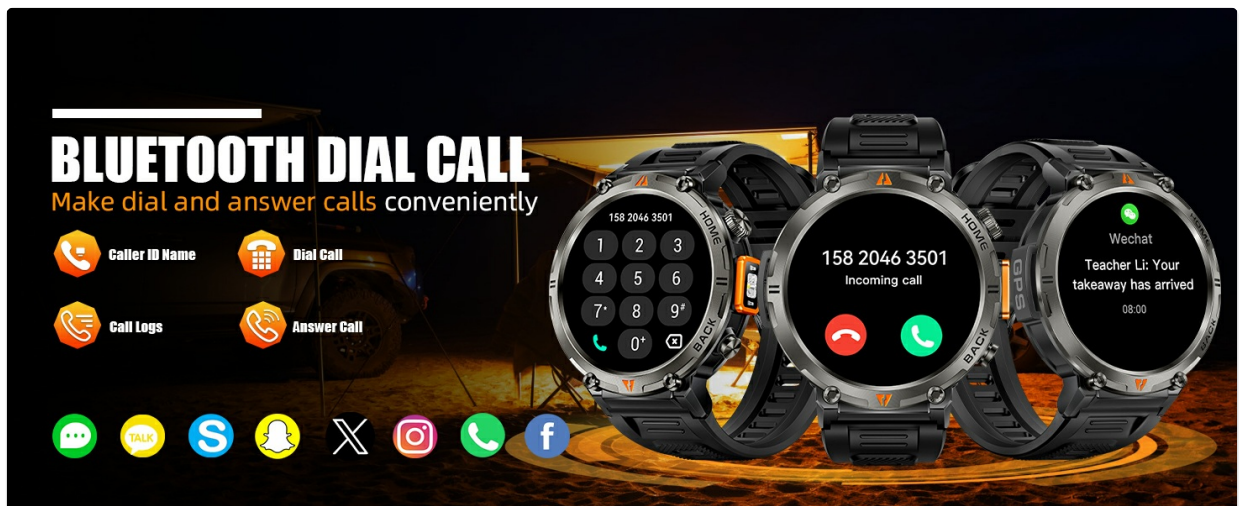
Figure 7: The EIGIIS KE3P Smart Watch showing an incoming Bluetooth call, illustrating its hands-free communication capability.

With a built-in microphone and speaker, you can make and receive calls directly from your wrist. The watch also displays real-time alerts from various applications.