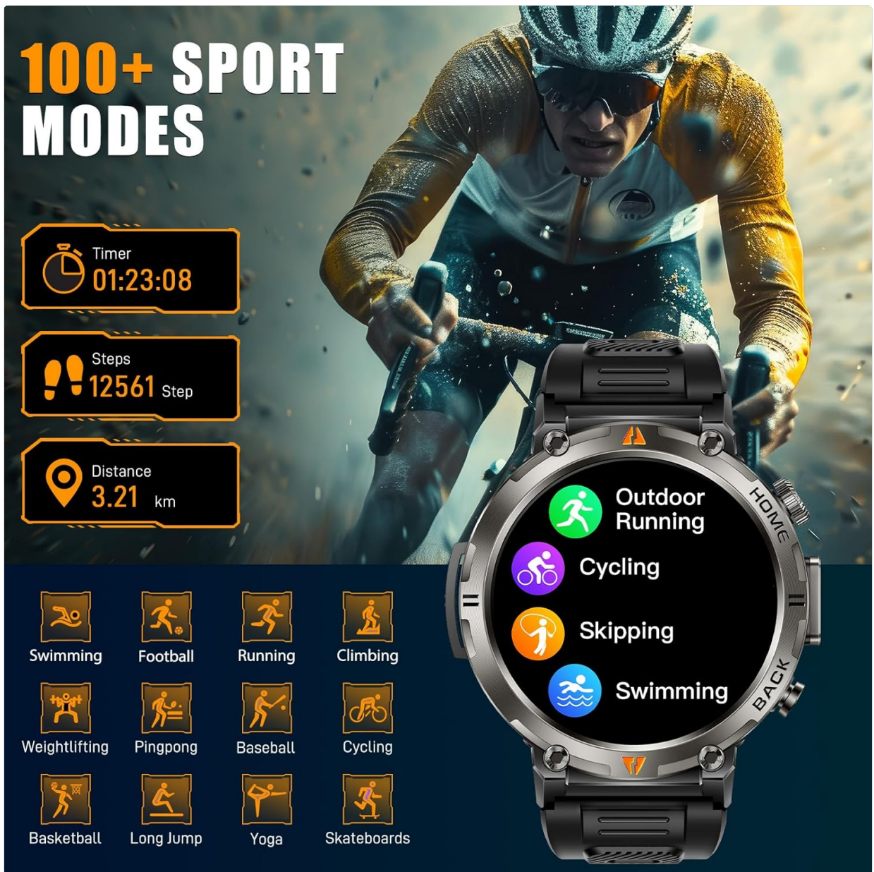
Figure 10: The EIGIIS KE3P Smart Watch interface showing a selection of its 100+ available sports tracking modes.