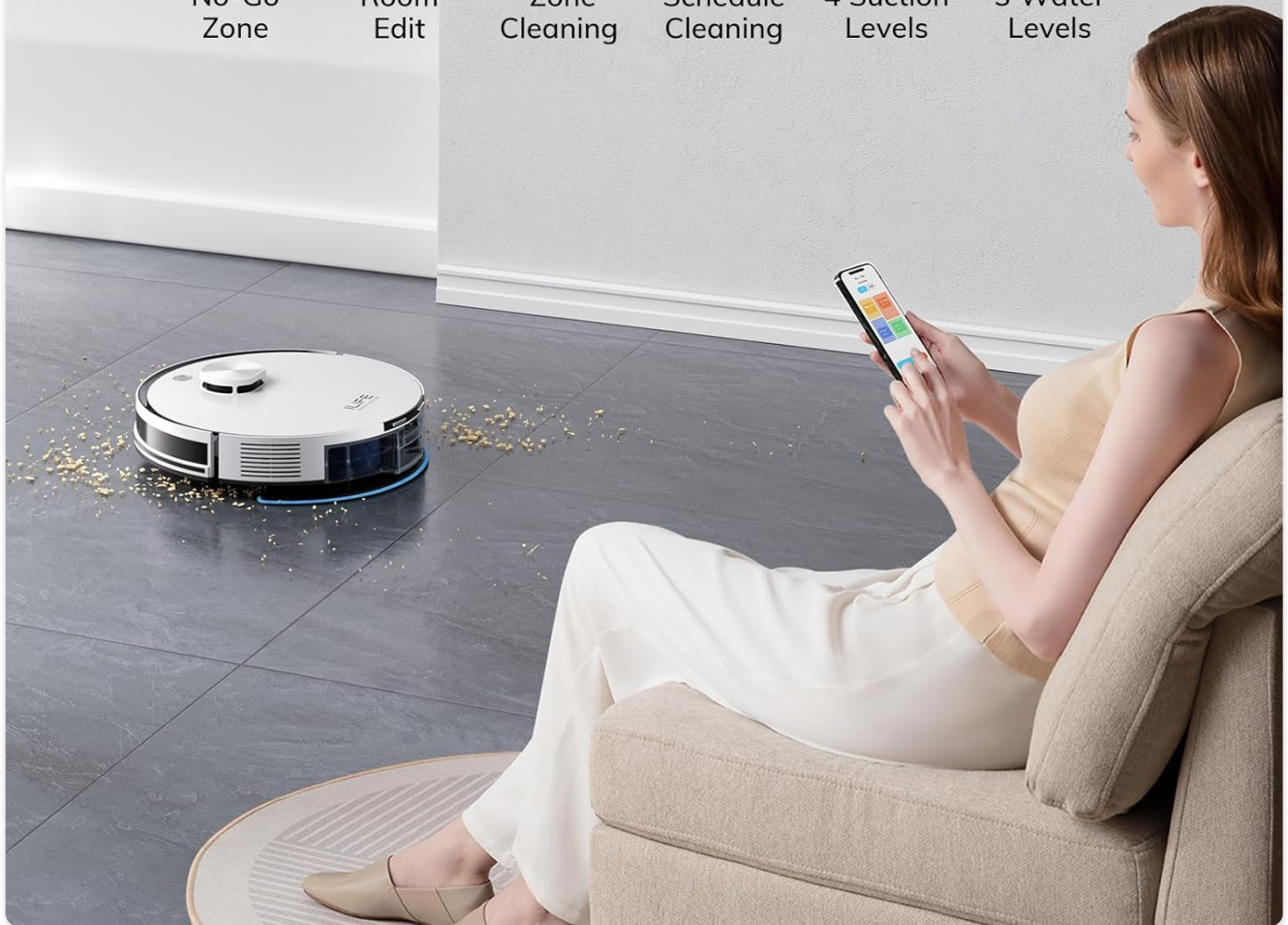
Figure 3: The ILIFEClean App provides comprehensive control over the robot vacuum, including no-go zones, room editing, zone cleaning, scheduling, suction levels, and water levels.