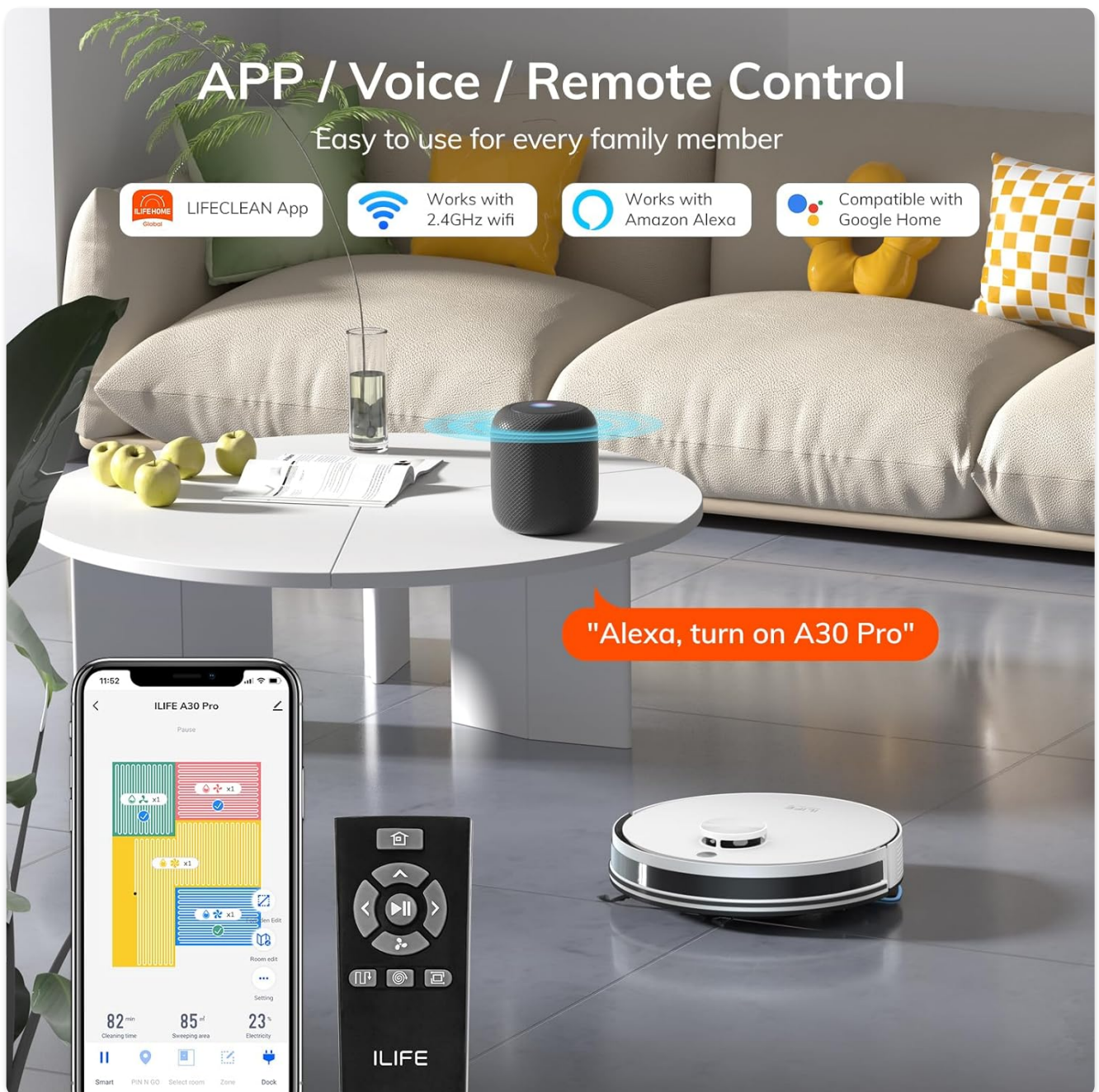
Figure 6: Control your ILIFE A30 Pro using the dedicated app, remote, or voice commands for a seamless cleaning experience.