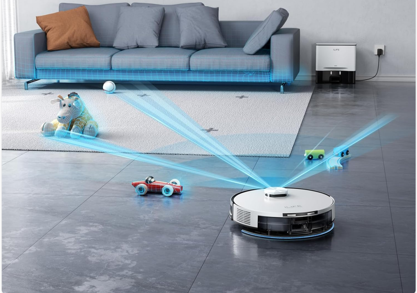
Figure 4: The robot vacuum utilizes LiDAR navigation for smart home mapping, path planning, and efficient cleaning.