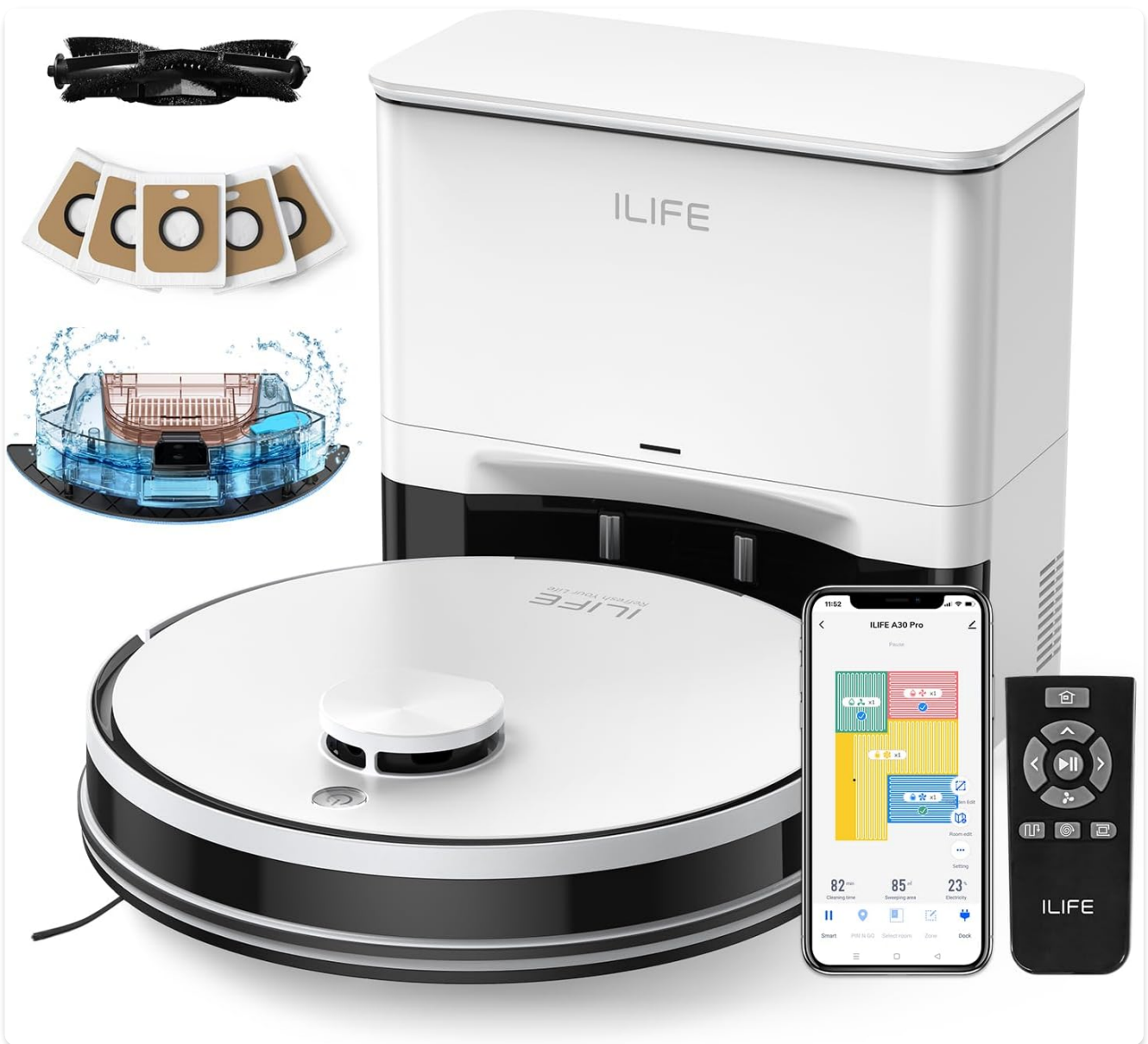
Figure 2: The ILIFE A30 Pro Robot Vacuum and Mop Combo with its various accessories, including replacement mop cloths and dust bags.