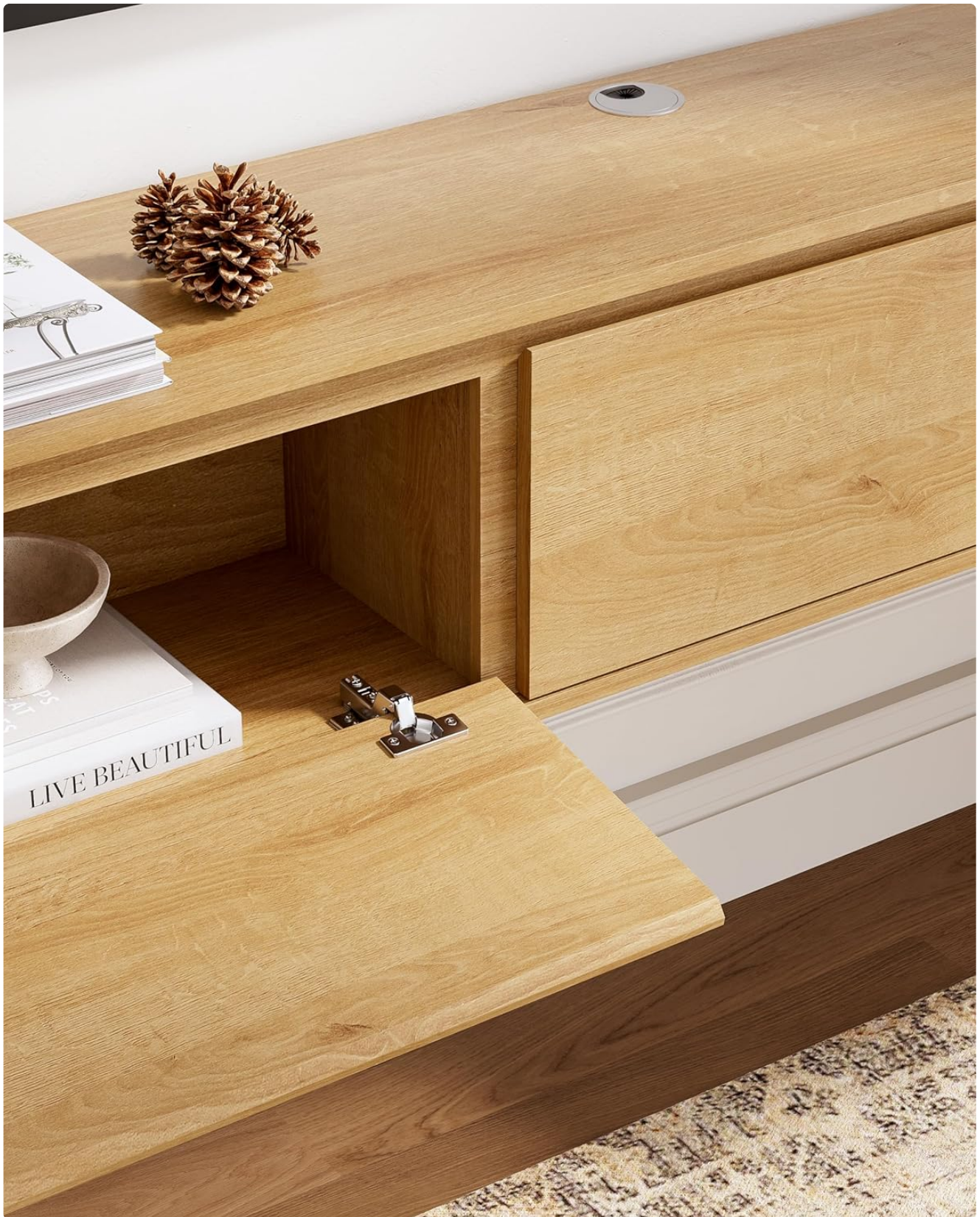
Image 6.1: An interior view of one of the storage compartments with its handle-free door open, showing space for media devices or decorative items.