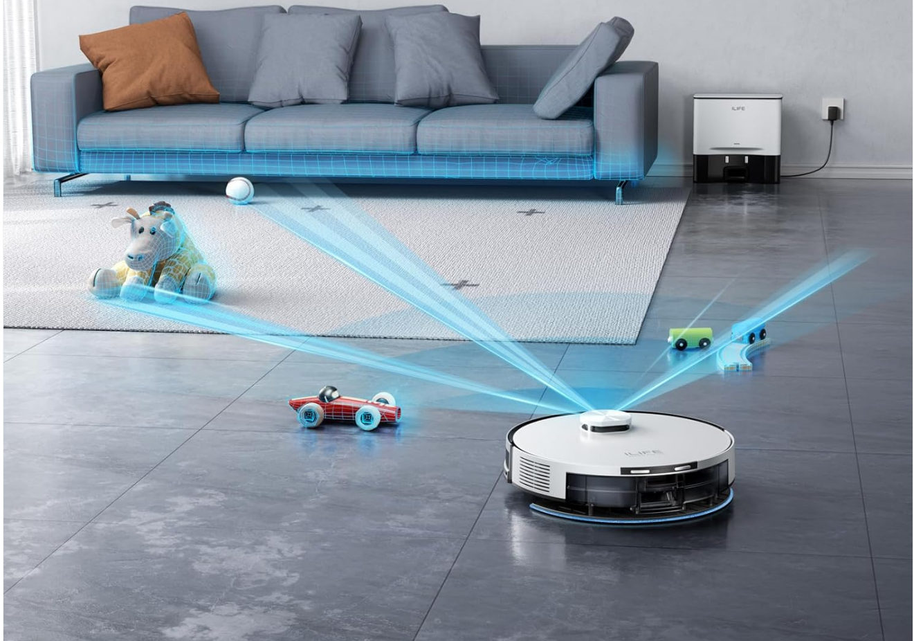
Figure 5: The ILIFE A30 Pro robot vacuum utilizing LiDAR navigation for smart home mapping, path planning, and efficient cleaning.