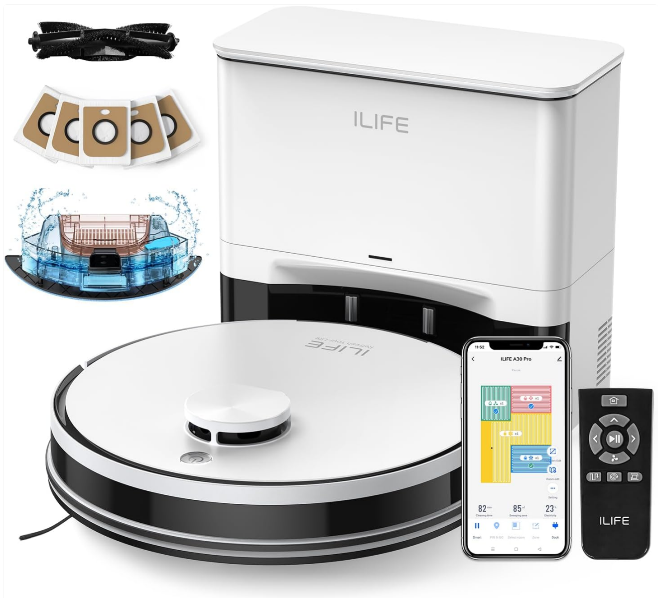
Figure 1: ILIFE A30 Pro Robot Vacuum and Mop Combo with its self-empty station, remote control, and a smartphone displaying the ILIFEClean app interface.