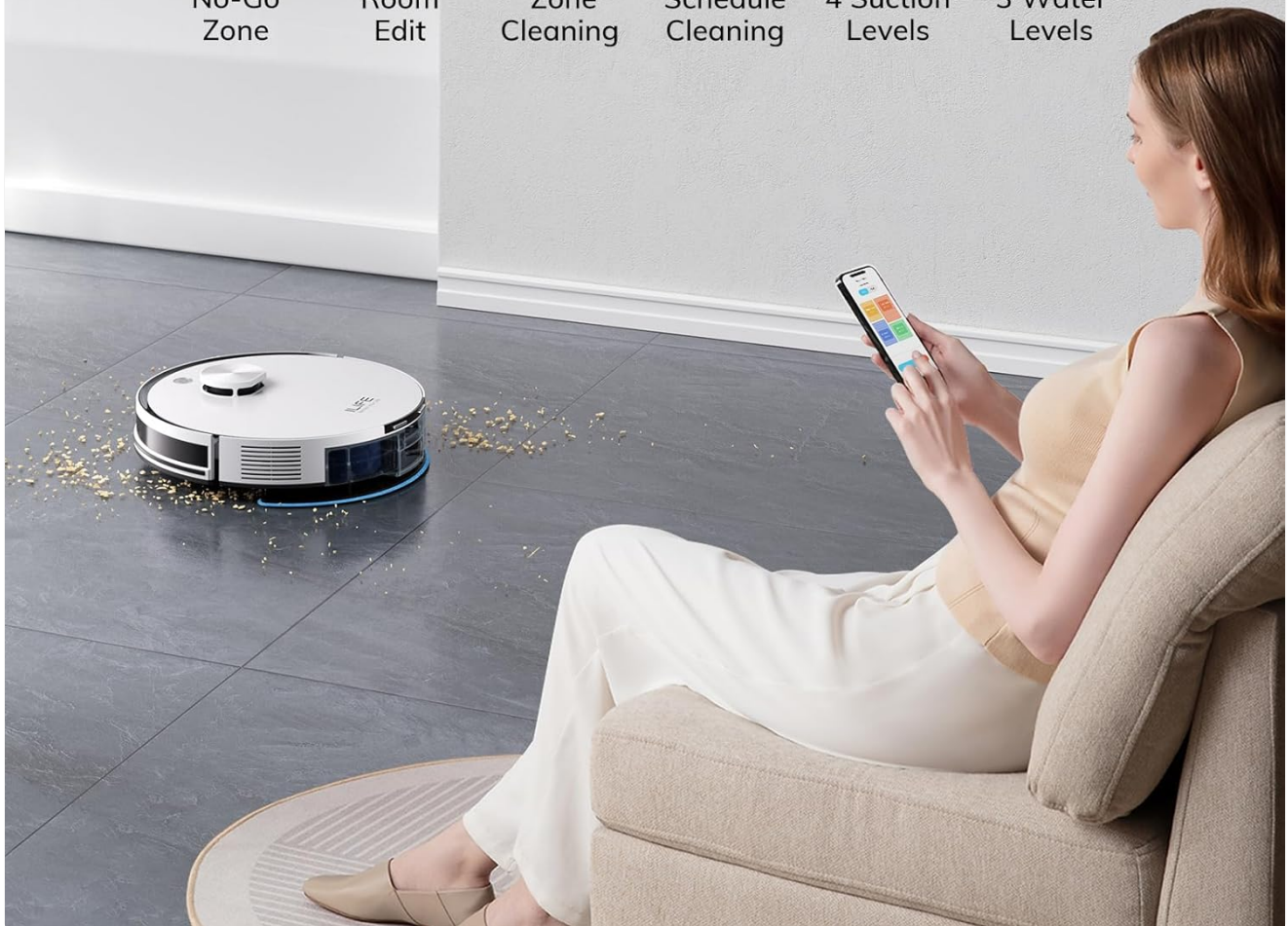
Figure 3: The ILIFEClean App interface, demonstrating features such as No-Go Zone, Room Edit, Zone Cleaning, Schedule Cleaning, 4 Suction Levels, and 3 Water Levels.