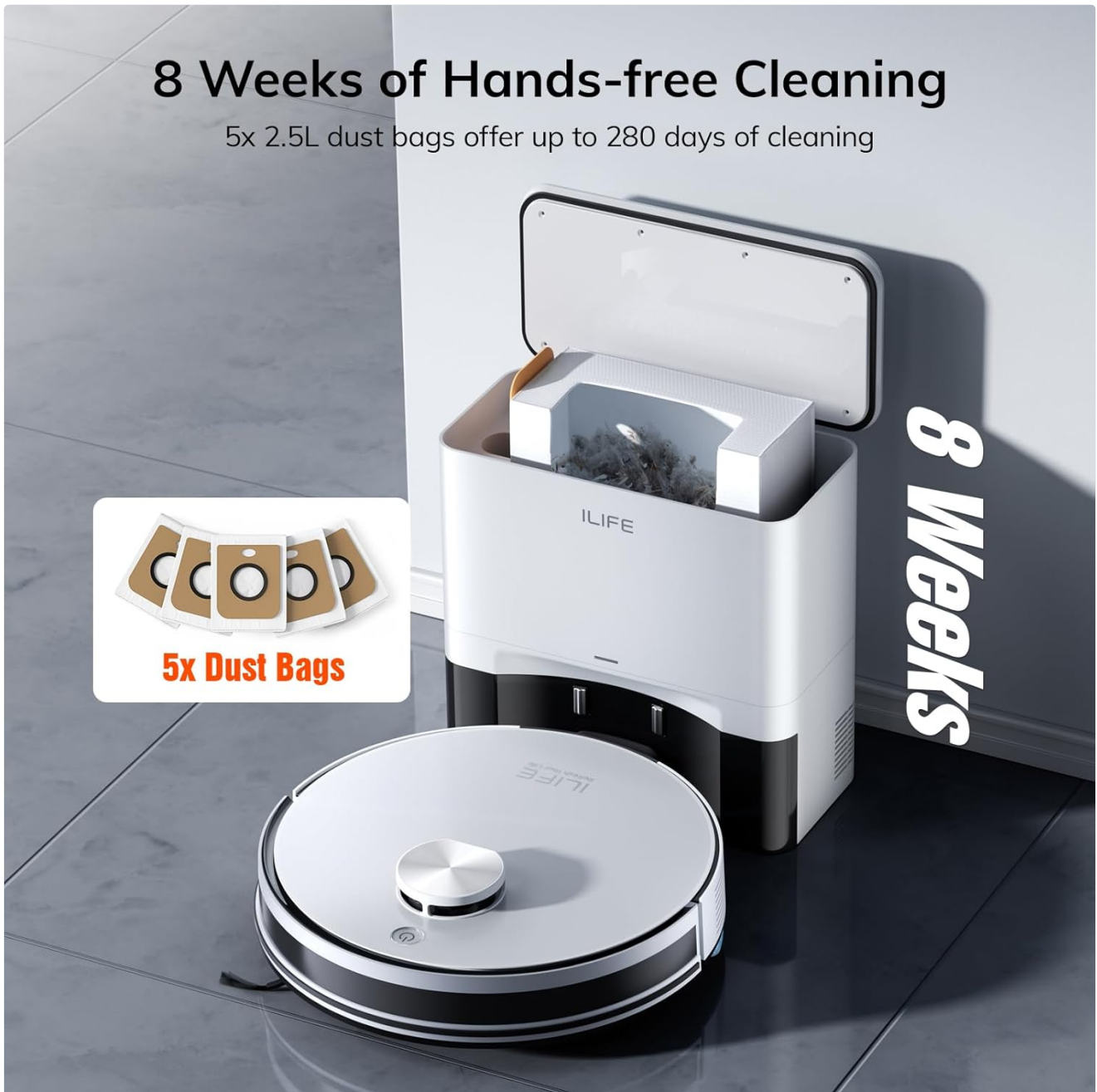
Figure 2: The ILIFE A30 Pro robot vacuum positioned next to its self-empty station, highlighting the included 5x 2.5L dust bags for extended hands-free operation.