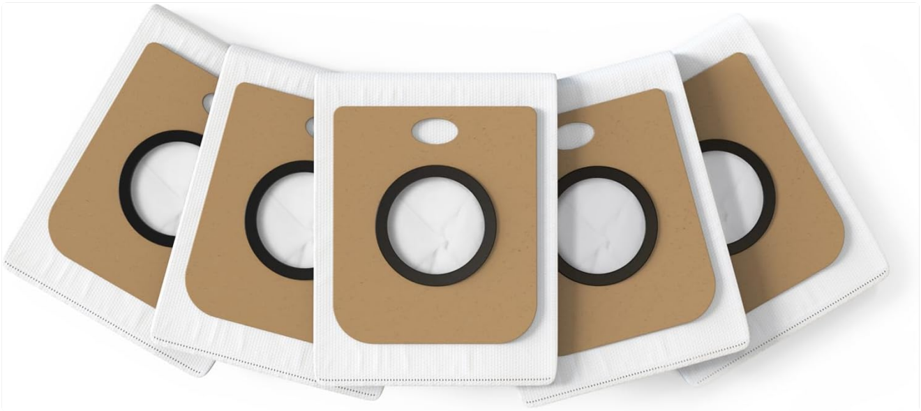
Figure 8: A pack of 5 replacement dust bags, designed for the ILIFE A30 Pro's self-empty station, ensuring extended maintenance-free operation.