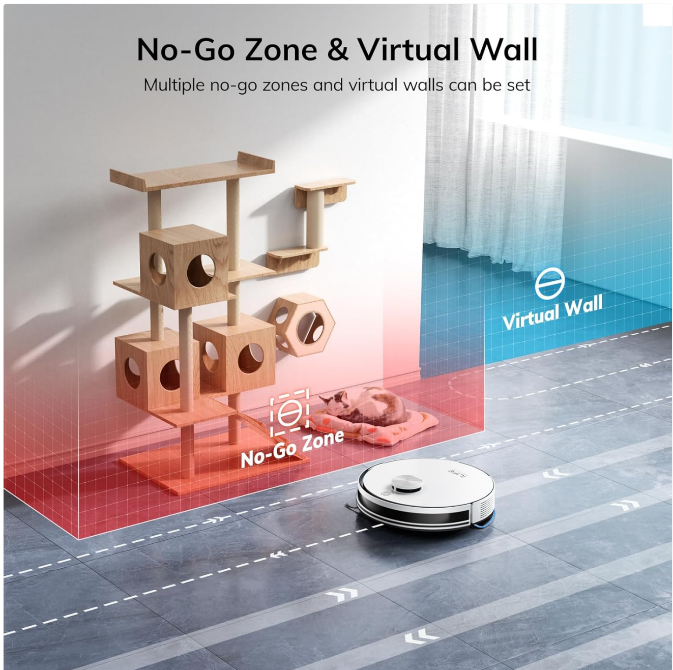
Figure 7: The ILIFE A30 Pro robot vacuum navigating around a designated No-Go Zone and Virtual Wall, which can be configured via the app.

Multiple no-go zones and virtual walls can be set