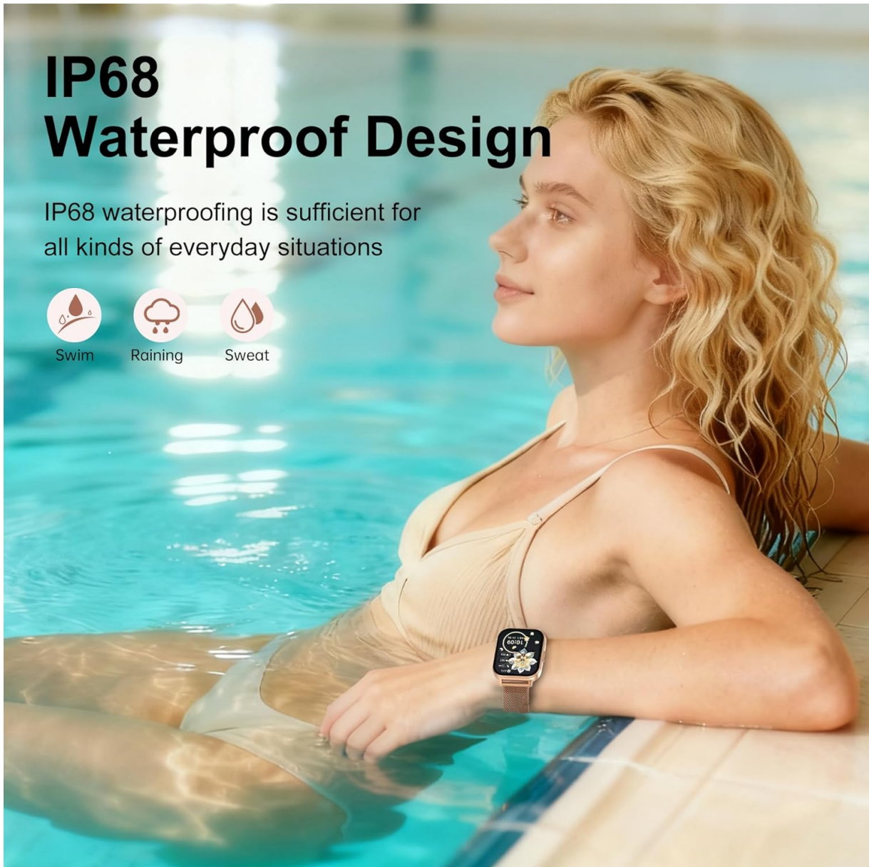
Image: A woman in a swimming pool wearing the smart watch, highlighting its IP68 waterproof rating.