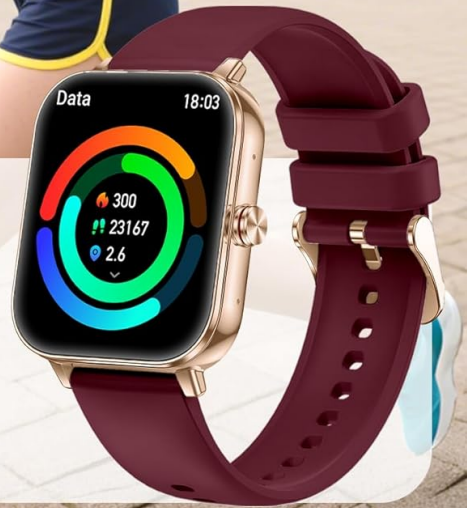
Image: A woman running, with the smart watch displaying activity data like calories, steps, and distance, alongside icons for various sports modes.