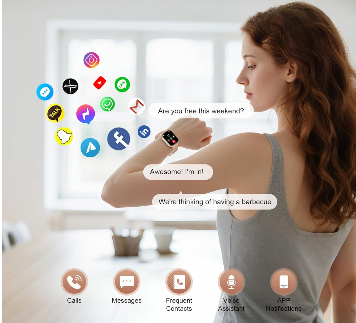
Image: A woman interacting with her smart watch, displaying various app notification icons.