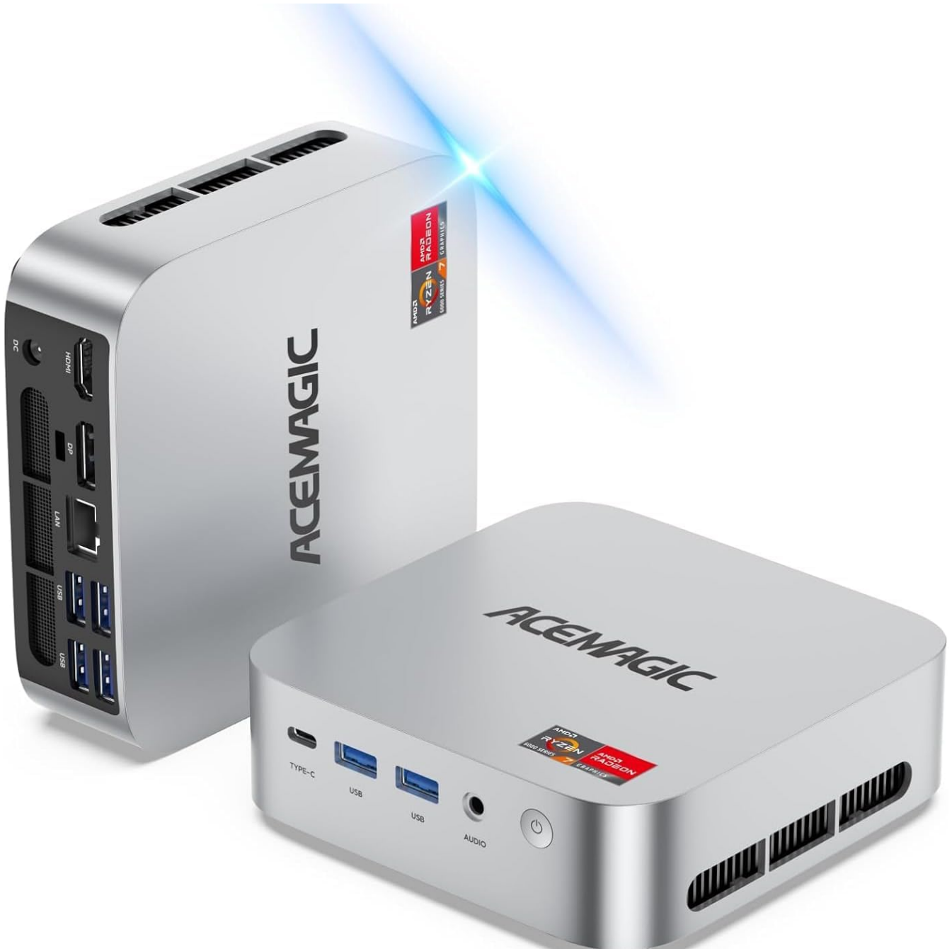
Image 3: ACEMAGIC M1 Mini PC connected and ready for initial setup.