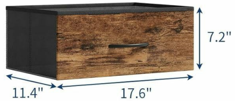
Image: Dimensional drawing of the dresser, indicating overall measurements and the sizes of the various drawers and compartments.