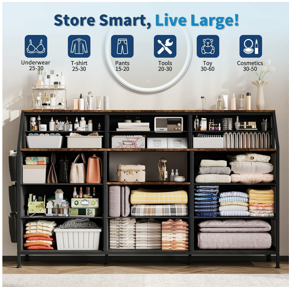
Image: An illustration showing the dresser's internal structure and how different items like underwear, T-shirts, pants, tools, toys, and cosmetics can be organized within its compartments.