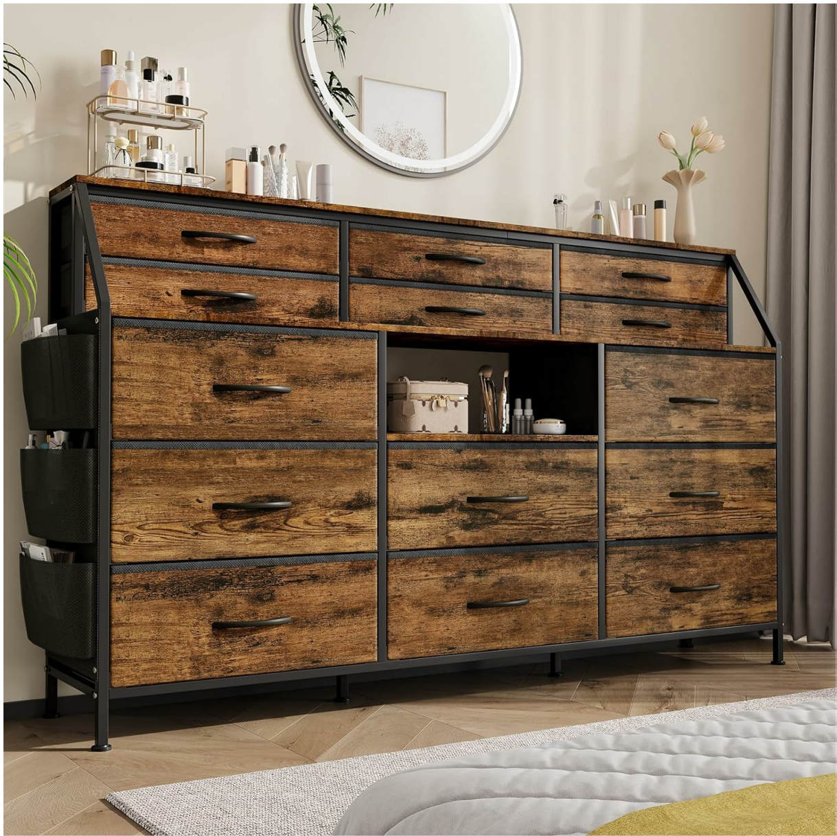
Image: The Garvee 14-Drawer Dresser, featuring a rustic brown finish, black metal frame, and various drawer sizes, positioned in a bedroom with a mirror and decorative items on top.