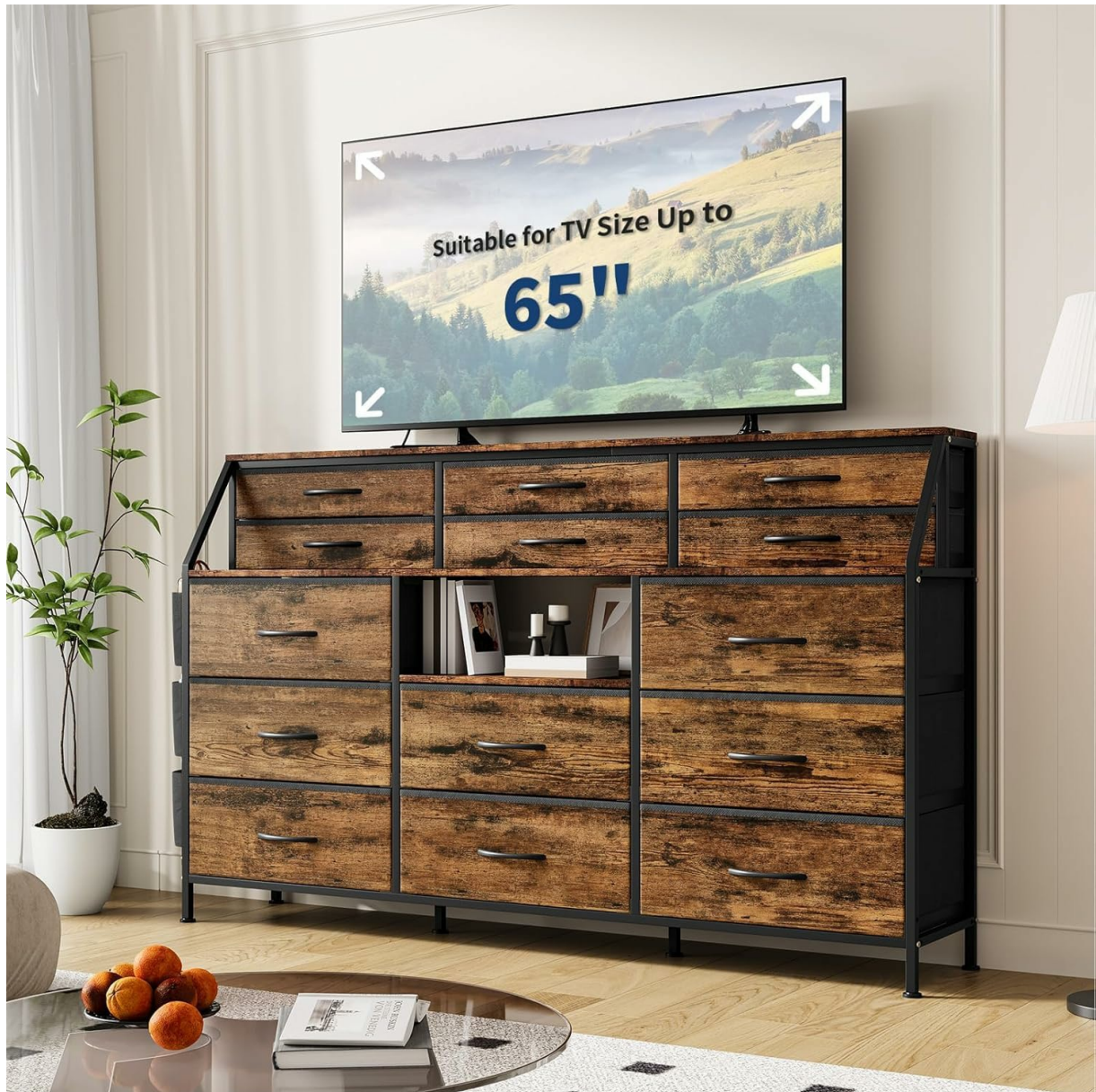
Image: The assembled dresser shown with a large TV on top, highlighting its robust design and potential use as an entertainment console.