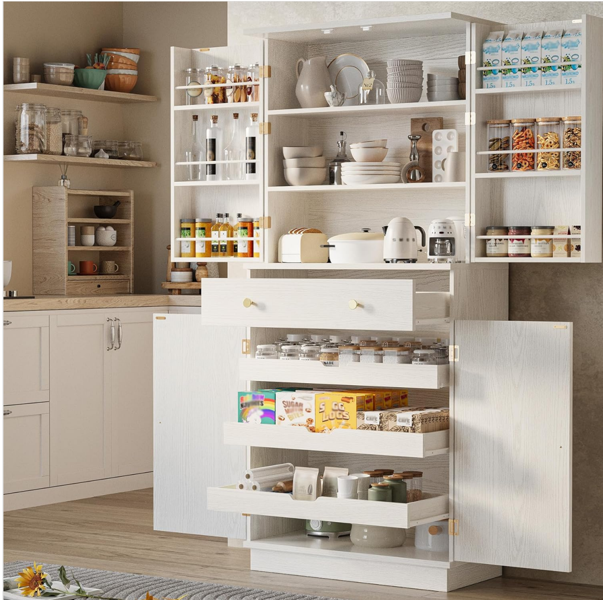
Figure 3.1: The IRONCK 72-inch Tall Kitchen Pantry Cabinet with all doors open, showcasing its various storage compartments, including door shelves, main shelves, and pull-out racks, filled with kitchen items.