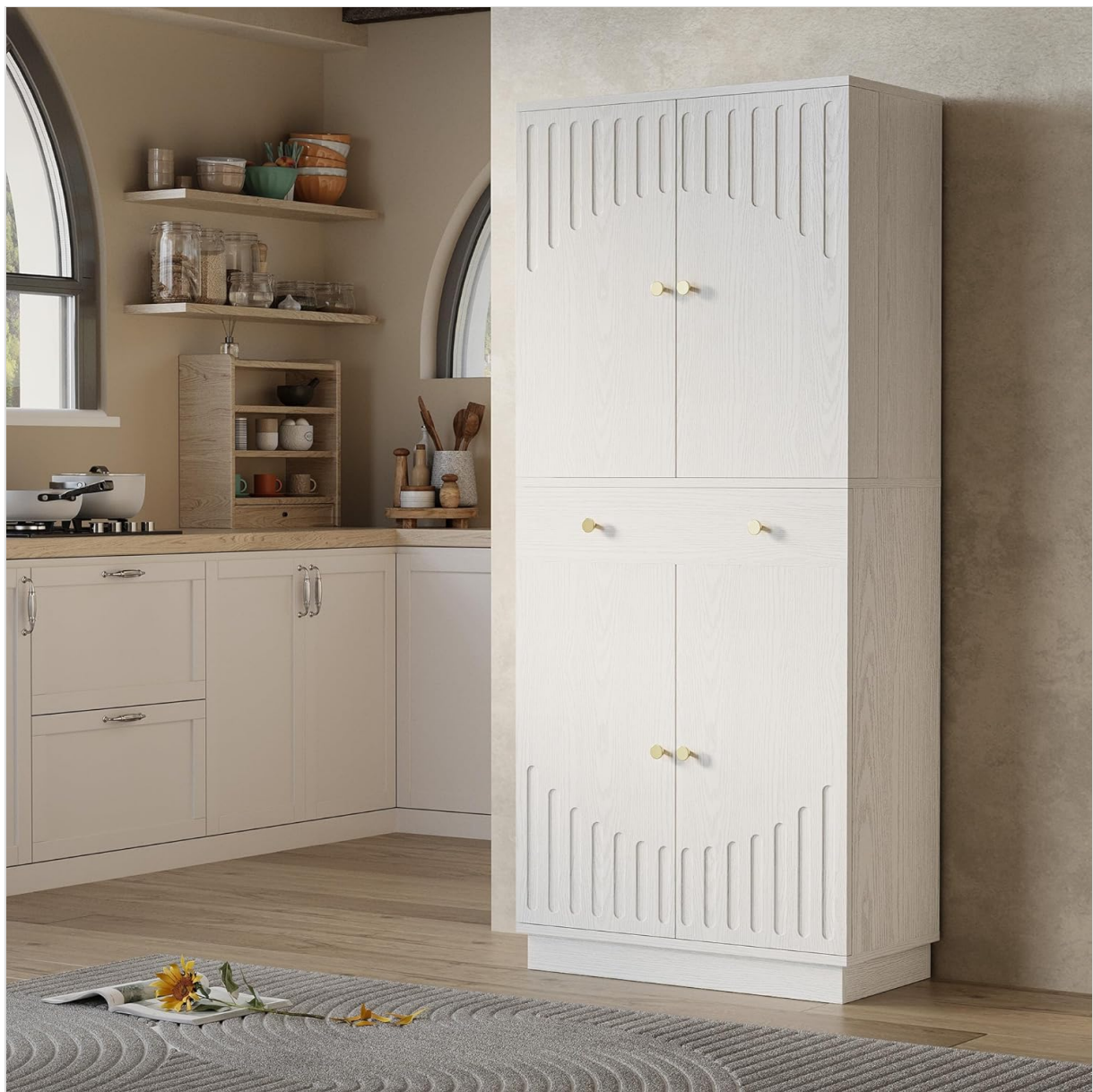
Figure 3.2: The IRONCK 72-inch Tall Kitchen Pantry Cabinet in a closed position, displaying its farmhouse-style design with arched door panels and golden handles, situated in a kitchen setting.