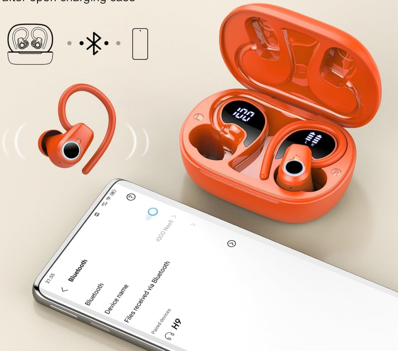
Image: The Poounur H9 charging case displaying battery levels for both the case and individual earbuds.