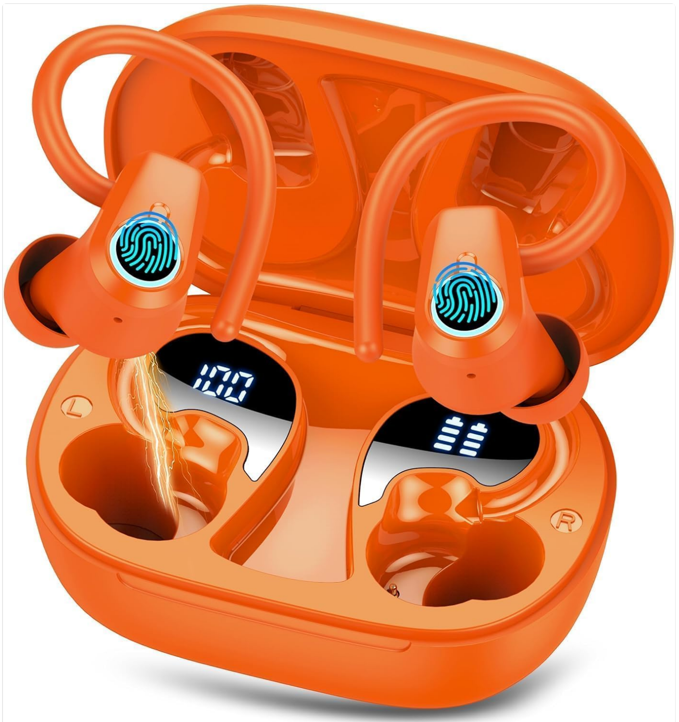
Image: The Pounur H9 earbuds resting in their open charging case, showcasing the digital LED battery display.