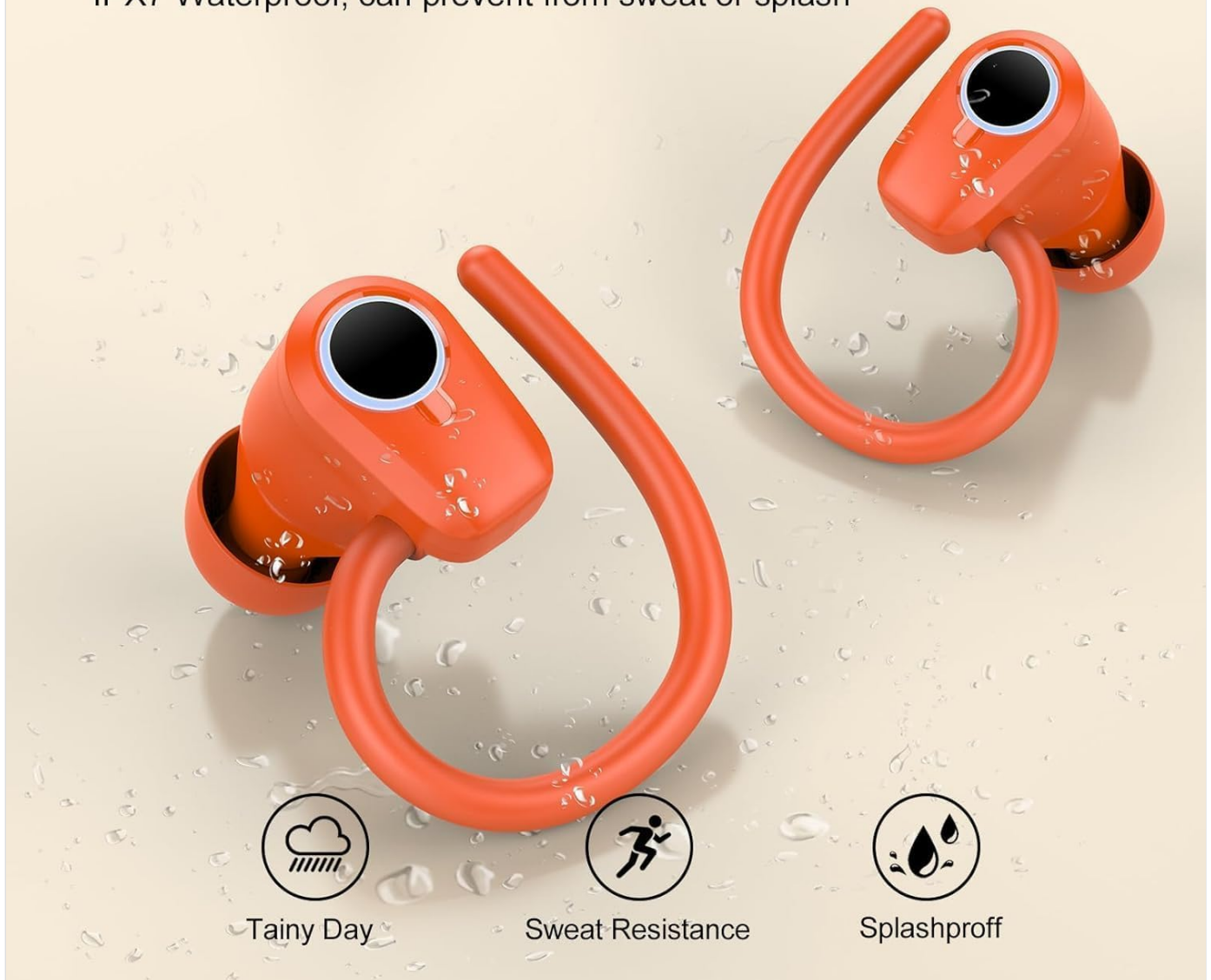
Image: The Poonur H9 earbuds shown with water droplets, illustrating their IP7 waterproof and sweat-resistant features.

With the nano coating, the sports running headphones supports IPX7 Waterproof, can prevent from sweat or splash