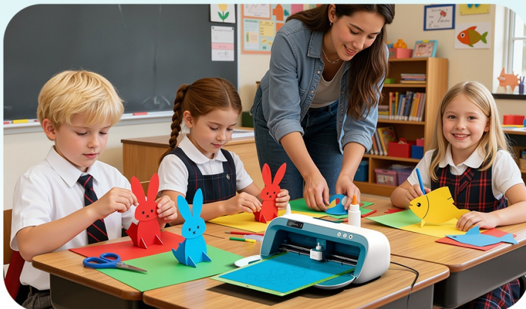
Image: The LIKCUT S41 Vinyl Cutter Machine with its complete set of included components and starter materials.