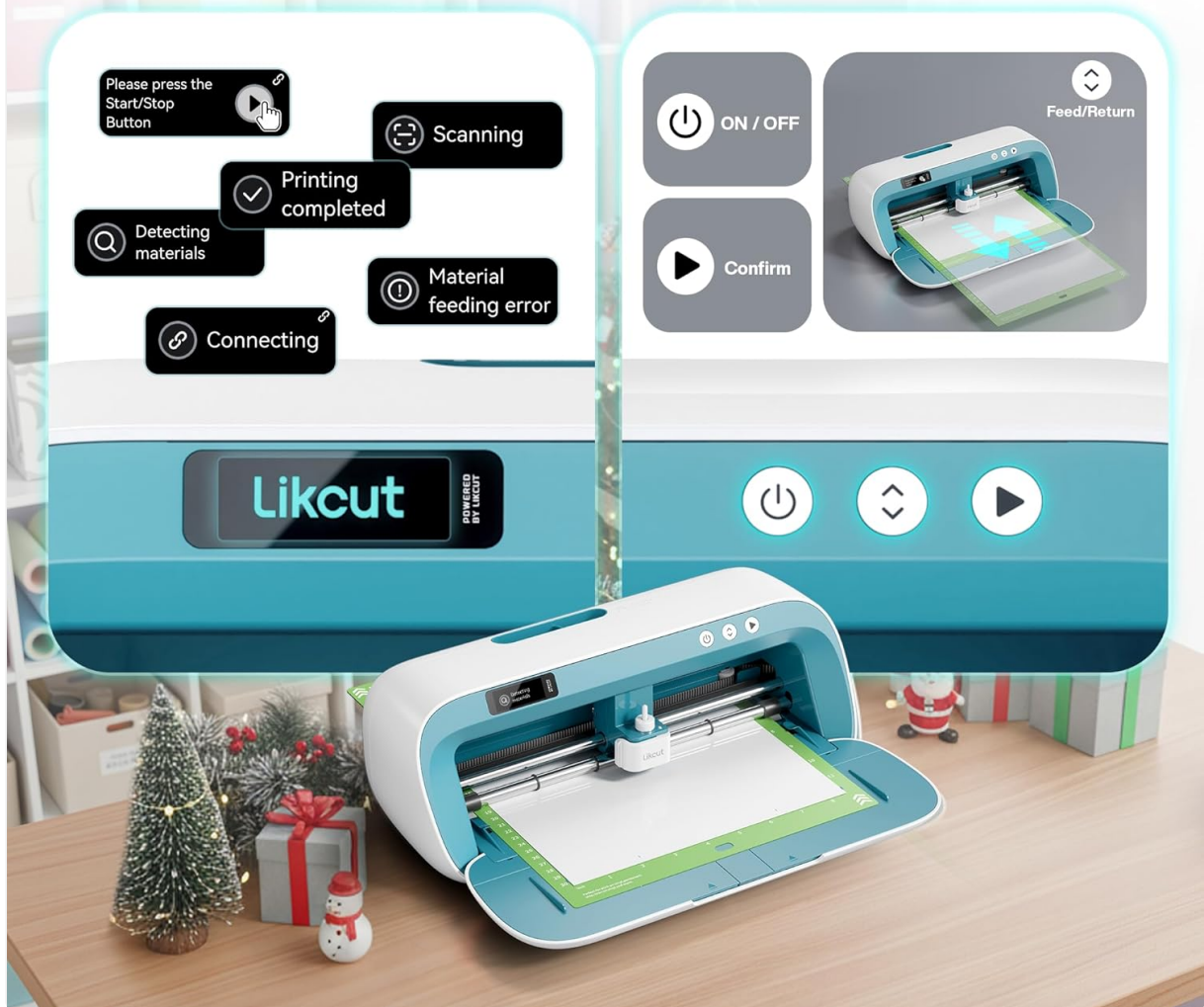
Image: The LIKUT S41's control panel, detailing its display for real-time status and one-touch buttons for key operations.