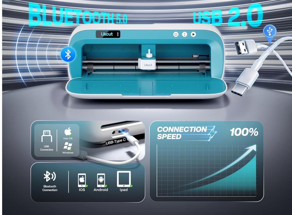
Image: The LIKCUT S41 highlighting its dual-mode connectivity via Bluetooth 5.0 and USB 2.0 for stable operation.