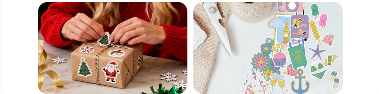
Image: The 'Print Then Cut' feature in action, demonstrating how the LIKUT S41 precisely cuts around pre-printed designs.