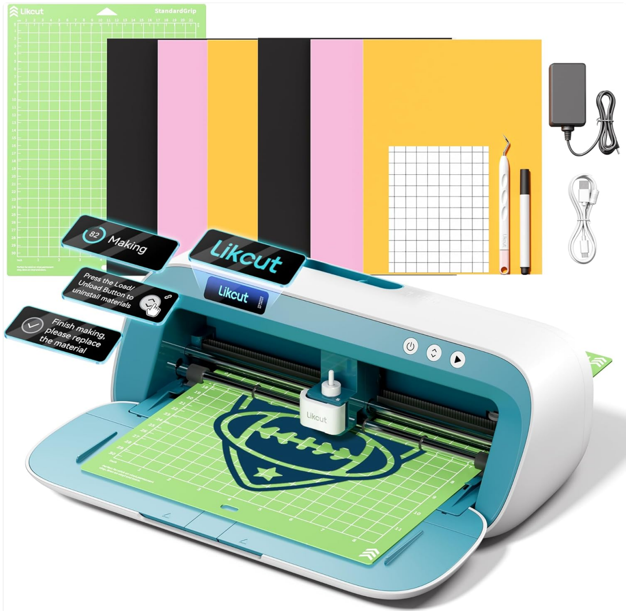
Image: The LIKCUT S41 Vinyl Cutter Machine, a compact device for creative projects.