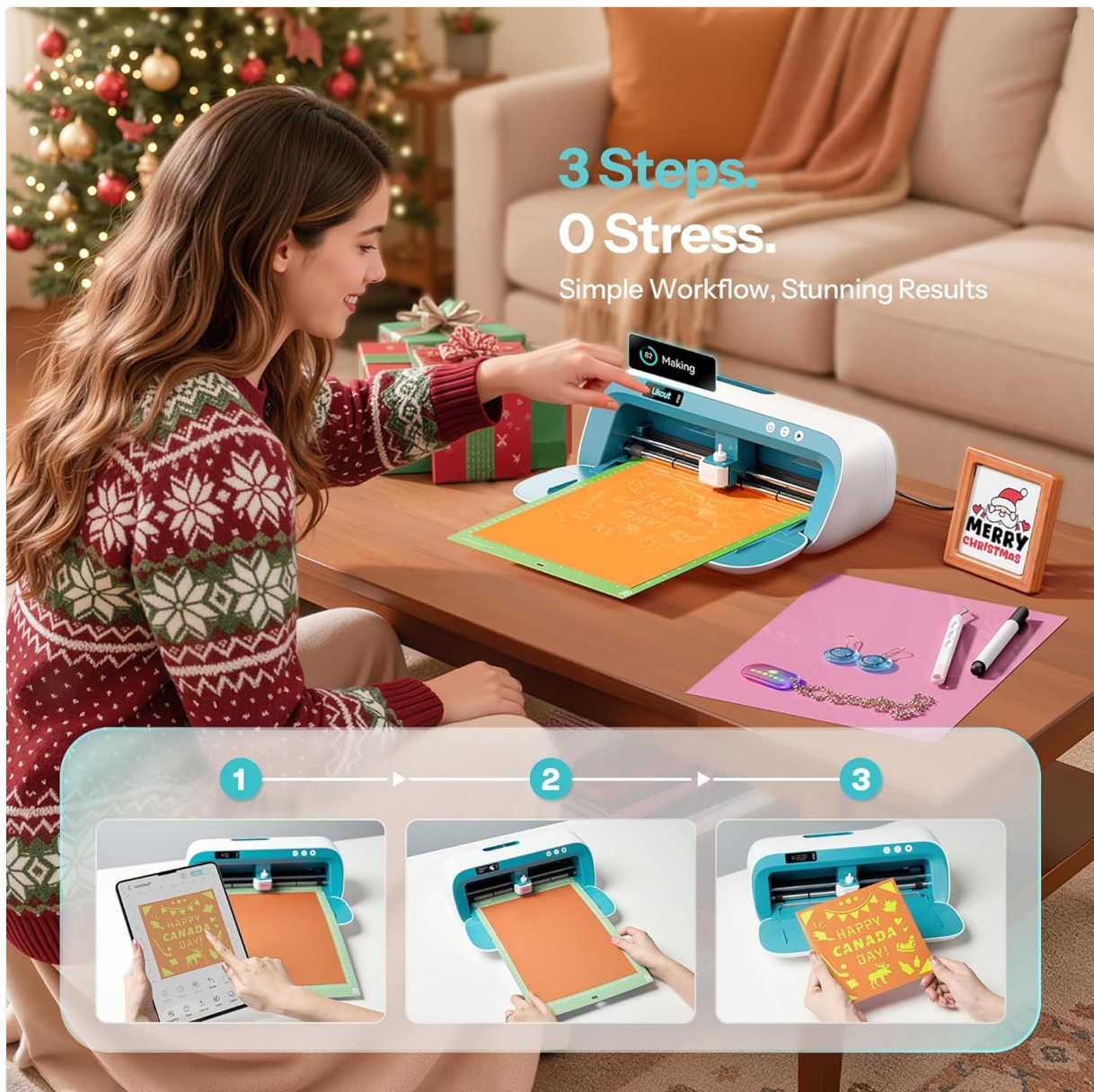
Image: A visual representation of the simple 3-step workflow for using the LIKCUT S41 Vinyl Cutter Machine.