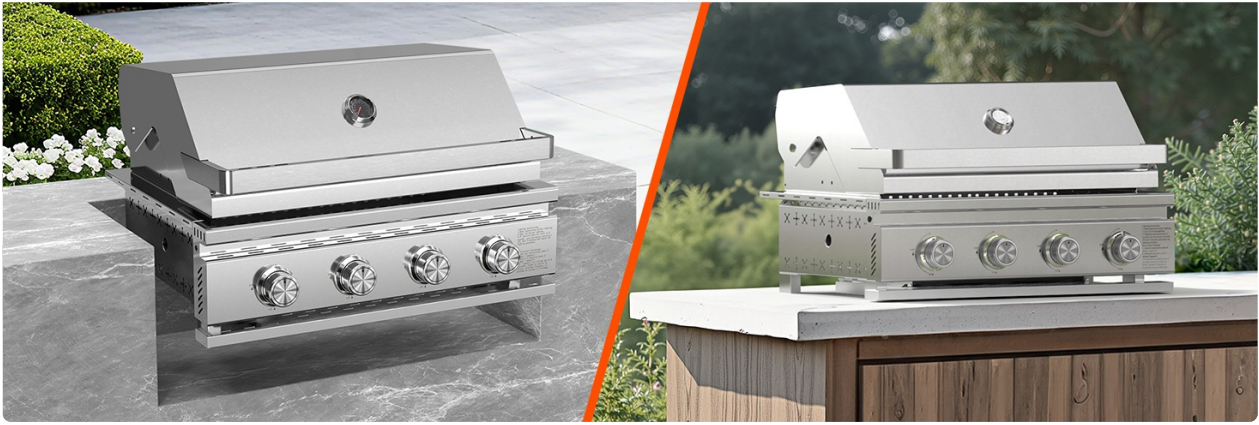
Image: Visual representation of the grill's versatile installation options, showing it both embedded into an outdoor kitchen island and placed as a freestanding unit on a countertop.