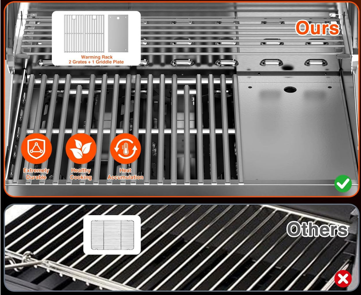
Image: A detailed view of the grill's interior, highlighting the durable cast 304 stainless steel cooking grates, griddle plate, and warming rack.