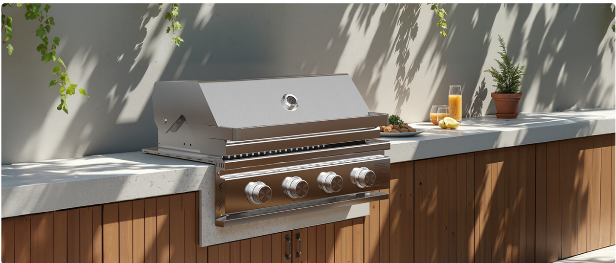
Image: The COWSAR 28-Inch 4-Burner Built-In Propane Gas Grill seamlessly integrated into an outdoor kitchen island, showcasing its sleek stainless steel design.

Thank you for choosing the COWSAR 28-Inch 4-Burner Built-In Propane Gas Grill. This manual provides essential information for the safe assembly, operation, maintenance, and troubleshooting of your new outdoor cooking appliance. Please read all instructions carefully before installation and use to ensure optimal performance and safety.