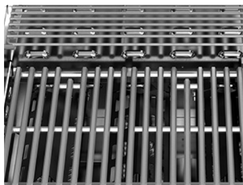
Image: A close-up view of the robust stainless steel cooking grates, designed for even heat distribution and durability.