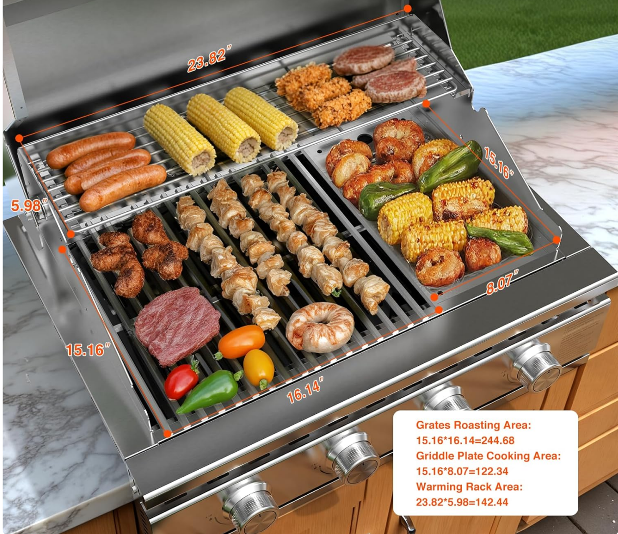
Image: The grill's expansive cooking area, featuring different foods like steaks, skewers, corn, and sausages distributed across the grates, griddle, and warming rack.