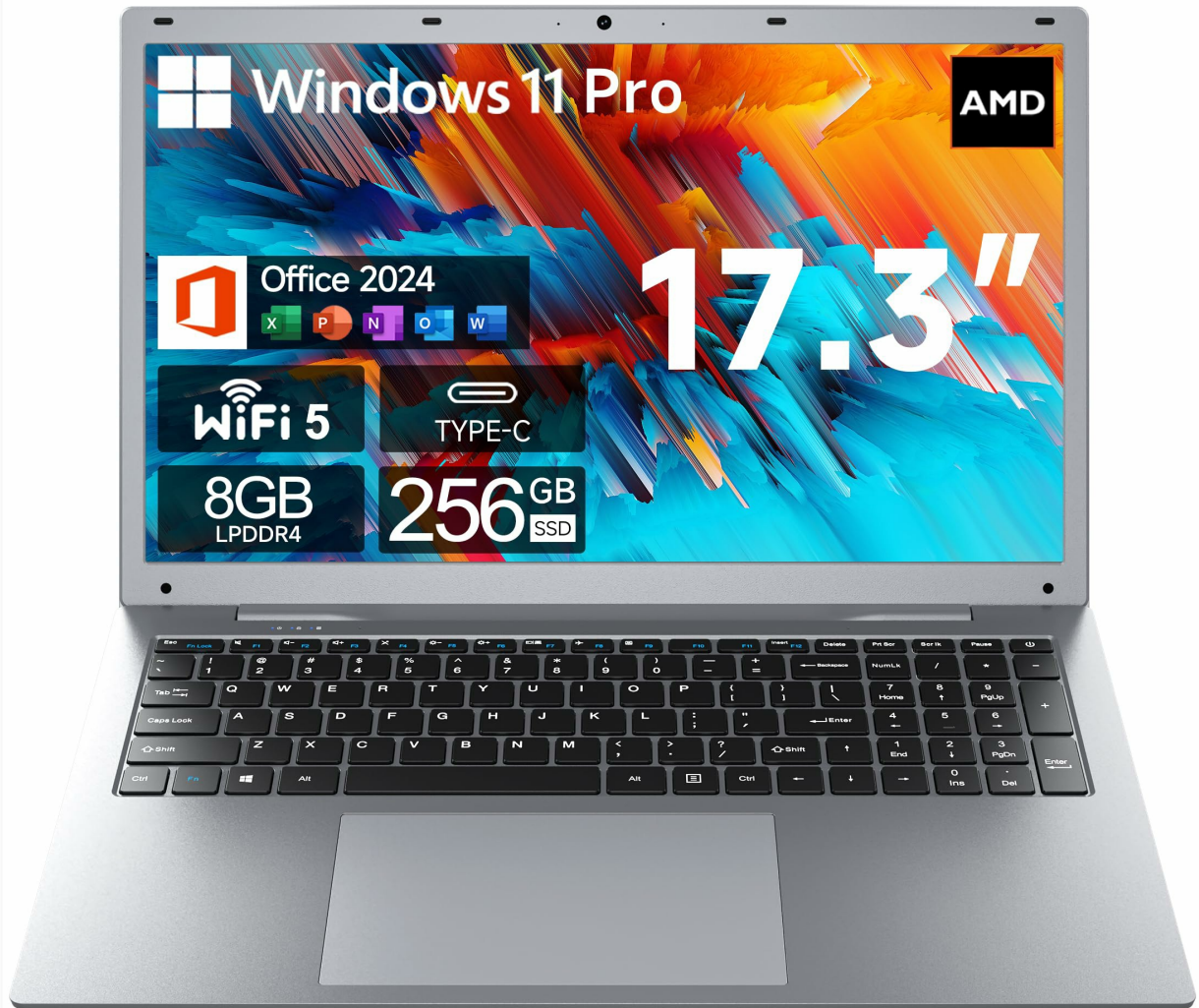
Image: The Akocsiy 17.3-inch laptop, showcasing its sleek design and large display.