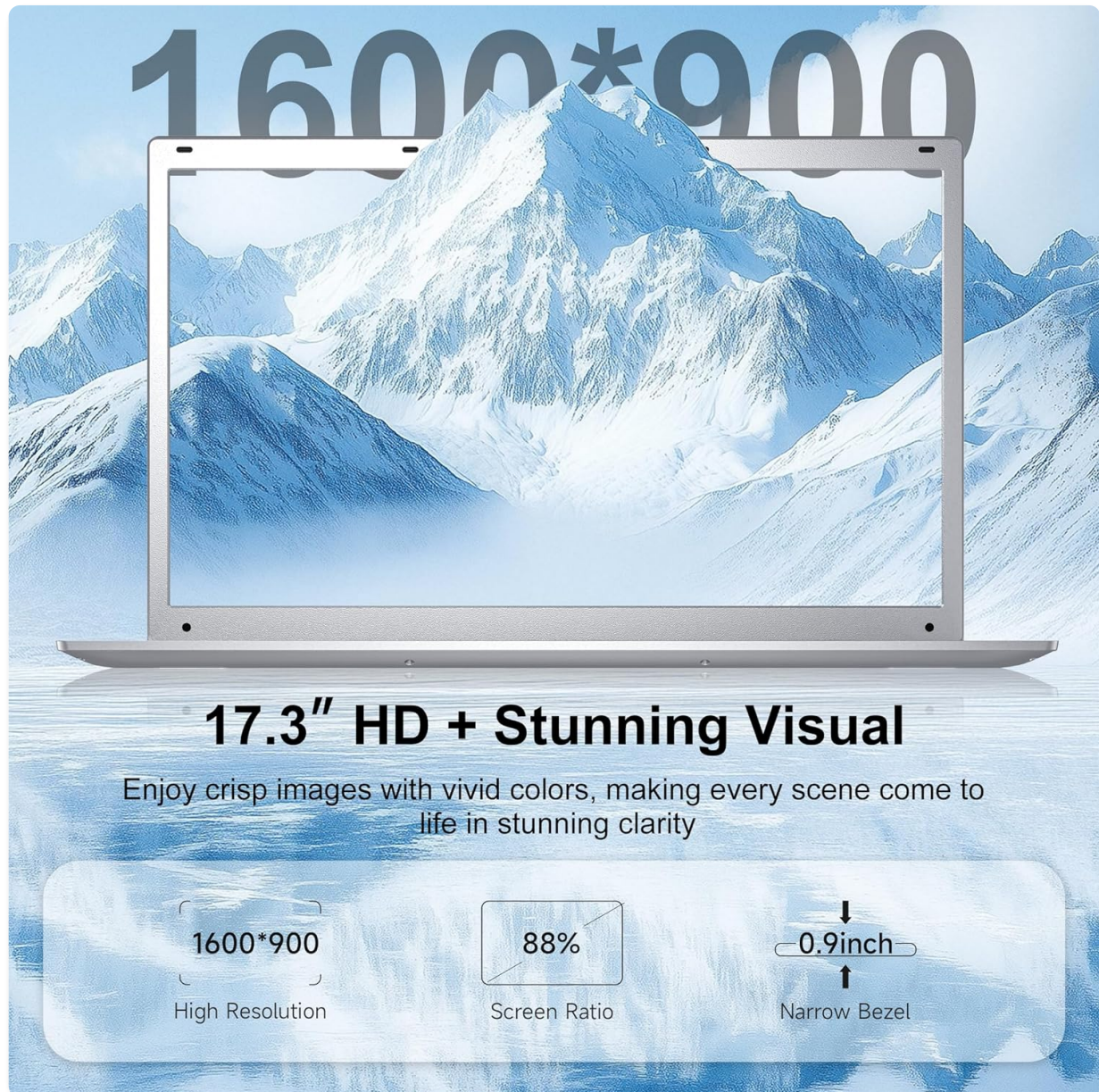
Image: The laptop's 17.3-inch HD display, illustrating its resolution and narrow bezels for an immersive visual experience.

The Akocrsiy laptop features a 17.3-inch TN display with a resolution of 1600x900 pixels, providing a clear viewing experience. The integrated graphics card handles visual output.