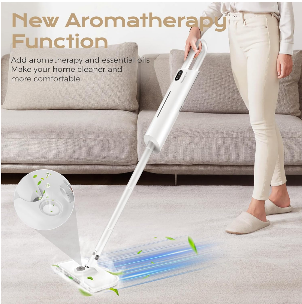
Image: The Mxnsedr MX-100A Steam Mop in use, highlighting the new aromatherapy function where essential oils can be added to the mop head for a pleasant scent during cleaning.

Add aromatherapy and essential oils Make your home cleaner and more comfortable