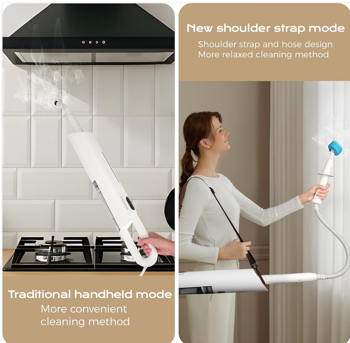
Image: The Mxnsewr MX-100A Steam Mop demonstrating both traditional handheld use and the new shoulder strap