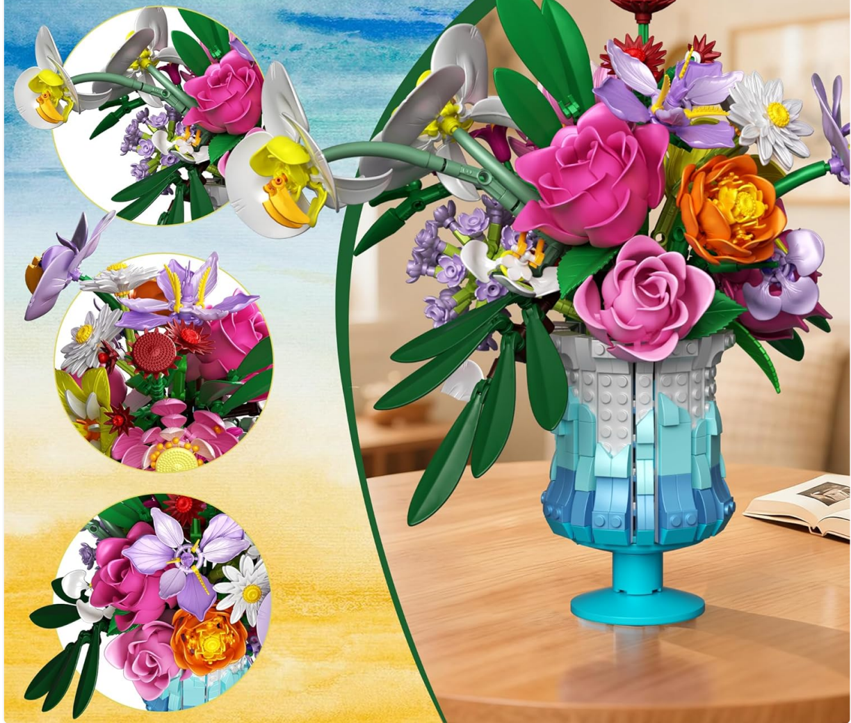
Image: The fully assembled Mavo brix Flower Building Set, featuring a diverse bouquet of colorful flowers in a blue gradient vase.