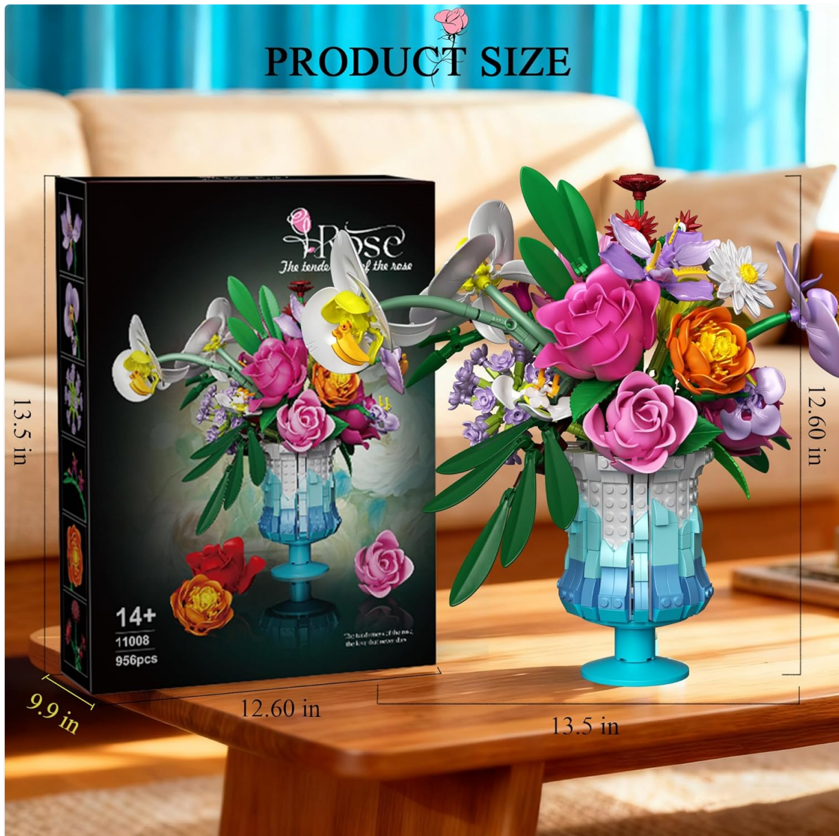
Image: The product packaging and assembled set, illustrating its dimensions.