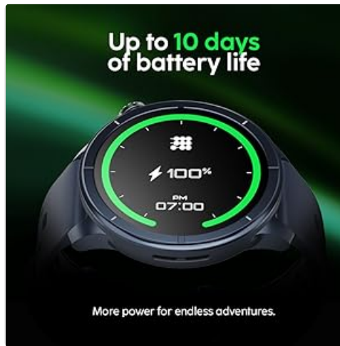
The smartwatch display indicating a full 100% battery charge, highlighting its long battery life.