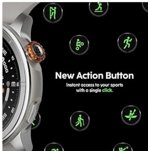
A close-up view of the smartwatch highlighting the new action button, designed for instant access to sports modes.