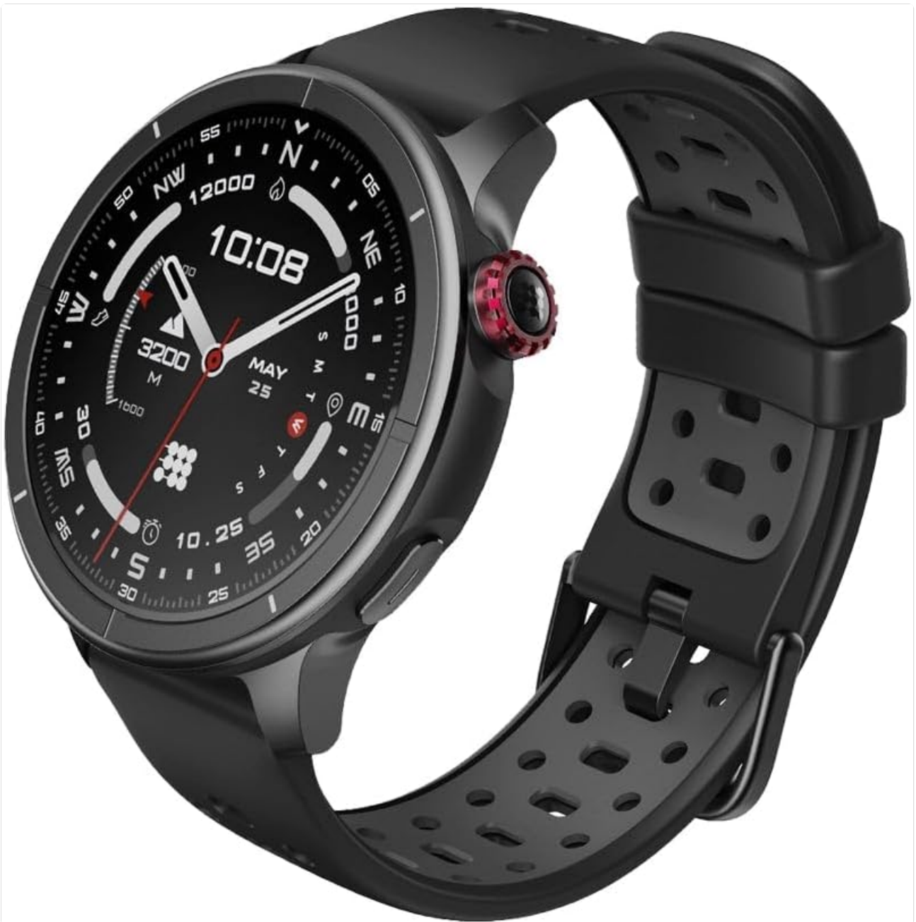
Front view of the Cubitt AURA Pro 2 Smartwatch, showcasing its circular display and black strap.