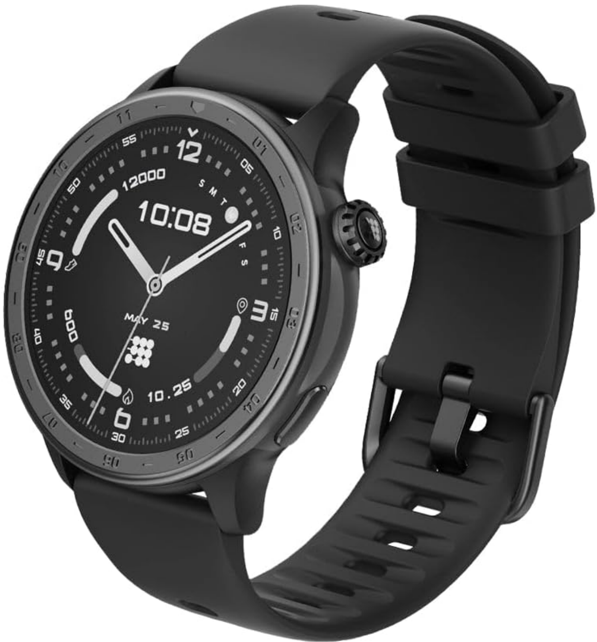
Image: Angled view of the Cubitt AURA 2 Smartwatch, showcasing its design.