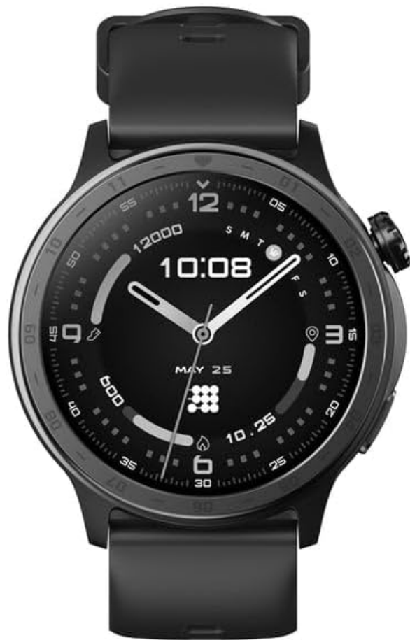
Image: Front view of the Cubitt AURA 2 Smartwatch.