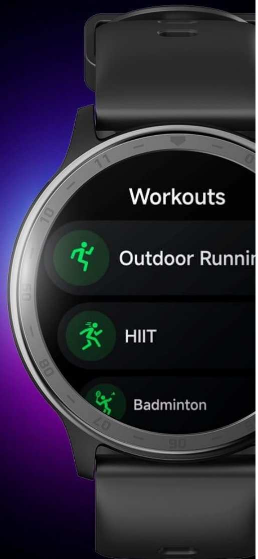
Image: The smartwatch displaying detailed workout metrics for enhanced precision.

Measure your performance with unmatched accuracy in every workout.