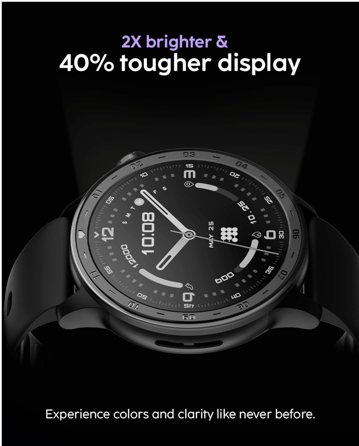
Image: The vibrant AMOLED display of the Cubitt AURA 2 Smartwatch.

The Cubitt AURA 2 features a 1.43" AMOLED touch display. Swipe left, right, up, or down to access different functions, widgets, and settings. Press the physical buttons on the side for quick access to specific features or to return to the home screen.