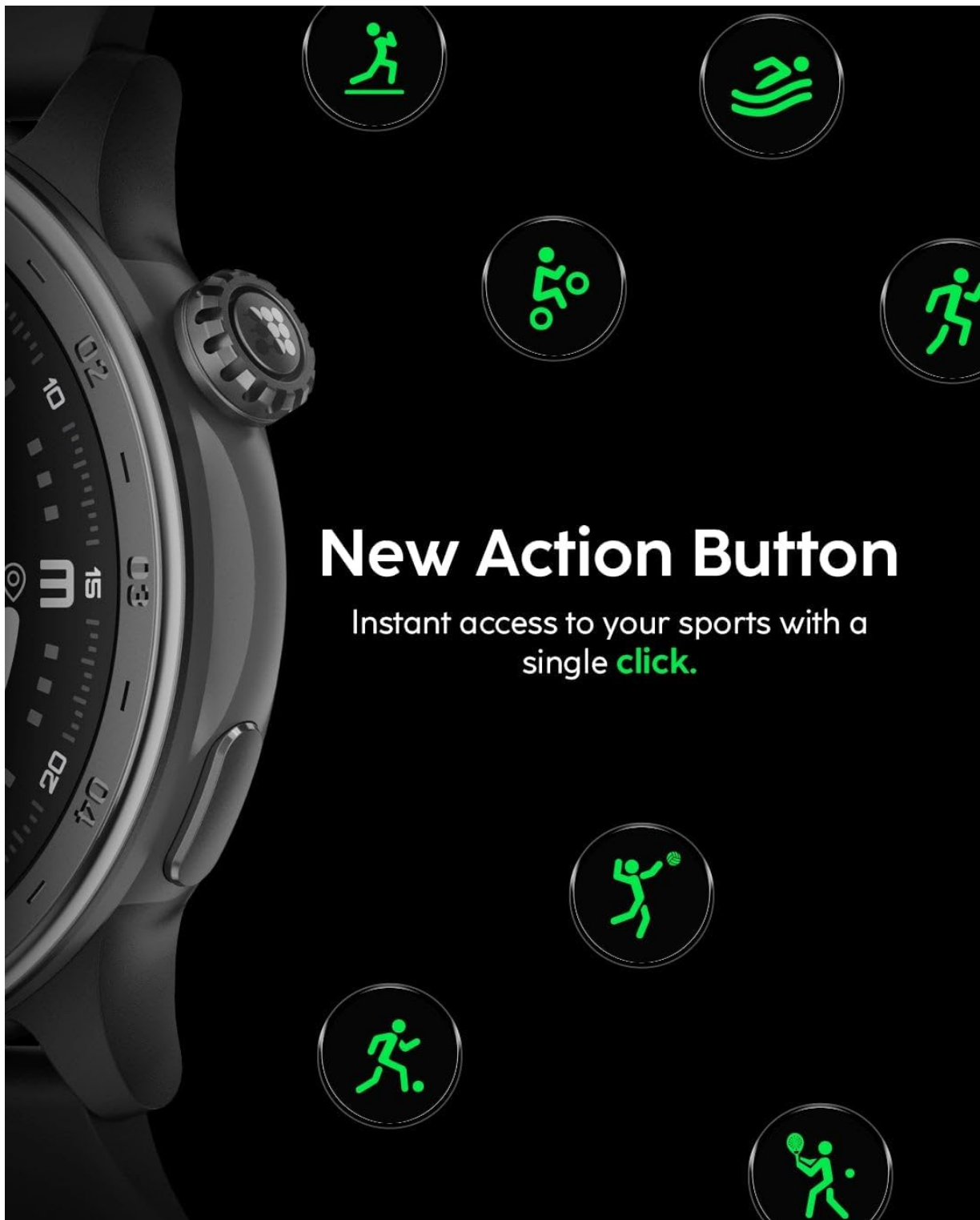
Image: Detail of the new Action Button for quick access to sports modes.