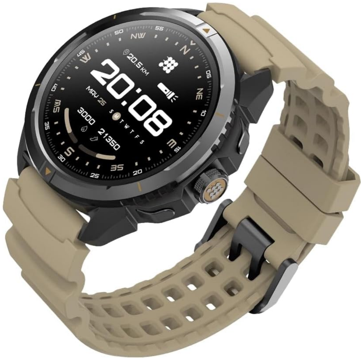
Figure 2: Side view of the smartwatch with the included strap.