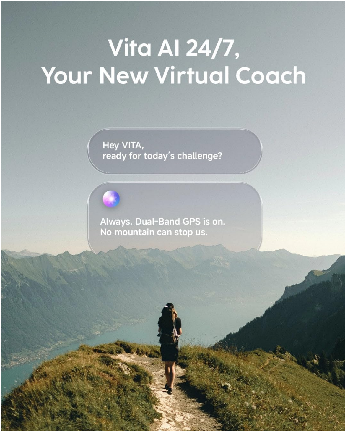
Figure 5: VITA AI voice assistant on the smartwatch display.

Always. Dual-Band GPS is on. No mountain can stop us.