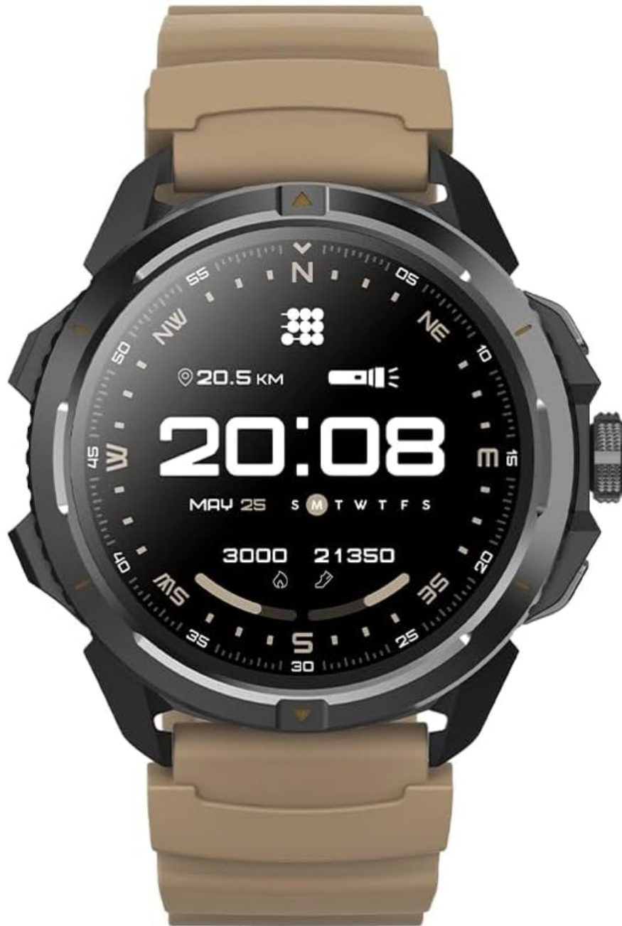
Figure 1: Front view of the Cubitt Terra Rugged Smartwatch.