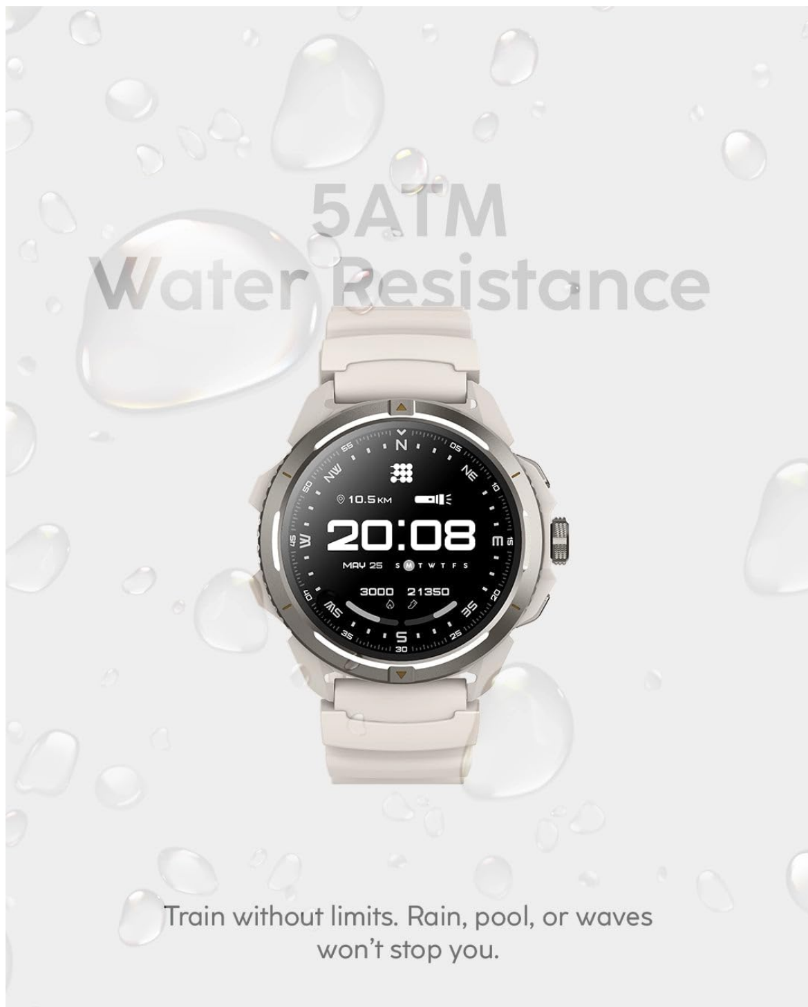
Figure 8: Smartwatch demonstrating 5ATM water resistance.