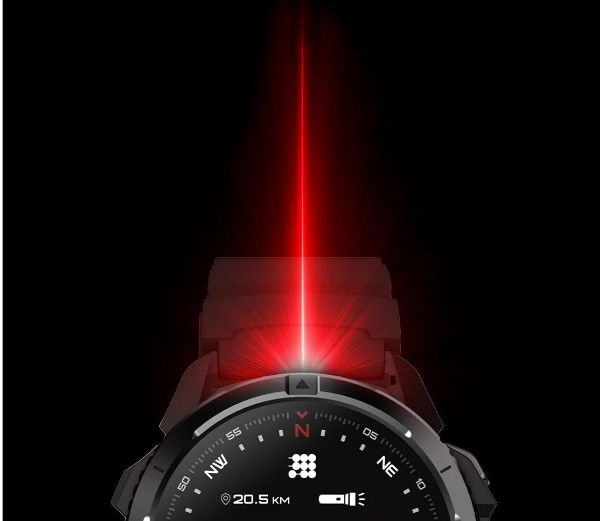
Figure 6: Smartwatch demonstrating its built-in flashlight feature.

Stay clear on your path, even in the dark.