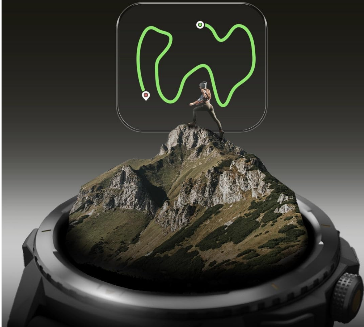
Figure 4: Smartwatch displaying GPS tracking and offline map capabilities.

Save your routes offline and track your metrics with greater accuracy.