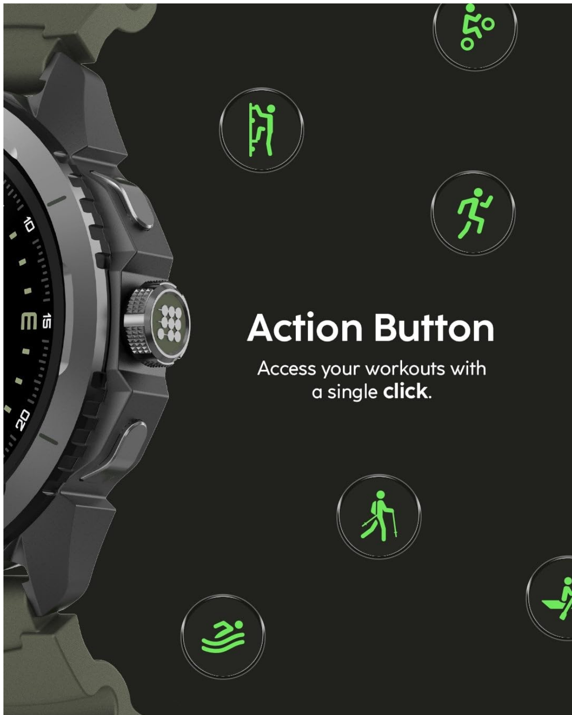
Figure 7: Smartwatch showing the action button and various workout modes.