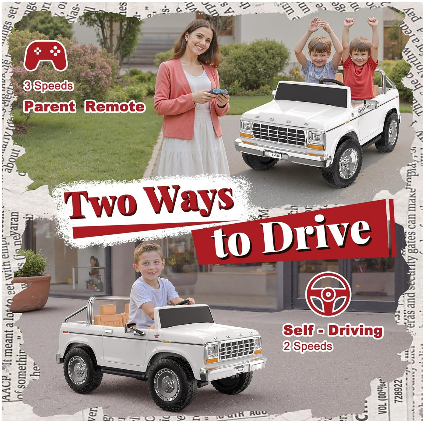
Image: The parental remote control, allowing adults to safely operate the ride-on car.