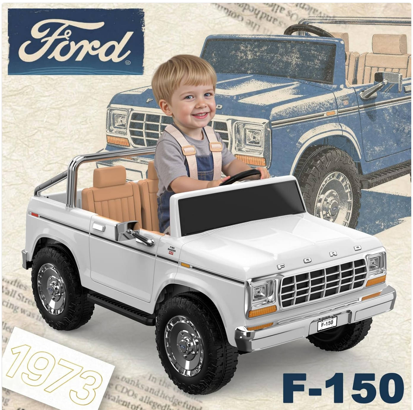
Image: The ANPABO Licensed Ford F-150 24V 2-Seater Ride-On Car, showcasing its classic design and a happy child enjoying the ride.